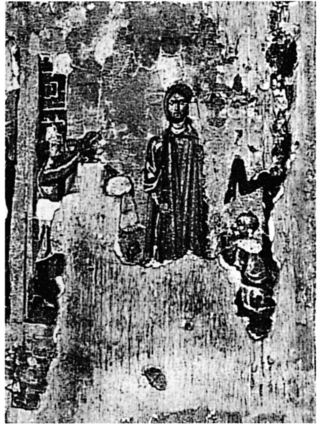
Fig. 3. Mocking of Christ. Icon with scenes of the miracles and Passion of Christ, St. Catherine, Sinai, twelfth century.

The question now needs to be asked why the dancers here are depicted as children. S. Radojčić supposes that the inclusion of children is inspired either by mime perfor-