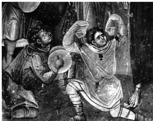
Fig. 2. Detail of Fig. 1.

Soldiers are aggressively involved in Christ's torment in the Mocking in St Nicholas at Prilep 19 . Christ is encircled by armed soldiers, some of them wearing helmets that extend down the back of the neck 20 . Christ is attired in a sumptuous purple mantle with a golden tablion, but his bare feet identify him as a false king. The soldier on the left is raising his hand, as if to strike Christ, while two other soldiers, one on either side of Christ, are insulting Christ by blowing horns close to his ears. A similar figure blowing a horn at Christ already existed in the twelfth-century Sinai Mocking (Fig. 3).