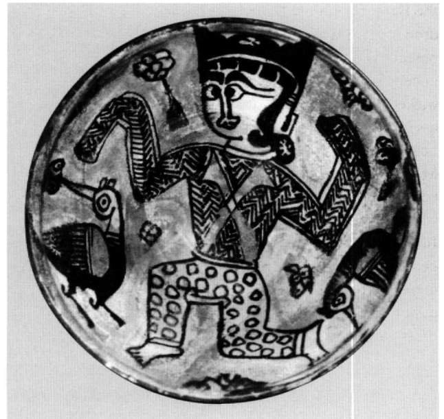
Fig. 6. Slip-painted ceramic bowl with a dancer. Iran, Nishapur, Teheran Foroughi Collection, tenth century.

Interestingly, we encounter a further indication of the negative aspect of this costume in the art of Spanish Christians, in the Beatus manuscripts. The Last Judgement in the Urgell- Beatus of the last quarter of the tenth century, Museu Diocesà de La Seu d'Urgell, Num. Inv. 501, fols 184v, 185r, as well as in the Facundus- Beatus of 1047, Madrid, Bibl. Nac., Vit. 14-2, fols 250v, 251r, represents the con-