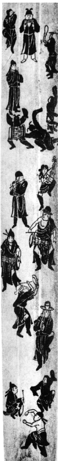
Fig. 5. Traditional Chinese popular performances. Ink painting on the surface of a bow, Shoso-in, Nara, eighth century.

Byzantine armies from the period following the Byzantine disaster at Manzikert in 1071 44 . It is in this period that the long-sleeved dancer emerged in Byzantine art.