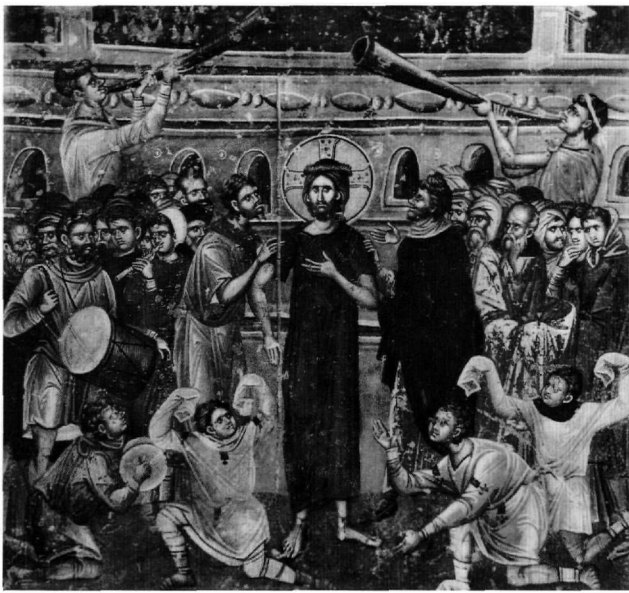
Fig. 1. Mocking of Christ. St George, Staro Nagoričino, 1316/17.

wearing a full-length tunic with long sleeves beside the frontal Christ and a soldier kneeling before him. A drummer and a man blowing his horn at Christ appear in the latter panel.