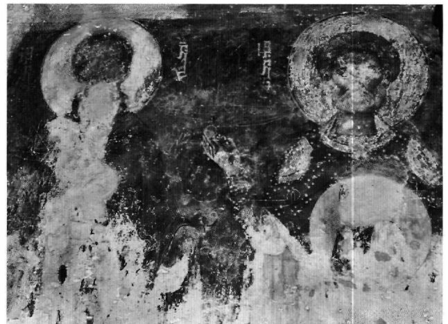
Fig. 5. Famagusta, “Nestorian” church. A holy monk and the martyr Menas, c. 1350-1370.