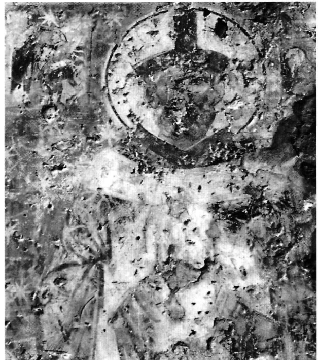
Fig. 7. Famagusta, Carmelite church. Saint Nicholas in western attire, c. 1350-1370.

Close to the figure of the Archangel Michael is displayed a remnant of fresco whose stylistic features point to still another artistic tradition, that of the Latin West (Fig. 8). Against a deep blue (or "ultramarine") background were originally represented three female figures; that of Saint Mary Magdalene can still be seen on the right, whereas the silhouette of a flying angel holding the edge of a cloth is the only preserved fragment of a major composition which most probably included a Vergin of Mercy spreading Her mantle over a group of worshippers. That the composition was in-