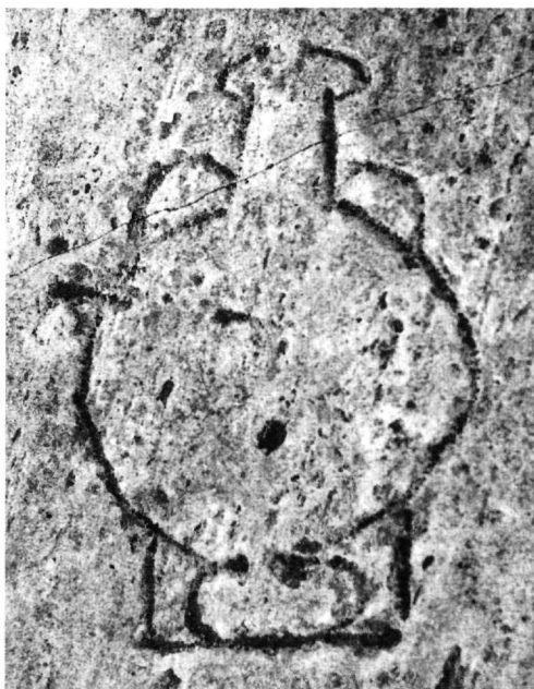
Fig. 1. Athens. Propylon of the Pompeion. Sketch plan on the marble pavement.