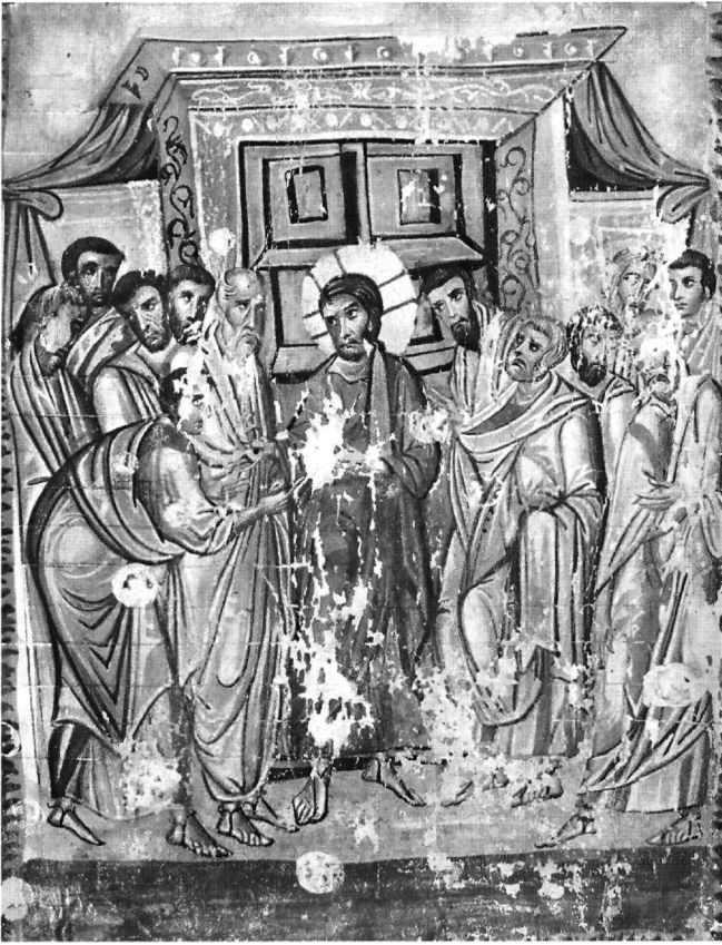
Fig. 7. The Incredulity of Thomas. The Trebizond Lectionary (Cod. gr. 21, National Library of Russia, St. Petersburg), f. 3v.

most balanced proportions and their poses are stable and natural. The faces are marked with deep furrows, however: there are triangular, dark hollows on the cheeks and tear-like bags under the eyes. The large hands with their excessively long fingers are crossed with dark and white bands. All these features invest the images of the emperors with dramatic tension.