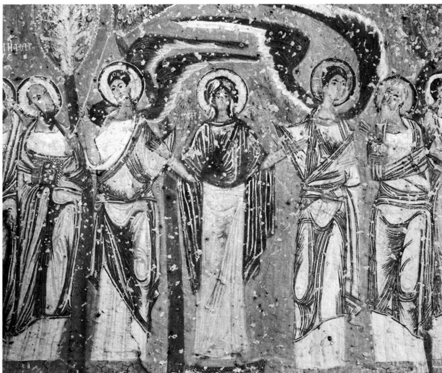
Fig. 4. Ascension. Great Pigeon House, Çavuşin, Cappadocia.

plex, multi-layered painting: volume is modelled by the gradual lightening of the main tone. Such close similarity in the types of faces indicates an orientation towards the tastes of the same period and the same milieu.