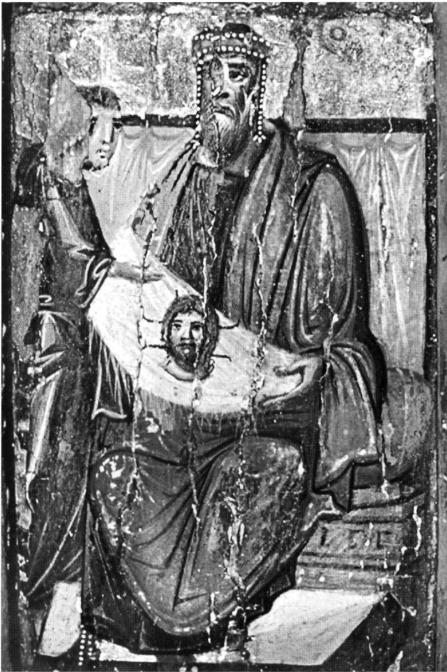
Fig. 6. King Abgar. Monastery of St Catherine, Mount Sinai.

church. In many other works of this period they are used more widely and boldly.