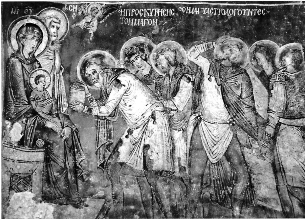
Fig. 3. Adoration of the Magi. New Tokali Church, Göreme, Cappadocia.

sioned by the future Emperor Nicephorus II Phocas and his relatives 15 . Their iconographic programme is based largely on local Cappadocian traditions 16 . However, the superb quality of the painting and the close affinity with artworks of the Macedonian Renaissance allow us to assume that the ensemble was produced by masters who were connected in some way or other with Constantinople 17 .