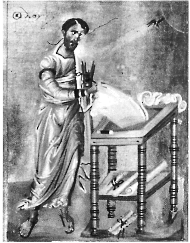
Fig. 8. St. Luke. New Testament (cod. Add. 28815, The British Library, London), f. 162v.

Thus, as our survey shows, the non-classical trends in painting of the third quarter of the tenth century were fairly strong and widespread. Nevertheless, even against this background the miniatures of the Trebizond Lectionary remain a unique phenomenon. No other work of this period can rival them in power of emotional impact. The question remains as to where such a clearly expressed desire to return to the