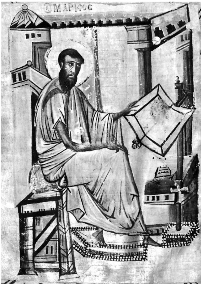
Fig. 1. Evangelist Mark. The Trebizond Lectionary (Cod. gr. 21, National Library of Russia, St. Petersburg), f. 5v.

Evangelia i ego mesto v traditsii illiustrirovania vizantijskogo leksionaria", Vizantija v kontekste mirovoj istorii. Materialy naučnoj konferentsii, posviaščenoj pamiatii A.V. Bank , Saint Peterburg 2004, 42-52. A. Zakharova, "The Original Cycle of Miniatures in the Trebizond Lectionary and its Place in the Byzantine Tradition of the Lectionary Illustration", Nea Rhome 2 (2005) [= Ampelokepion. Studi di amici e colleghi in onore di Vera von Falkenhausen , II], 169-192.