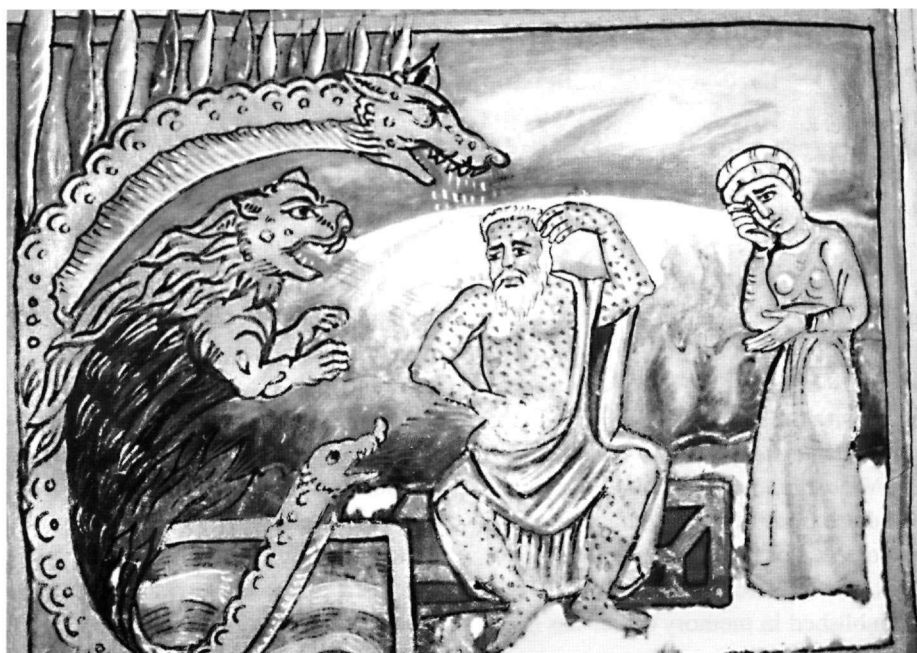
Fig. 1. Job and the Adversary , Vat. gr. cod. 749 (f. 25).

749 and Patmos cod. 171 the meaning of the word διάβολος is certainly adversary .