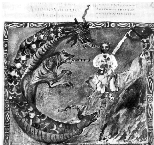
Fig. 2. Job and the Adversary , Patmos cod. 171 (f. 51).

which concerns the celestial war at the end of time may be cited as an example: 'The great dragon (δράκων) was thrown down, that serpent (ὄφις) of old that led the whole world astray, whose name is Satan (ὁ Σατανάς), or the Devil (Διάβολος)'.