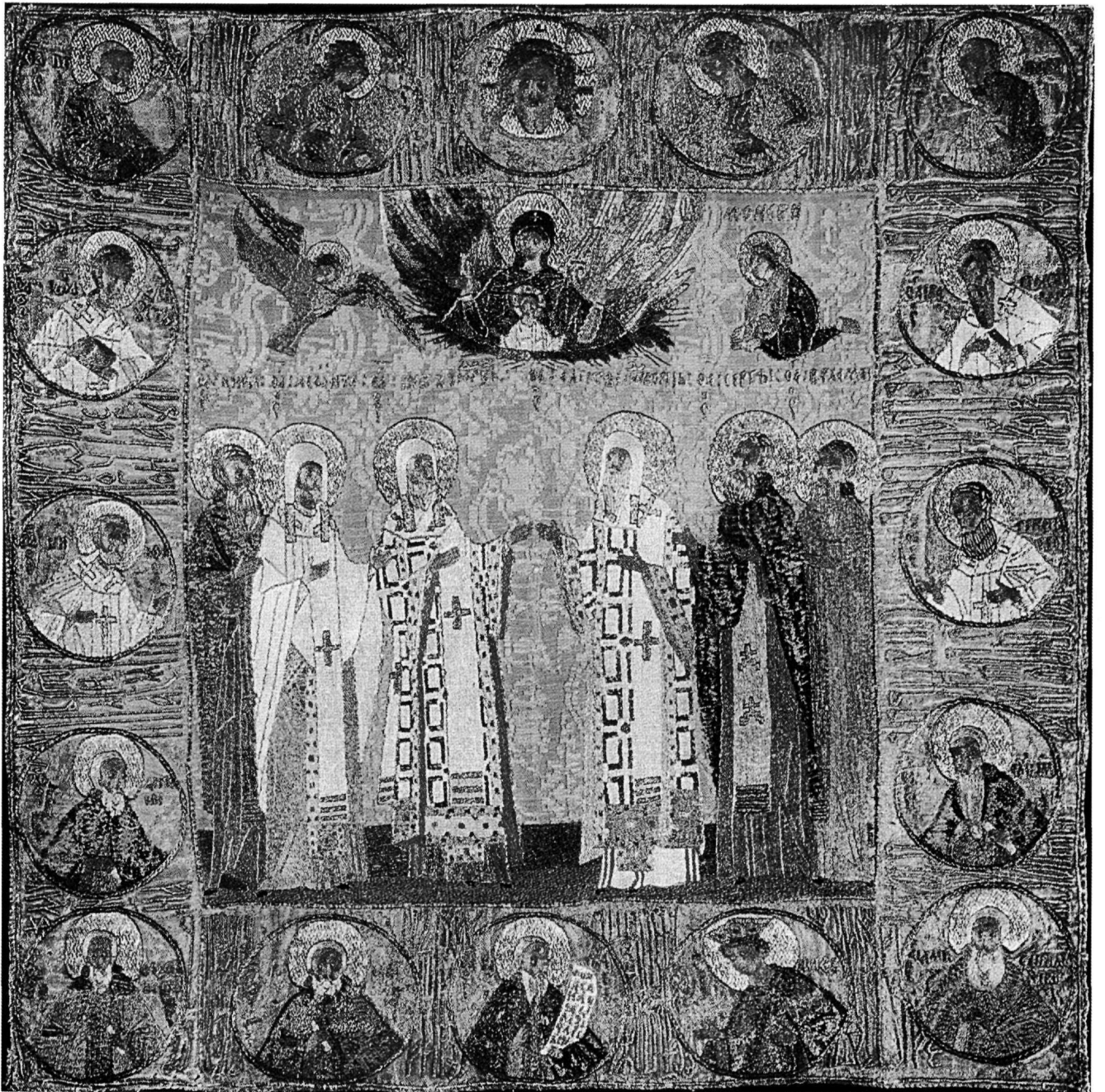
Fig. 4. Holy Virgin of the Burning Bush with selected saints. Embroidered podia. Late 15th century. Russian Museum. From the Kirillo-Belozersk Monastery.