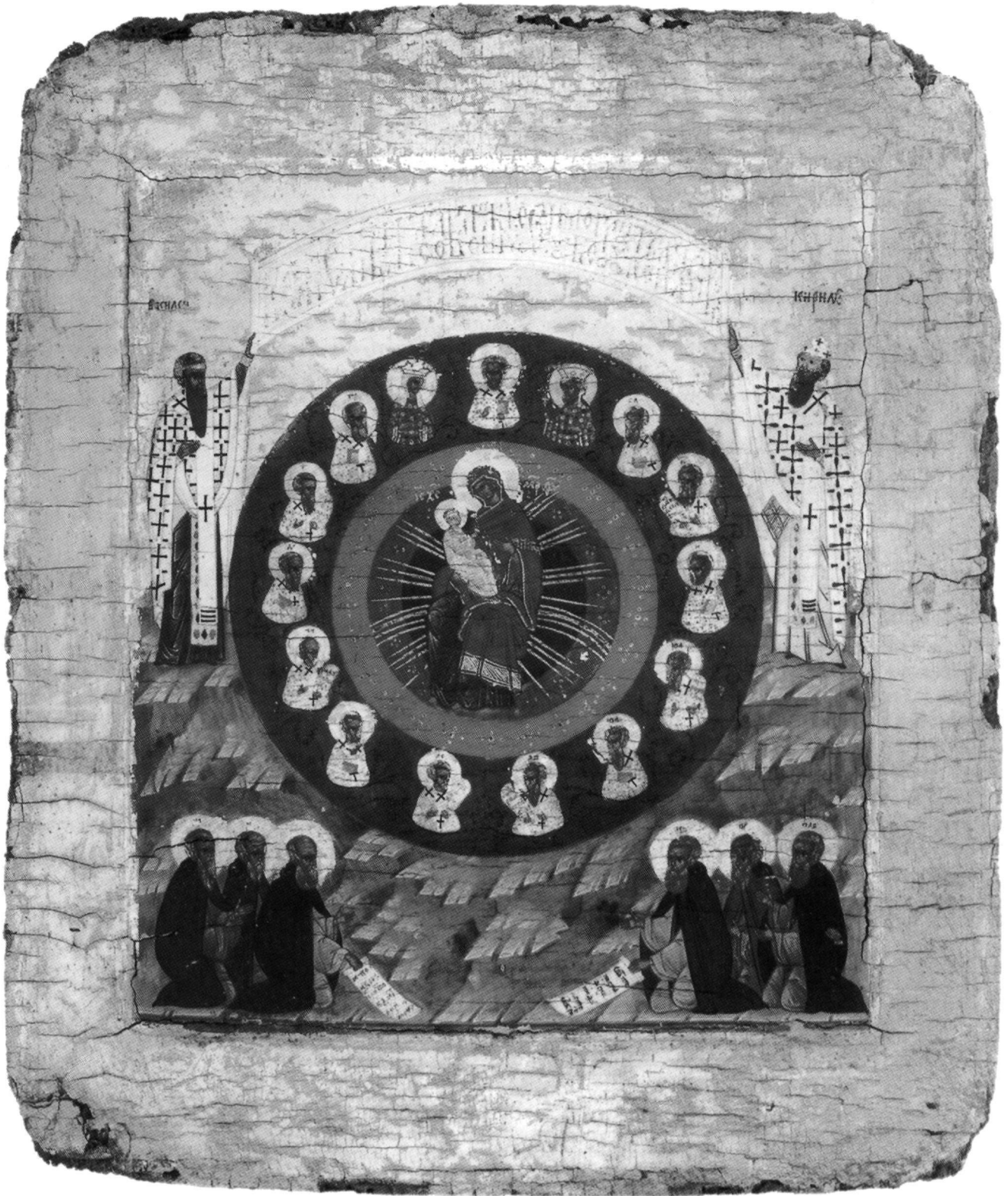
Fig. 1. «Τὴν ἀδιαφθόρως Θεὸν Λόγον τεκοῦσαν...». Composition from the series on the theme "Axion Estin". Russian icon of the late 15th-early 16th century. Xenophontos Monastery, Mt. Athos.