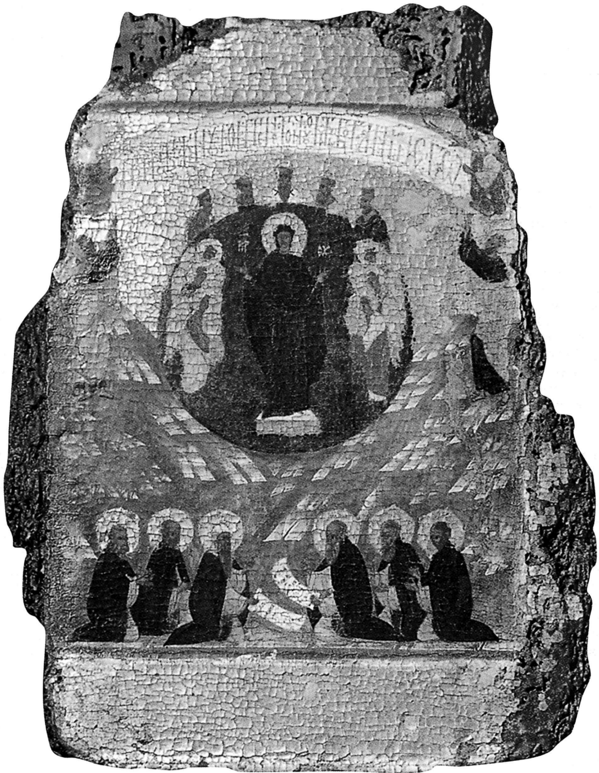
Fig. 2. «Τὴν ἀεμακάριστον καὶ παναμώμιτον...». Composition from the series on the theme "Axion Estin". Russian icon of the late 15th-early 16th century. St. Petersburg, Russian Museum.