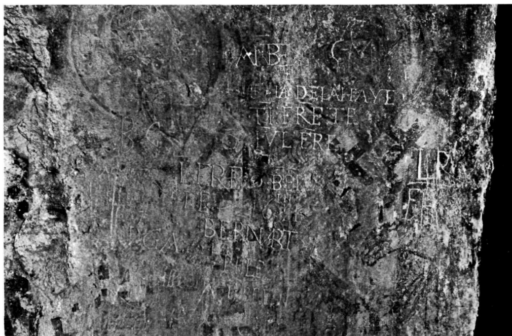
b. XVIIth cent. graffiti. Church of St. Solomoni, Paphos, Cyprus.