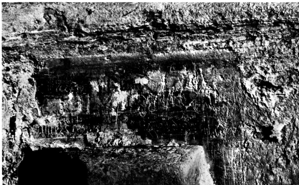
a. XIVth - XVth cent. graffiti. Church of St. Solomoni, Paphos, Cyprus.