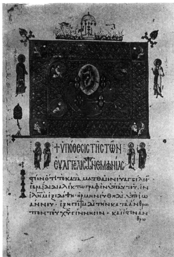
a. Detail of Pl. 11a. b. «Liturgical Theophany», cod. Parma, Pal. 5, fol. 5r.