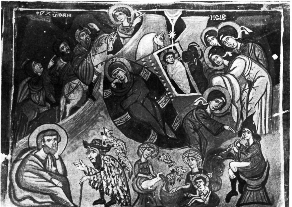
The chapel of the Archangel Michael, Vizakia Cyprus. a. South-east view. b. The Birth of Christ.