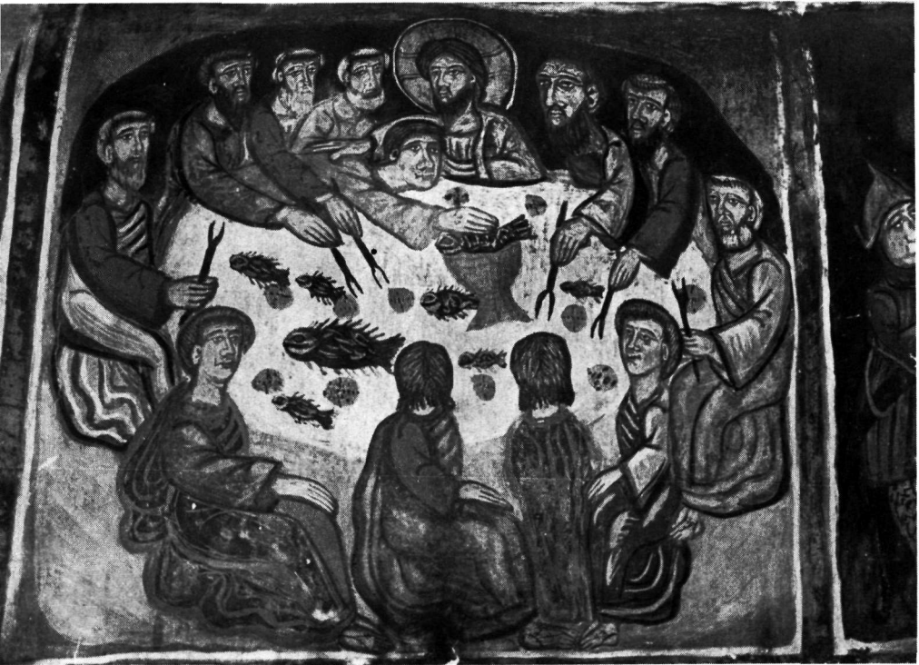
The chapel of the Archangel Michael, Vizakia, Cyprus. a. The Washing of the feet. b. The Last Supper.