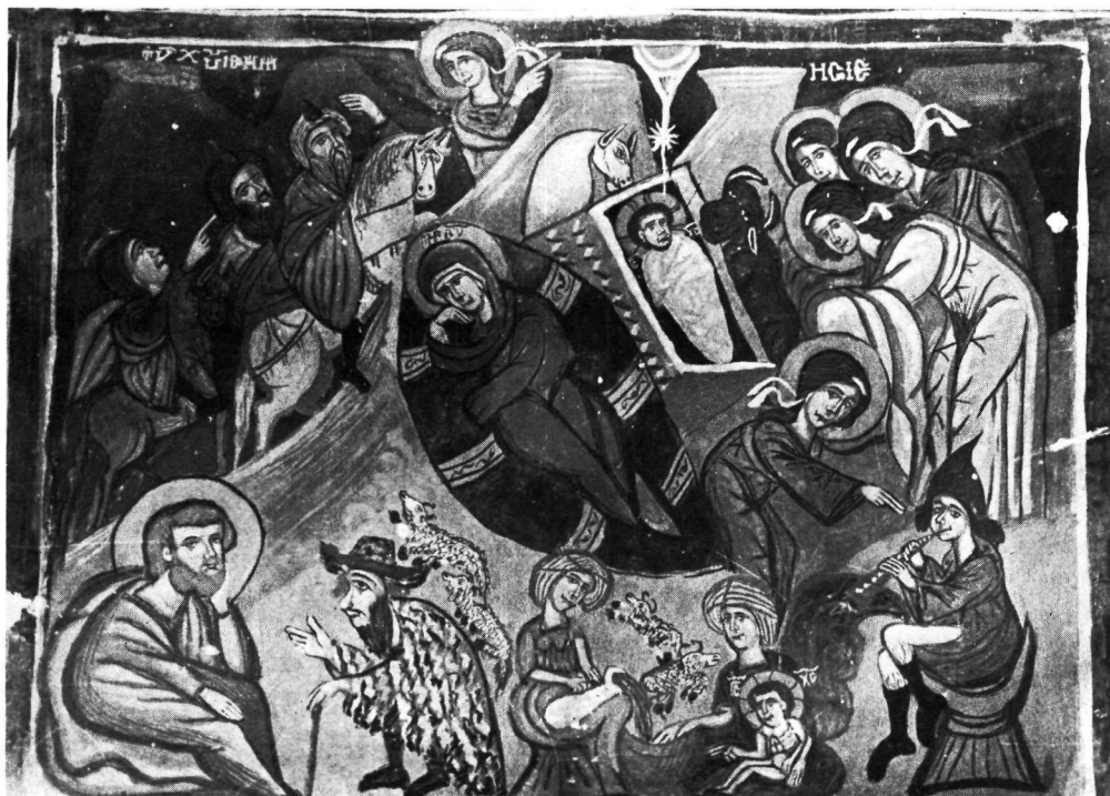
The chapel of the Archangel Michael, Vizakia Cyprus. a. South-east view. b. The Birth of Christ.