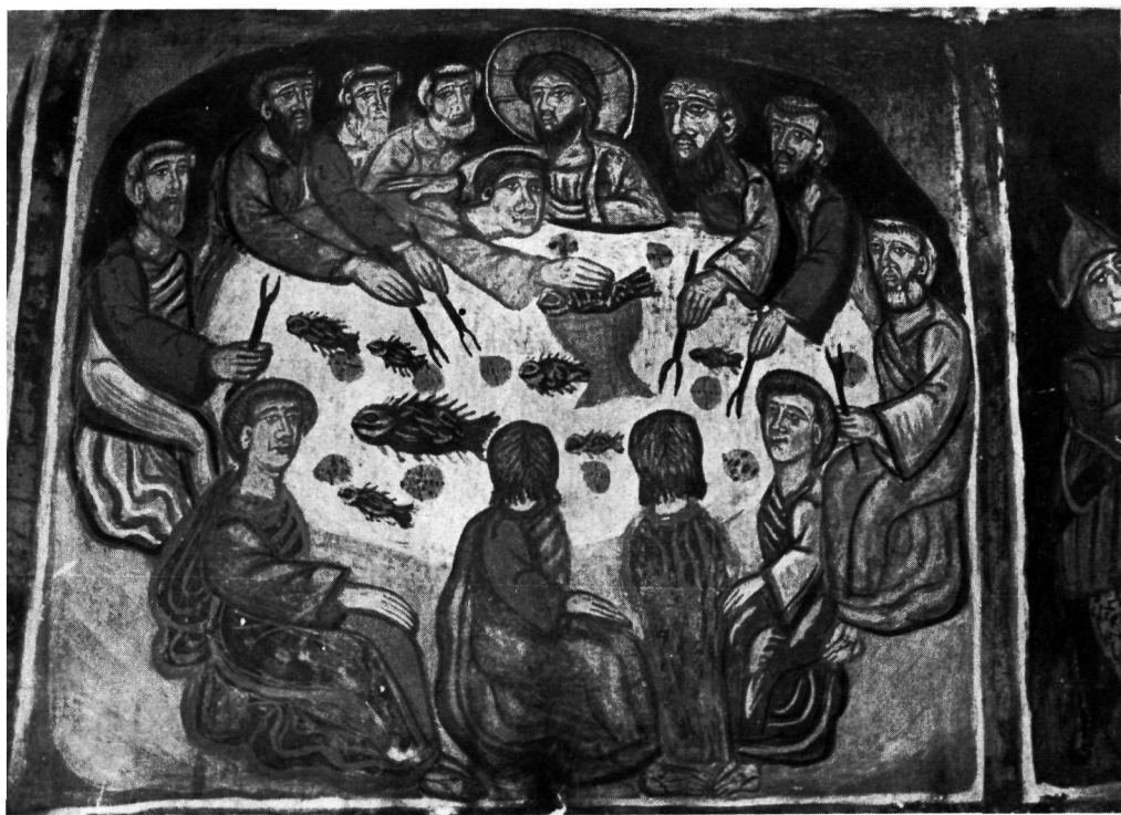
The chapel of the Archangel Michael, Vizakia, Cyprus. a. The Washing of the feet. b. The Last Supper.