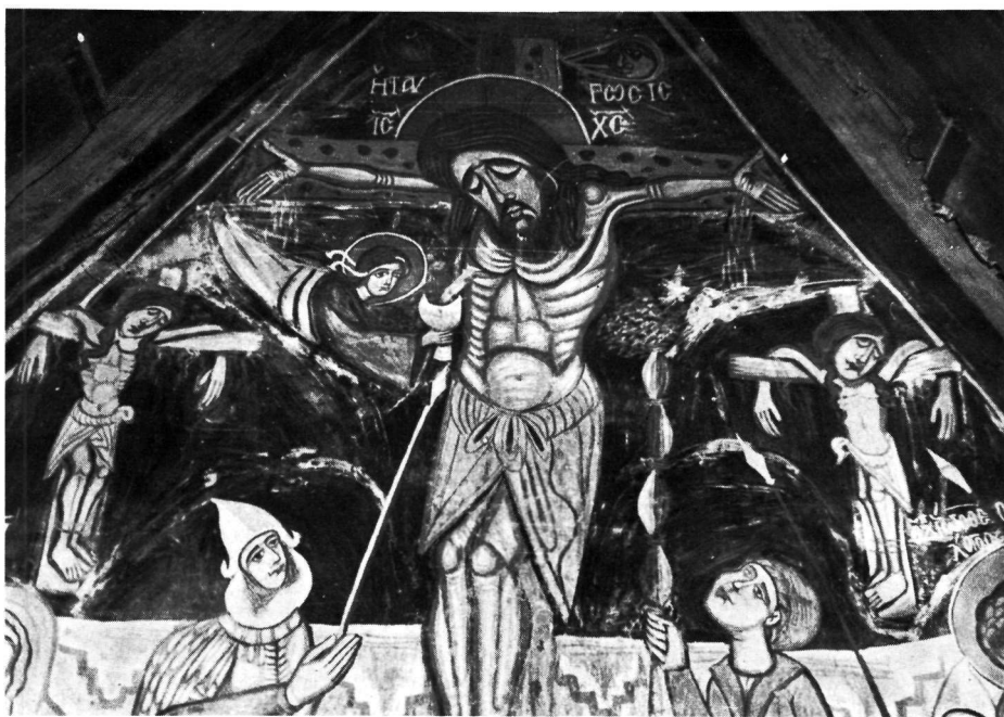
The chapel of the Archangel Michael, Vizakia, Cyprus. a. The Betrayal. b. The Crucifixion, detail.