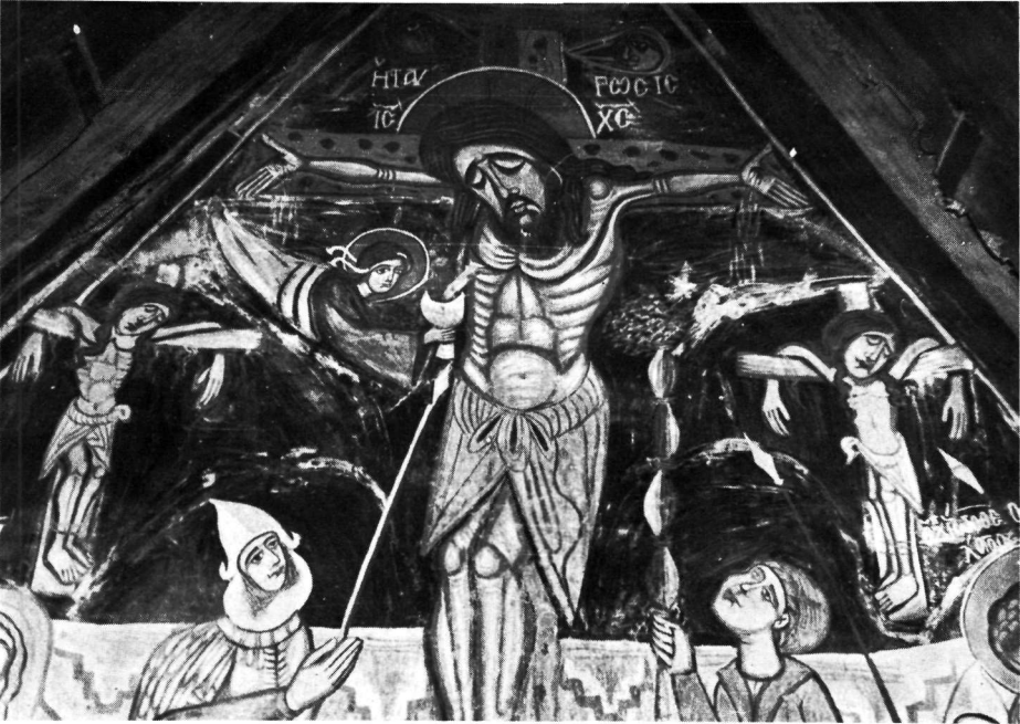
The chapel of the Archangel Michael, Vizakia, Cyprus. a. The Betrayal. b. The Crucifixion, detail.