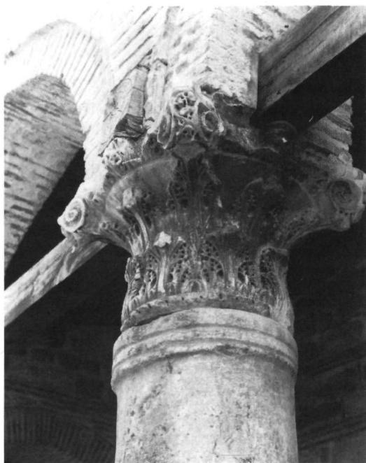
Fig. 5. Seyitgazi, courtyard of tekke .