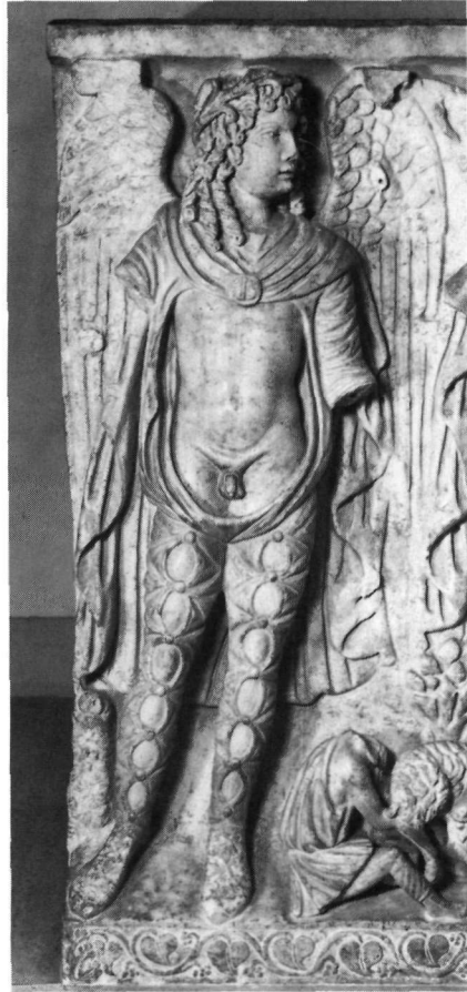
Fig. 10. Dumbarton Oaks, Season sarcophagus. Attis as Winter.