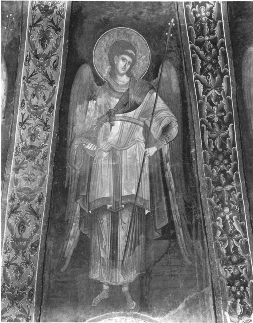
Fig. 2. Kariye Camii, parekklesion. Angel in the dome.

appropriate to angels 4 . We are fortunate in possessing his actual text, in which he says: "The insolent hand of painters, favouring as it does the inventions of