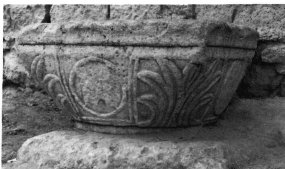
Fig. 9. Yürme, Justinianic capital in front of village mosque.

lous cures through the agency of a fishpool; for although, as we shall see, the Archangel had certain associations with water, he has never, to my knowledge, been linked with fish. The suspicion comes naturally to mind that he may have inherited an earlier, pagan cult. But whose? If we are to suggest any answers, we shall have to cast our net wider.