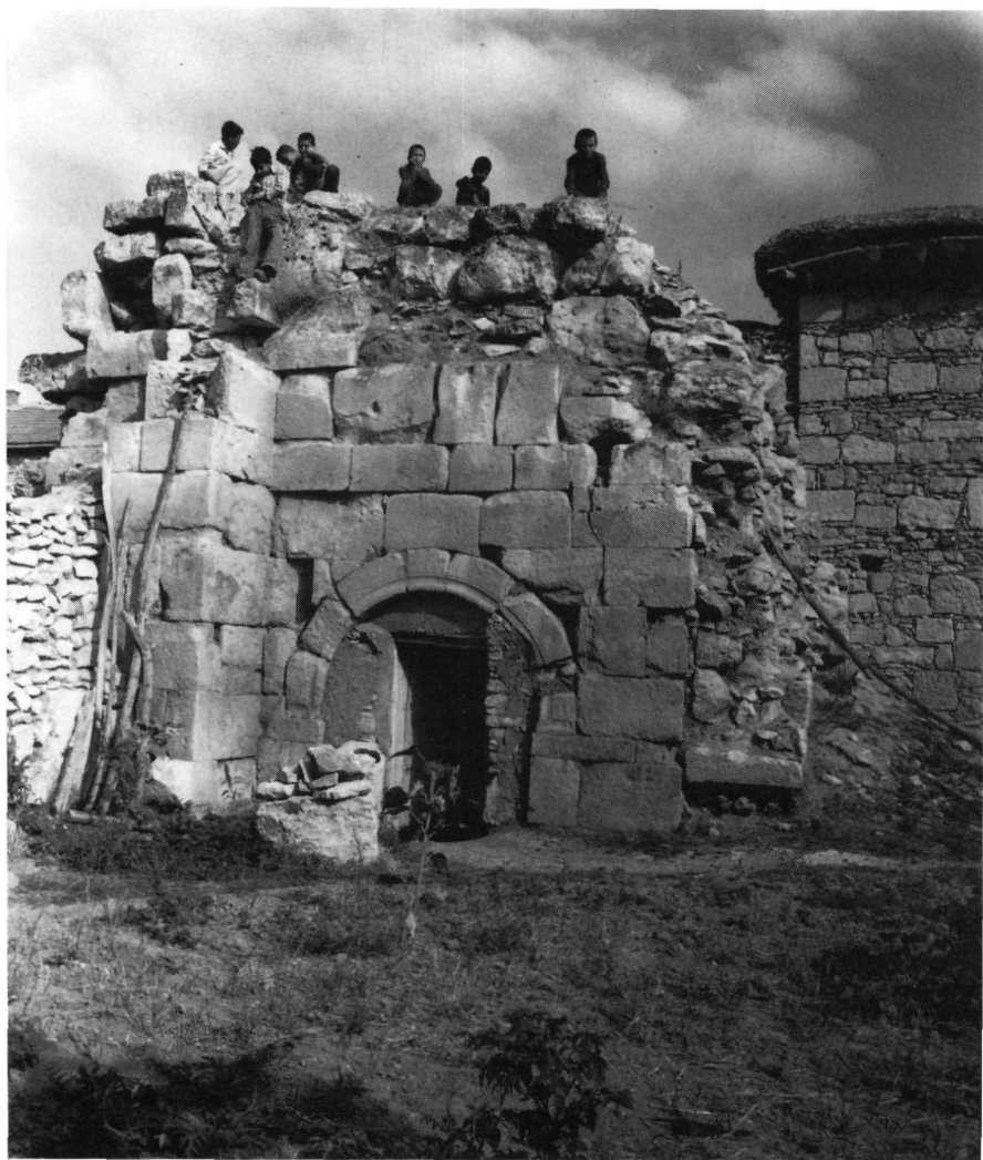
Fig. 7. Yürme, church of St. Michael. Detail of west façade.

(Fig. 8), of which the earlier one, in alternating bands of brick and stone, is probably of the 5th century, hence of the time of Studius, irrespective of the fact whether he was or was not its builder. It is also situated next to a ravine in which water once flowed, although it has now been diverted elsewhere. The village is still strewn with Byzantine carved elements and inscriptions, all of the 5th and 6th centuries, among them a capital bearing the monograms of