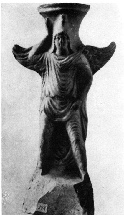
Fig. 11. Louvre, statuette of Attis.

doorstep of the capital, its foundation was ascribed to imperial initiative and it drew its clientèle among distinguished lawyers and physicians. How is it then that the Michaelion, with its supernatural manifestations and cures by incubation, was tolerated at the very time when the Church laid stress on condemning the worship of angels and the dedication of churches to them? Can it be true, after all, that the Michaelion had been founded by Constantine? A precise occasion comes naturally to mind: in September 324 Constantine, at the head of his troops, crossed the Bosphorus before defeating his rival Licinius at Chrysopolis 63 . In the course of this war he is said to have had several visions announcing his victory 64 . Or did he take to his credit the vision of an angel which Licinius had had a few years previously (313), prior to his victory over Maximinus Daia at Campus Ergenus, not far from Byzantium 65 ?