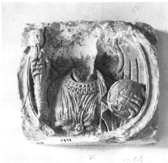
Fig. 4. Cairo, Coptic Museum. Relief of archangel.

pagans, decks out Michael and Gabriel, like princes and kings, in a robe of royal purple, adorns them with a crown and places in their right hand the token of universal authority” 5 .