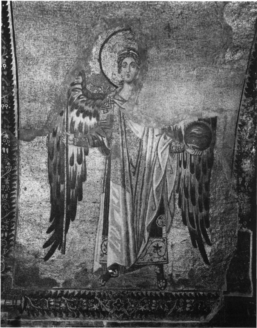
Fig. 1. St. Sophia, Constantinople. Archangel Gabriel in the bema.

2. The imperial iconography of archangels is traceable to the pre-Iconoclastic period and was already established by about the year 500. Indeed, Severus, patriarch of Antioch from 512 to 518, was accused by his opponents of arguing in the very church of St. Michael that white vestments, not purple ones, were