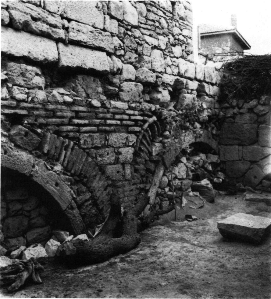
Fig. 8. Yürme, church of St. Michael. North crossing, showing two structural phases.

Justinian and Theodora (Fig. 9) 31 and the fragments of an edict.