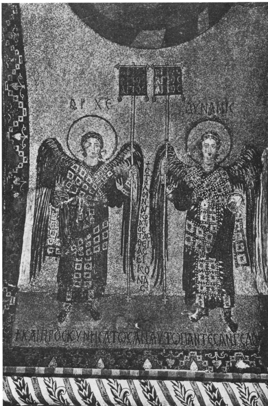
Fig. 3. Nicaea, Koimesis church. Angelic powers in the bema.