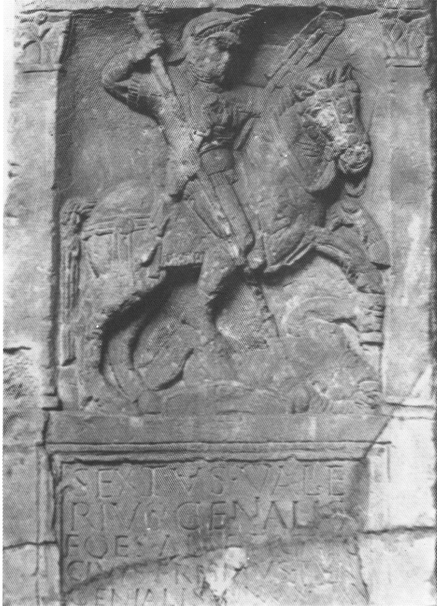
Fig. 9. Funerary stele in Cirencester. Sextus Valerius Genalis.

known on Greek amulets. It can therefore only be proposed as a hypothesis that the lion who is represented fairly frequently attacking the prostrate woman, so doubling Solomon's action, is intended to be a symbol of Christ.