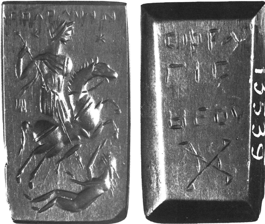
Fig. 1. Intaglio in the Benaki Museum.

tion, although, no doubt, correct, does not enlarge on the mechanics of amulets: how they exerted power for good and preserved the wearer from evil. It will be argued in this article that the introduction of the figure of Solomon spearing the prostrate woman corresponded to a radical change in the theory of their mechanics.