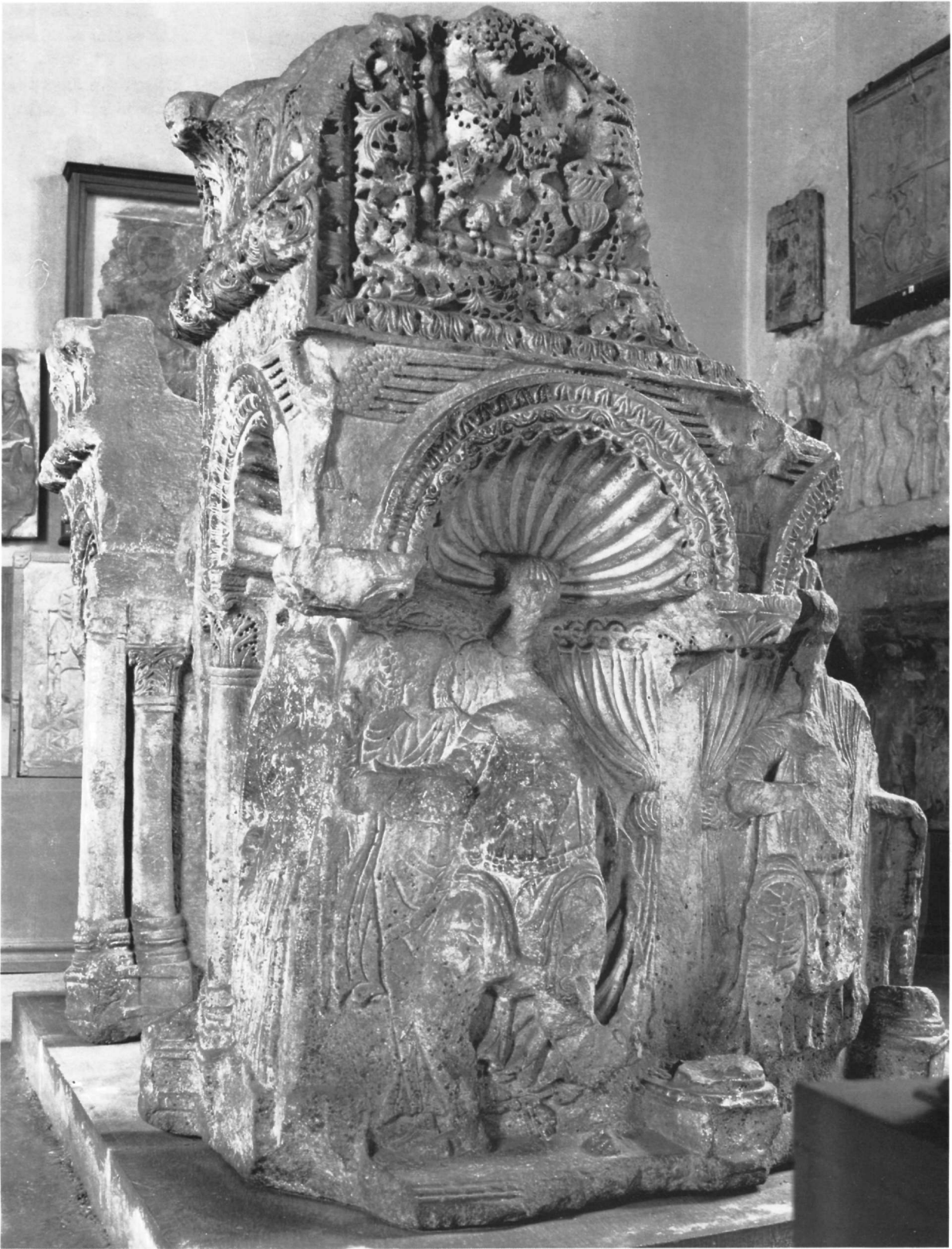
Fig. 8. Istanbul, Archaeological Museum. Ambo from the church of St. George, Thessaloniki. (Photo: Hirmer).