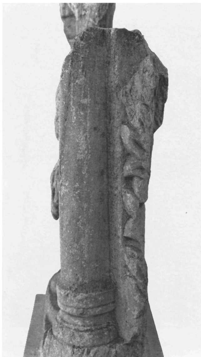
Fig. 5. Kavala, Archaeological Museum. Fragment from an ambo, detail on right-hand facet. Acanthus leaves. (Photo: author).