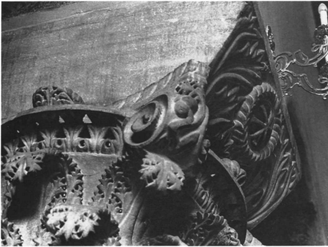
Fig. 11. Thessaloniki, Basilica of the Acheiropoietos, nave. Capital and impost.