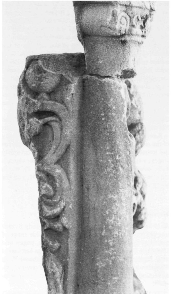
Fig. 7. Kavala, Archaeological Museum. Fragment from an ambo, detail. Plant-stem and pomegranate on left-hand facet.