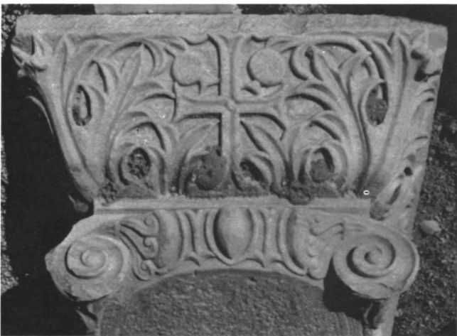
Fig. 10. Basilica of Lechaion (Corinth). Capital. (Photo: author).

commentary on the Hexaemeron attributed to Anastasius Sinaites identifies the eagles as the just who congregate at the body of the Good Thief, namely in Paradise 49 .