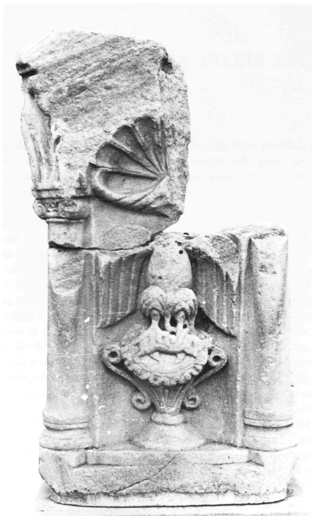
Fig. 1. Kavala, Archaeological Museum. Fragment from an ambo.

Enough survives to show that on this facet the floor of the niche was at a higher level than of the central niche. Whereas the floor of the central niche is at the same level as the bases of the columns (9.5 cm above the bottom of the block), on the right-hand facet the floor of the niche was higher than the tops of the column bases, about 20 cm above the bottom of the block. This indicates that the niche in the right-hand facet was smaller than the central one, and less important in the overall composition to which our block belonged. Like the left-hand niche, the niche on the right side preserves foliage at its left-hand edge. In this case the character of the plant is different, for instead of a twisting stem, we find the fleshy tips of acanthus leaves set against the curving wall of the niche.