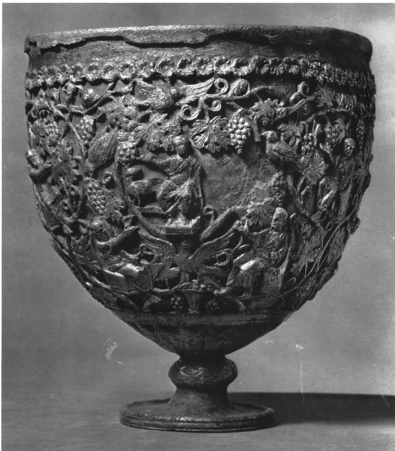
Fig. 14. The Metropolitan Museum of Art, New York. Silver bowl ("Chalice of Antioch"). Christ, eagle, and eucharistic emblems. (Photo: The Metropolitan Museum of Art).