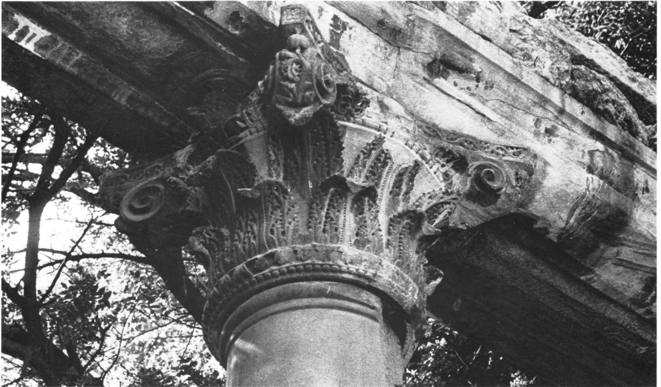
Fig. 13. Basilica of St. John Studios. Constantinople. Capital in the narthex.

to congregate at food of this kind. If, therefore, irrational birds can sense where a small carcass lies by means of their natural senses when they are separated by such wide spaces of land and of sea, how much more should we and all the multitude of believers hurry to him whose radiance goes forth from the East and reaches to the West... We can understand [the word] corpus ... as the Passion of Christ to which we are summoned to congregate wherever it is read in the scripture and through it we can come to the word of God..." 64 .