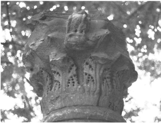
Fig. 9. Istanbul, Archaeological Museum. Capital. (Photo: author).