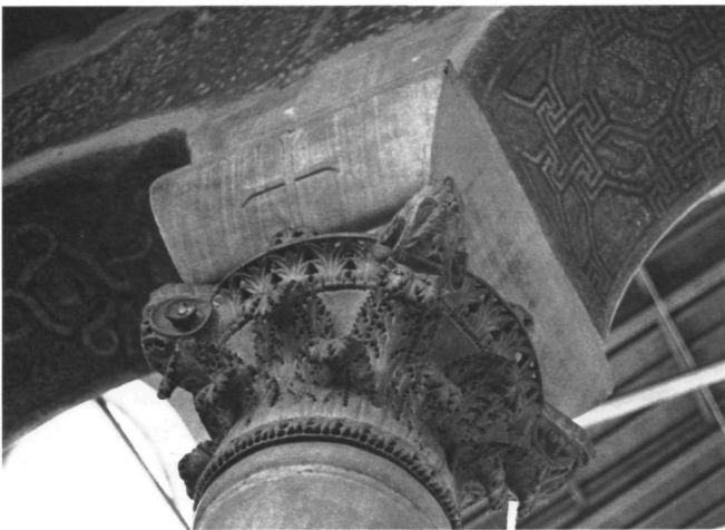
Fig. 12. Thessaloniki, Basilica of the Acheiropoietos, nave. Capital and impost. (Photo: author).

lection of the Metropolitan Museum of Art in New York 59 . This object, which was probably made in the mid-sixth century, consists of a double silver bowl with an added foot 60 . The outer bowl has a dense design of an inhabited vine executed in openwork. The images within the vine are arranged around two representations of the seated Christ. Beneath one of the figures of Christ is an eagle with outspread wings standing on a basket containing either grapes or bread (Fig. 14). The basket itself is flanked by two bunches of grapes, while another basket, perhaps containing bread, appears to the right. Like the sculpture of our relief, therefore, the images on the “chalice of Antioch” appear to associate the eagle with eucharistic imagery, that is, with the baskets and the vines 61 . Eagles are also found in association with vines on the famous ambo from the church of St.