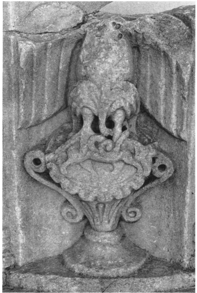
Fig. 3. Kavala, Archaeological Museum. Fragment from an ambo, detail. Eagle and vase.

While the combined motif, of the eagle both attacking a serpent and grasping another animal, is comparatively rare, it is not unusual to find the eagle in association with just one other creature. The image of the eagle with