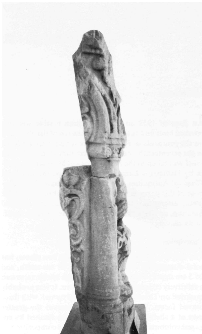
Fig. 2. Kavala, Archaeological Museum. Fragment from an ambo, left-hand facet.

Enough survives to show that on this facet the floor of the niche was at a higher level than of the central niche. Whereas the floor of the central niche is at the same level as the bases of the columns (9.5 cm above the bottom of the block), on the right-hand facet the floor of the niche was higher than the tops of the column bases, about 20 cm above the bottom of the block. This indicates that the niche in the right-hand facet was smaller than the central one, and less important in the overall composition to which our block belonged. Like the left-hand niche, the niche on the right side preserves foliage at its left-hand edge. In this case the character of the plant is different, for instead of a twisting stem, we find the fleshy tips of acanthus leaves set against the curving wall of the niche.