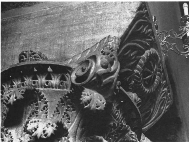
Fig. 11. Thessaloniki, Basilica of the Acheiropoietos, nave. Capital and impost.