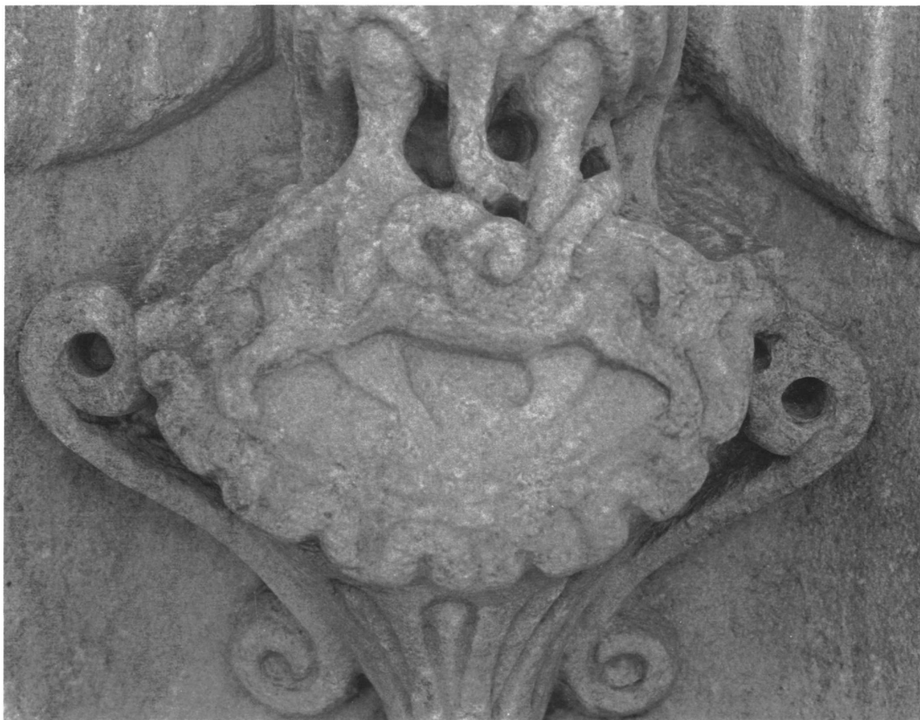
Fig. 4. Kavala, Archaeological Museum. Fragment from an ambo, detail. Eagle's prey. (Photo: author).

Musée à Philippos, Ἀφιέρωμα στὴ μνήμη Στυλιανοῦ Πελεκανίδη, Thessaloniki 1983, pp. 197-212, esp. p. 210, figs. 9-11; Kourkoutidou-Nikolaïdou, op.cit. (as in note 11), p. 267, figs. 19-20.