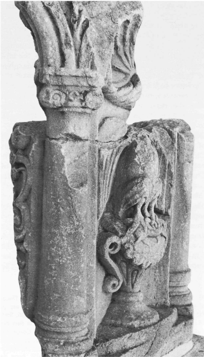
Fig. 6. Kavala, Archaeological Museum. Fragment from an ambo, detail. Column and capital on left side. (Photo: author).