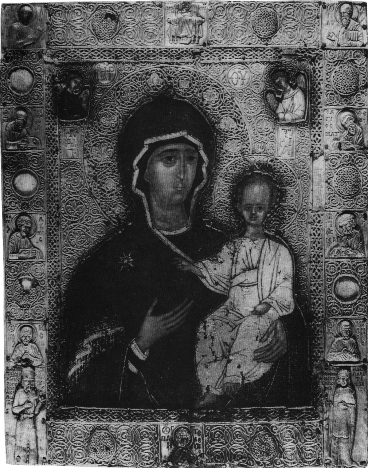
Fig. 3. Icon of the Virgin Hodegetria with the donors Constantine and Maria Akropolites on its metal frame. Moscow, Tretjakov Gallery.