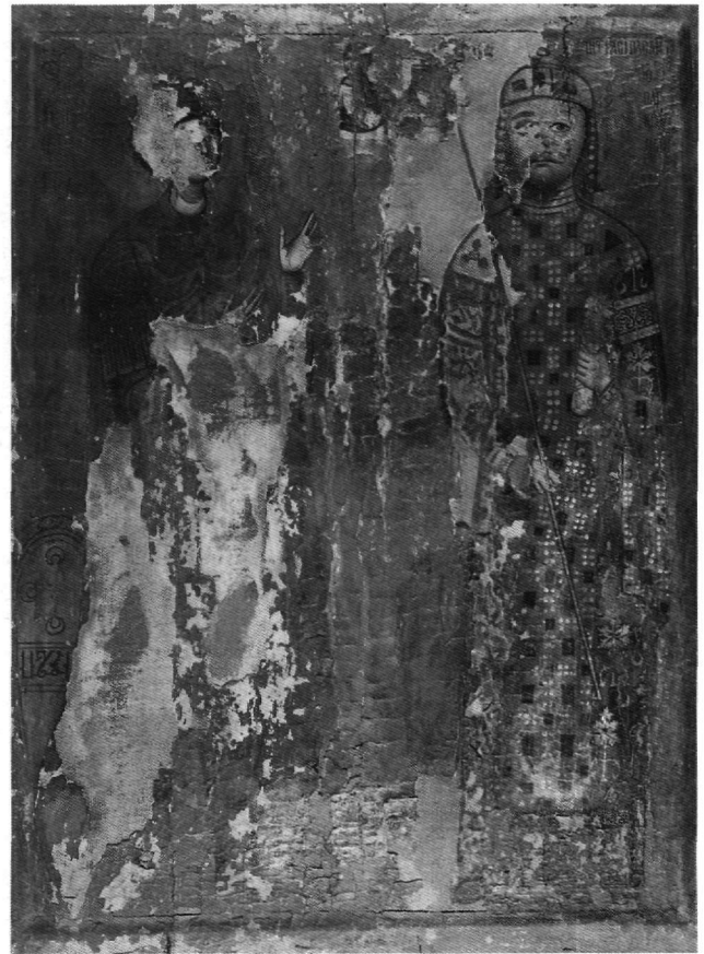
Fig. 5. Icon of Saint George and a Bagratid king. Sinai, Monastery of Saint Catherine.

in a sort of modified Deesis, and they also point down, both of them, toward the donor. The core of the composition, the figure of the Virgin with child acknowledging a donor at her feet, is found in frescoes and manuscripts from 11th century on, but is to my knowledge unique on Byzantine icons 18 . The donor has in this case actually altered the nature of the whole image, by demanding a visual response from the very holy figures he has commissioned.