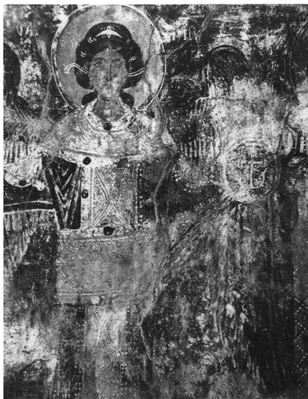
Fig. 24. Sanctuary. Barrel vault. South half. The archangel Michael.

First, is there a common denominator by the eleventh century which embodies the various stylistic currents of provincial painting?