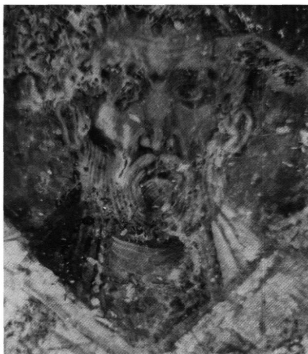
Fig. 23. Mani, Kounos. Church of Saint Paraskevi. Unidentified bishop.