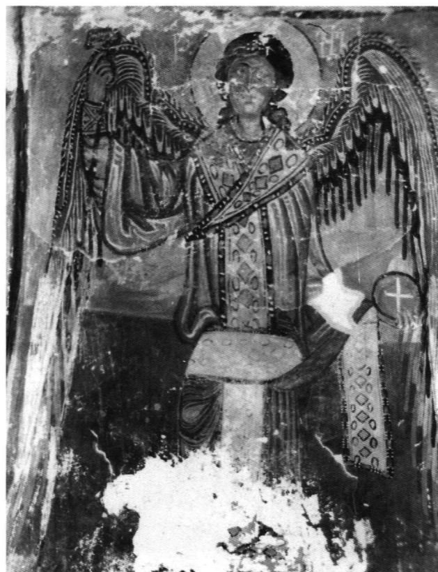
Fig. 25. Mani, Gardenitsa. Church of Saint Peter. North wall. The archangel Michael.

The handling of the human figure does not follow classical norms. Figures are either overly tall with large hands and feet as at Zemo-Krichi and Boularii (Figs 5, 7, and 20) or small and crowded together as in the Mani churches of Kounos and Gardenitsa (Fig. 12). Moreover, the figures are stiff and their movements angular