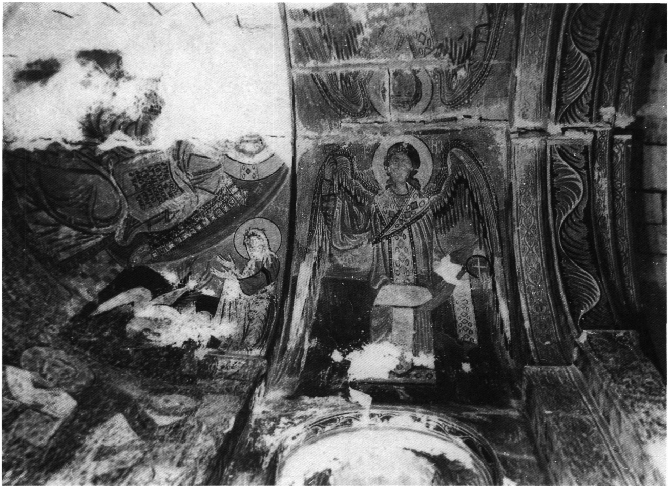
Fig. 3. The sanctuary. Barrel vault, the archangels Michael and Gabriel. Conch of the apse, the Deesis, detail: the enthroned Christ, St. John the Baptist, a Cherubim. Bottom register. The bishops, detail.

rank and probably of the same family. The Donor heading the group appears older and more richly attired than the other three. The inscriptions of their names written in magiscule letters were visible but not well enough preserved for identification.