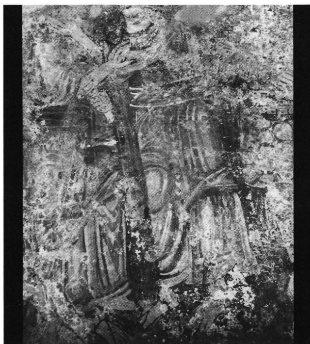
Fig. 8. Mani, Kounos. Church of Saint Paraskevi. South wall. The Betrayal of Christ , detail.

ed church in the Mani which preserves its inscription. It is a small single nave barrel-vaulted edifice, at present half demolished. The eastern section retains its two apses with a three-register fresco decoration and a painted inscription dating the monument and the frescoes to 991 AD. The figures are characterized by large heads and strongly accentuated features. The eyes are particularly emphasized and the faces stark (Fig. 20). Although the paintings are naive in character and execution, they possess expressive qualities enhanced by the ornamental use of colour. These paintings serve to define the dating of the frescoes of Saint Paraskevi near