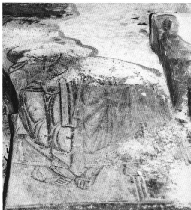
Fig. 7. East wall. Middle register. The Raising of Lazarus , detail. Christ and an apostle.

Numerous small churches were constructed along the western slopes of the mountain range which extends down the center of the Mani peninsula separating west Mani from its eastern side. Many of the monuments were built at a considerable walking distance from their respective communities. It may be presumed that most of these churches were privately built on land owned by those who financed the construction. There are however no identifiable donor portraits in these early churches. The fact that monastic churches are relatively rare strengthens the theory of private and communal ownership 8 .