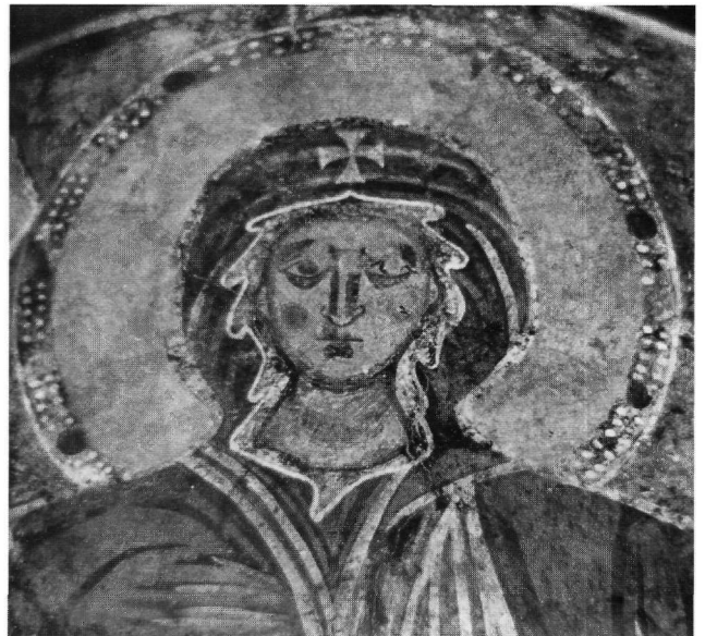
Fig. 17. Mani, Gardenitsa. Church of Saint Peter. North wall. St. Helen and St. Constantine.