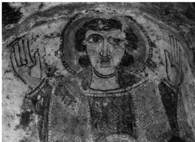
Fig. 20. Mani, Boularii. Church of Saint Panteleimon. Conch of east apse to the south. Unidentified saint.

Before concluding, two questions may be raised: