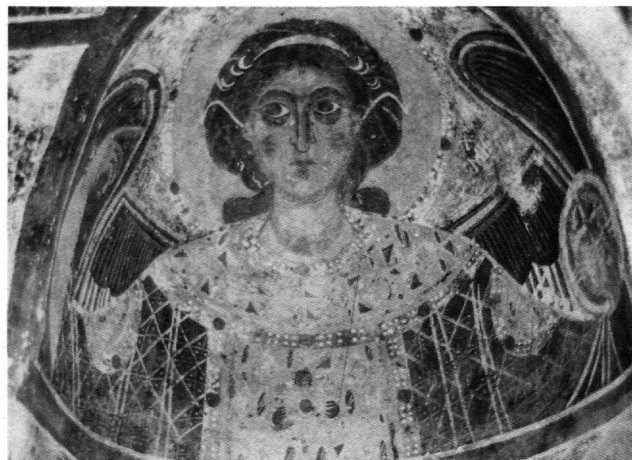
Fig. 21. Mani, Gardenitsa. Church of Saint Peter. Conch of east apse to the south. The archangel Michael.