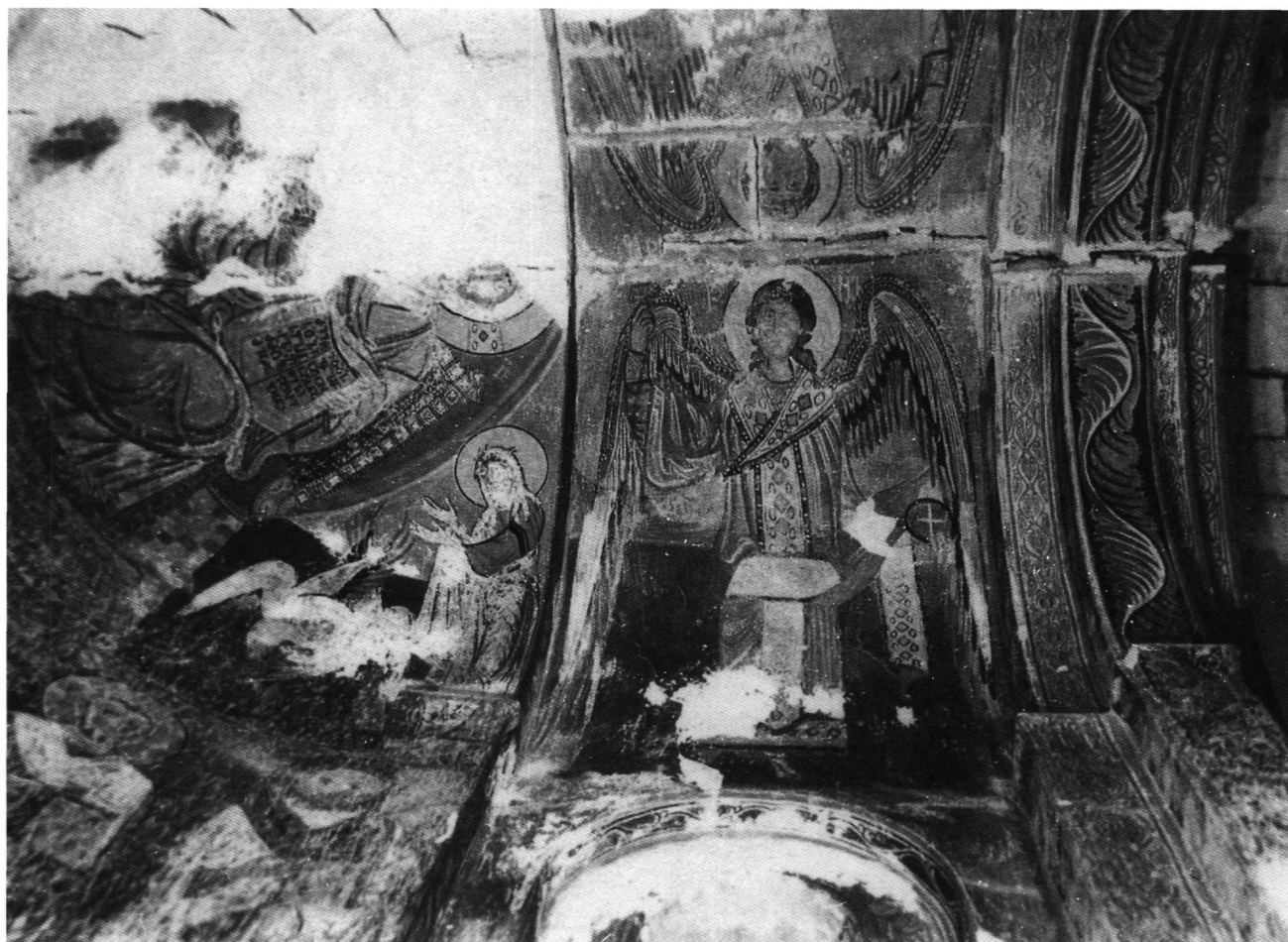
Fig. 3. The sanctuary. Barrel vault, the archangels Michael and Gabriel. Conch of the apse, the Deesis, detail: the enthroned Christ, St. John the Baptist, a Cherubim. Bottom register. The bishops, detail.

rank and probably of the same family. The Donor heading the group appears older and more richly attired than the other three. The inscriptions of their names written in magiscule letters were visible but not well enough preserved for identification.