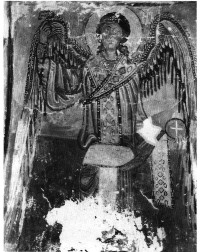
Fig. 25. Mani, Gardenitsa. Church of Saint Peter. North wall. The archangel Michael.

First, is there a common denominator by the eleventh century which embodies the various stylistic currents of provincial painting?