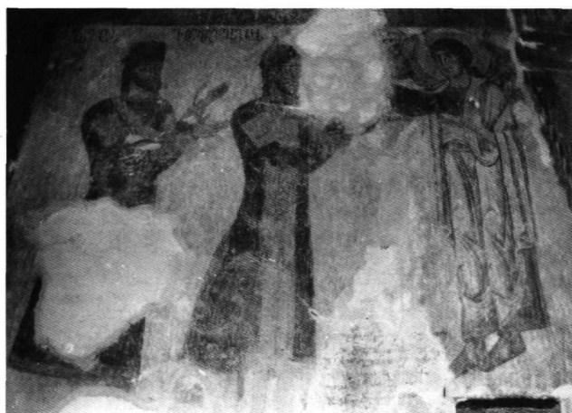
Fig. 4. North wall to the east. Bottom register. Unidentified Angel and Donors, detail.

The frescoes of Zemo-Krichi have been compared by Mrs. Virsaládze with the mural painting in the neighbouring province of Svaneti, and in particular with the frescoes of the church at Iprari, painted in 1096 by the artist Tévdoré. Although a more elaborate modelling of the figures was apparent, the expressive style of Zemo-Krichi is considered to have influenced the local school of painting of Svaneti up to the mid-twelfth century. The decoration in churches such as Nakipari ca 1130, Saint Cyricus and Julitte ca 1112, Cvirmi, and Maxvarisi ca 1140, have been cited as examples of an archaising style 5 .