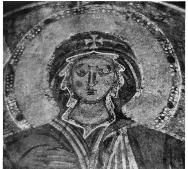
Fig. 17. Mani, Gardenitsa. Church of Saint Peter. North wall. St. Helen and St. Constantine.