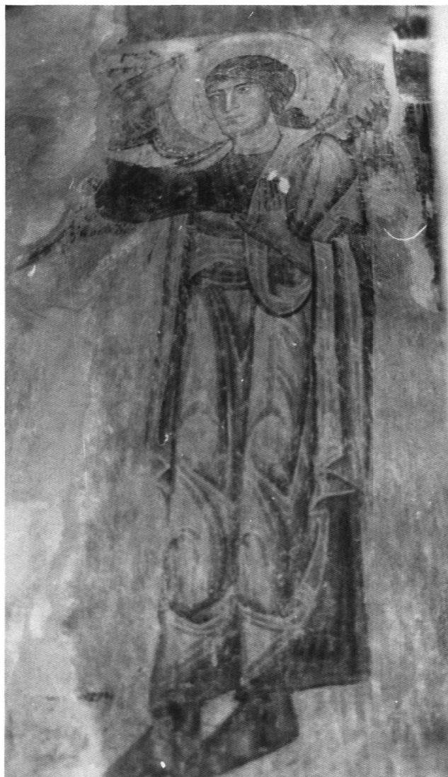
Fig. 6. North wall to the east. Bottom register. Unidentified Angel facing the Donors.

decorated in 1080. The more sophisticated figures with a more developed awareness nevertheless still contain elements related to the earlier linear and forceful style observed in the church of the Holy Archangels. It may be noted that no regions outside Georgia have been examined in relation to the mural decorations of the eleventh and early twelfth century churches of Rača and Svaneti. The intent at present is to examine an area in southern Greece, the Mani in the province of Lakonia, whose secular medieval architecture resemble remarkably to that of the mountain villages of Svaneti and whose numerous Byzantine churches retain invaluable examples of provincial painting 6 . It may moreover be observed that Constantinople, as an artistic epicenter of