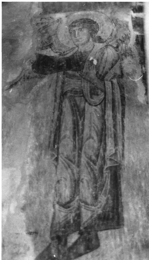
Fig. 6. North wall to the east. Bottom register. Unidentified Angel facing the Donors.

decorated in 1080. The more sophisticated figures with a more developed awareness nevertheless still contain elements related to the earlier linear and forceful style observed in the church of the Holy Archangels. It may be noted that no regions outside Georgia have been examined in relation to the mural decorations of the eleventh and early twelfth century churches of Rača and Svaneti. The intent at present is to examine an area in southern Greece, the Mani in the province of Lakonia, whose secular medieval architecture resemble remarkably to that of the mountain villages of Svaneti and whose numerous Byzantine churches retain invaluable examples of provincial painting 6 . It may moreover be observed that Constantinople, as an artistic epicenter of