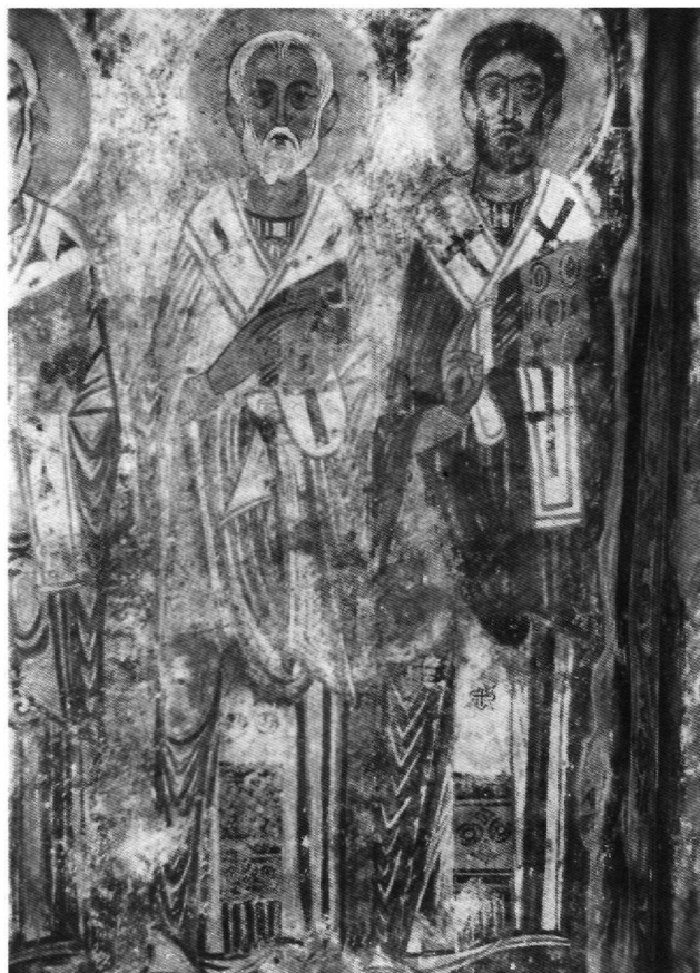
Fig. 12. Mani, Gardenitsa. Church of Saint Peter. North wall. Bishops.

churches of Rača and Mani respectively (Figs 22 and 23). Not far from the church of Saint Paraskevi at Kounos, outside the village of Gardenitsa, is the church of Saint Peter, a single-nave, barrel-vaulted monument possessing a double eastern apse.