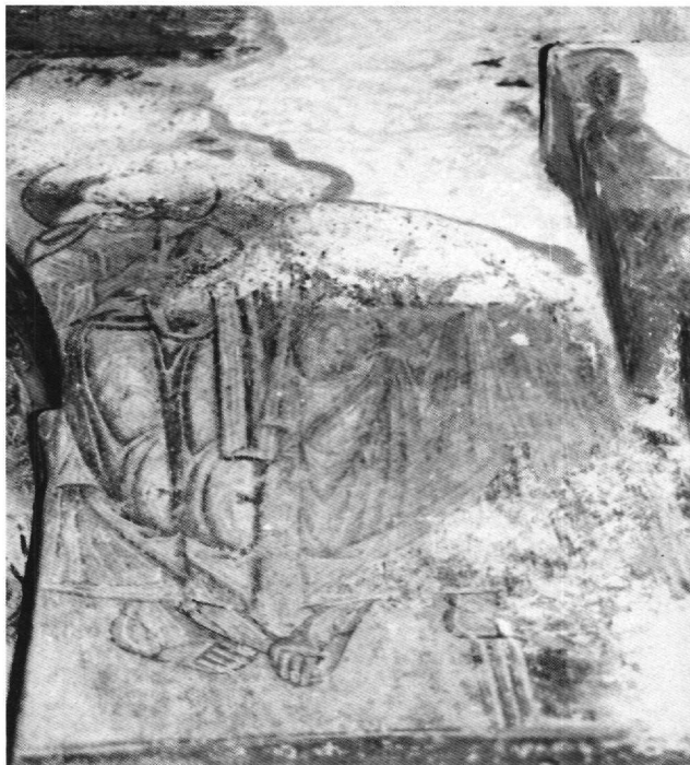
Fig. 7. East wall. Middle register. The Raising of Lazarus , detail. Christ and an apostle.

Numerous small churches were constructed along the western slopes of the mountain range which extends down the center of the Mani peninsula separating west Mani from its eastern side. Many of the monuments were built at a considerable walking distance from their respective communities. It may be presumed that most of these churches were privately built on land owned by those who financed the construction. There are however no identifiable donor portraits in these early churches. The fact that monastic churches are relatively rare strengthens the theory of private and communal ownership 8 .