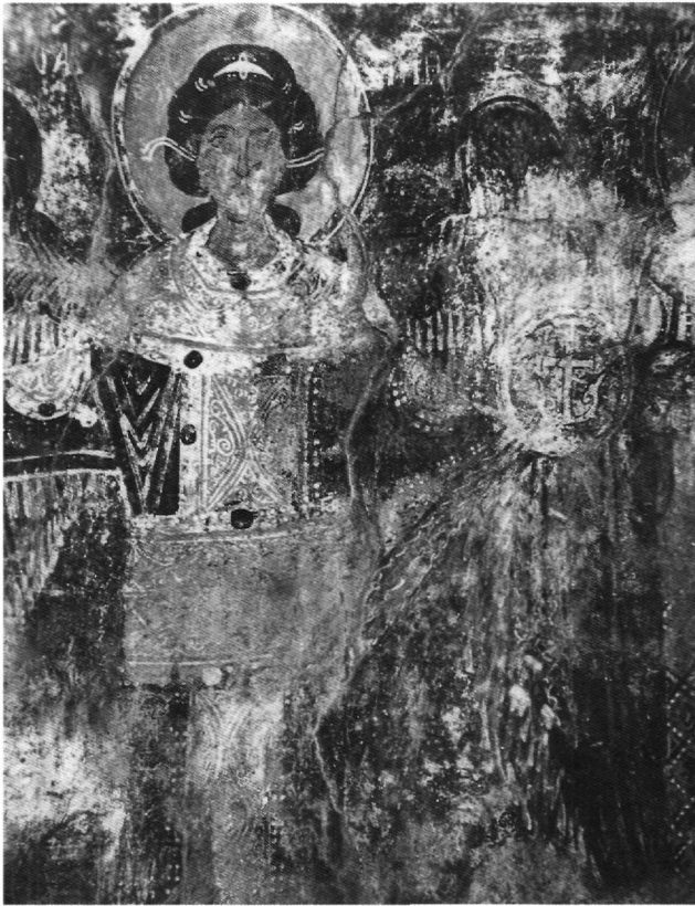
Fig. 24. Sanctuary. Barrel vault. South half. The archangel Michael.