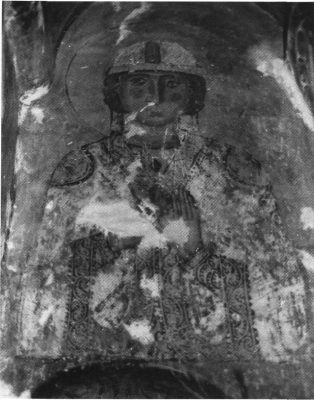
Fig. 13. East wall to the north. Bottom register. St. Barbara.