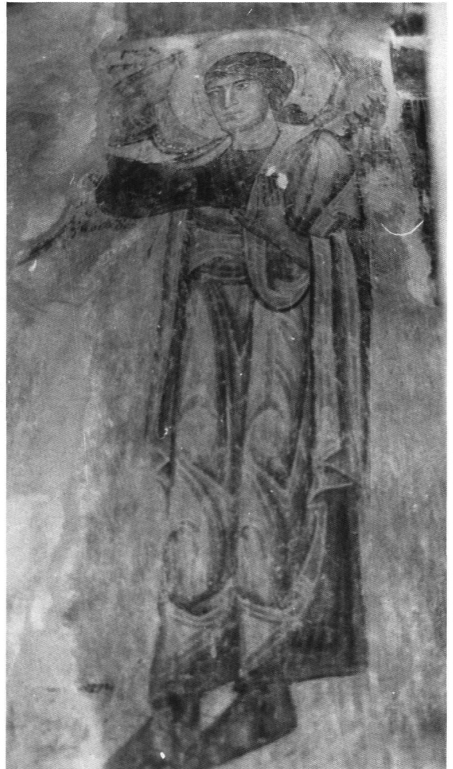
Fig. 6. North wall to the east. Bottom register. Unidentified Angel facing the Donors.

decorated in 1080. The more sophisticated figures with a more developed awareness nevertheless still contain elements related to the earlier linear and forceful style observed in the church of the Holy Archangels. It may be noted that no regions outside Georgia have been examined in relation to the mural decorations of the eleventh and early twelfth century churches of Rača and Svaneti. The intent at present is to examine an area in southern Greece, the Mani in the province of Lakonia, whose secular medieval architecture resemble remarkably to that of the mountain villages of Svaneti and whose numerous Byzantine churches retain invaluable examples of provincial painting 6 . It may moreover be observed that Constantinople, as an artistic epicenter of