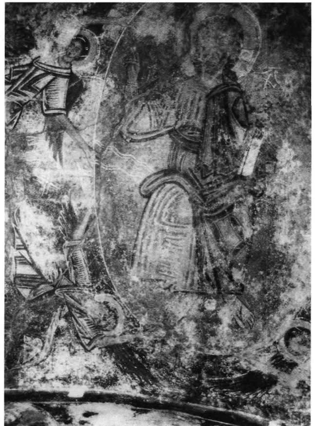
Fig. 10. Mani, Kounos. Church of Saint Paraskevi. Barrel vault of the sanctuary. The Ascension.

preserves much of its painted decoration on the north and south wall, while the paintings of the eastern apse and the west wall are greatly damaged. Nikon Metanuite, the tenth-century patron Saint of the province of Lakonia, is depicted on the north wall along with St. Kyriaki who has the days of the week painted on her gown, and St. Evlavia who is standing beside her. On the south wall, the scene of the Betrayal of Christ is partly preserved, depicting the stiff figure of Judas kissing Christ (Fig. 8). A close stylistic relationship with the fragment of the scene of the Raising of Lazarus at Zemo-Krichi (Fig. 7) is apparent. In both scenes the garments are treated in a similar manner. Dark vertical lines accentuate the legs, and decorative oval patterns outline the knees in an abstract unrealistic way, thus creating a rhythmic effect that energize the otherwise static figures. This stylistic approach is particularly emphasized by the wide inverted hems which dip abruptly from the thighs to the feet; a rendering which applies to most figures clad in antique garments at the Holy Archangels and at Saint Paraskevi near Kounos (Figs 5 and 8).