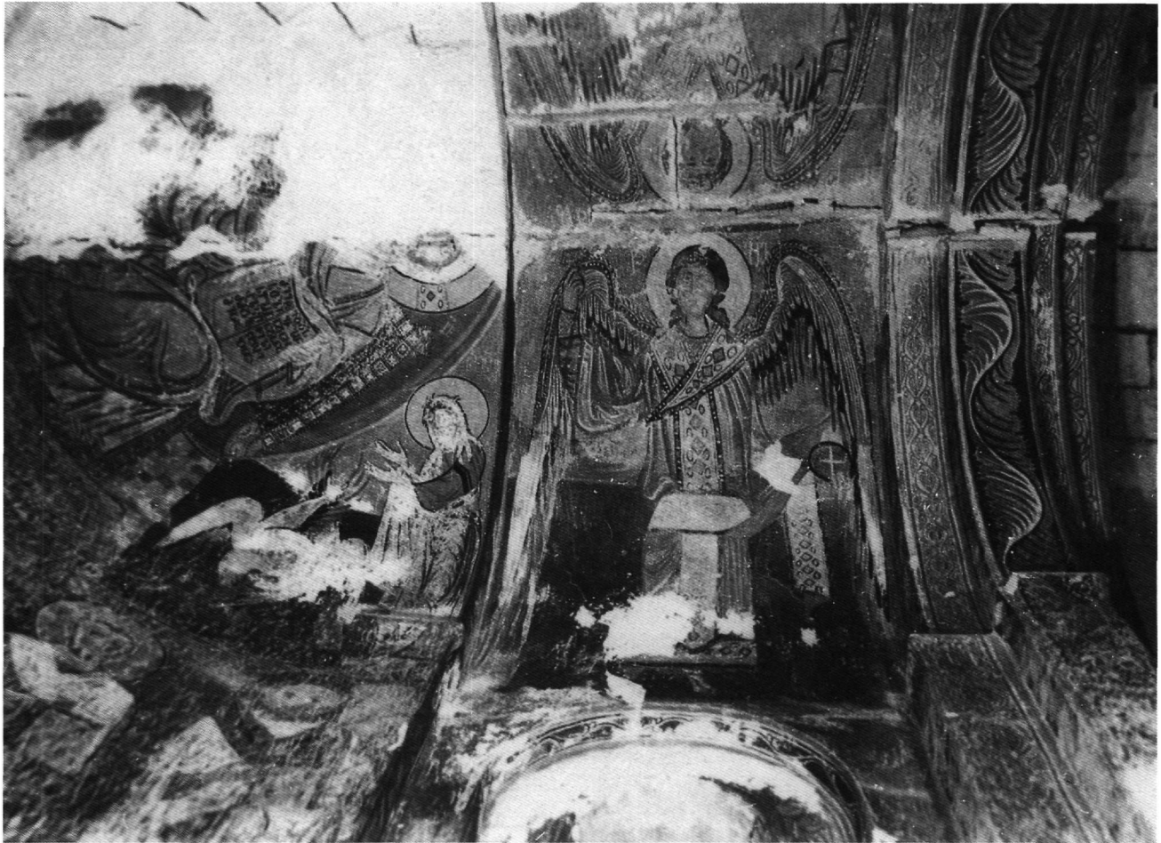
Fig. 3. The sanctuary. Barrel vault, the archangels Michael and Gabriel. Conch of the apse, the Deesis, detail: the enthroned Christ, St. John the Baptist, a Cherubim. Bottom register. The bishops, detail.

rank and probably of the same family. The Donor heading the group appears older and more richly attired than the other three. The inscriptions of their names written in magiscule letters were visible but not well enough preserved for identification.