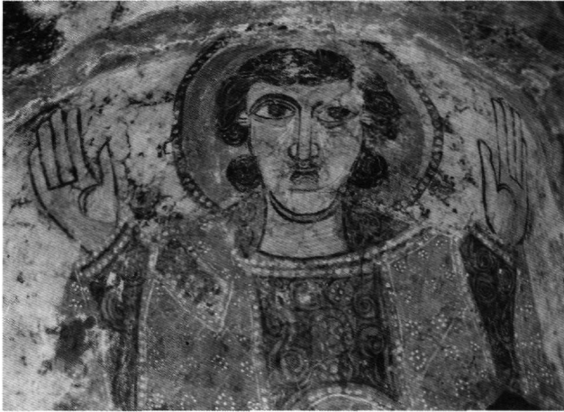
Fig. 20. Mani, Boularii. Church of Saint Panteleimon. Conch of east apse to the south. Unidentified saint.

Before concluding, two questions may be raised: