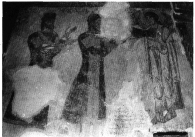
Fig. 4. North wall to the east. Bottom register. Unidentified Angel and Donors, detail.

The frescoes of Zemo-Krichi have been compared by Mrs. Virsaládze with the mural painting in the neighbouring province of Svaneti, and in particular with the frescoes of the church at Iprari, painted in 1096 by the artist Tévdoré. Although a more elaborate modelling of the figures was apparent, the expressive style of Zemo-Krichi is considered to have influenced the local school of painting of Svaneti up to the mid-twelfth century. The decoration in churches such as Nakipari ca 1130, Saint Cyricus and Julitte ca 1112, Cvirmi, and Maxvarisi ca 1140, have been cited as examples of an archaizing style 5 .