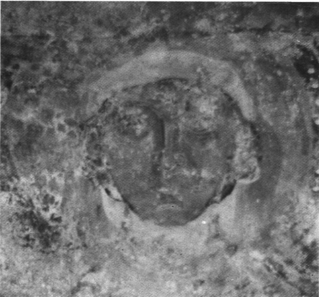
Fig. 14. Mani, Kounos. Church of Saint Paraskevi. North wall. Unidentified saint.