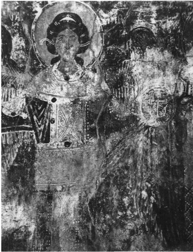
Fig. 24. Sanctuary. Barrel vault. South half. The archangel Michael.