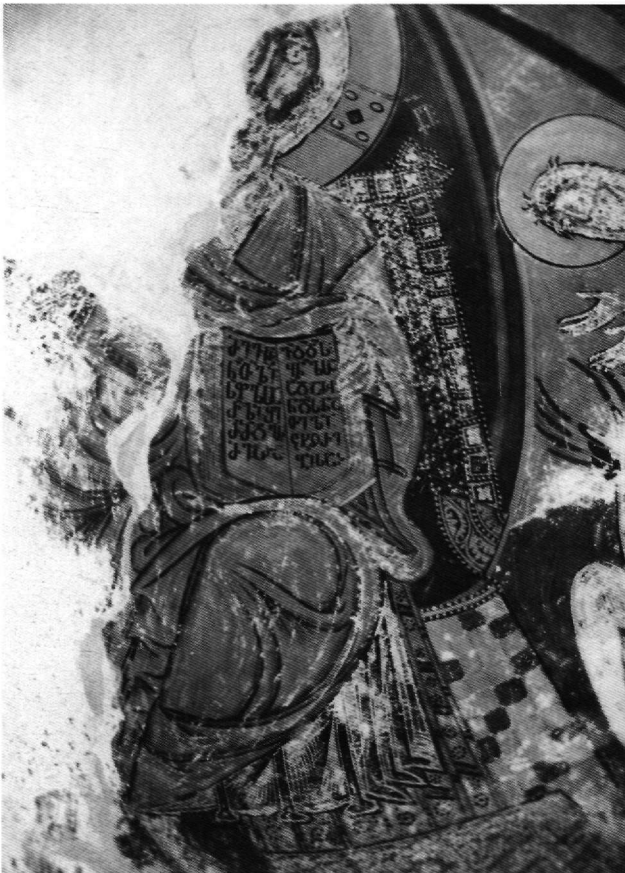
Fig. 9. Sanctuary. Conch of the apse. The enthroned Christ of the Deesis, detail.