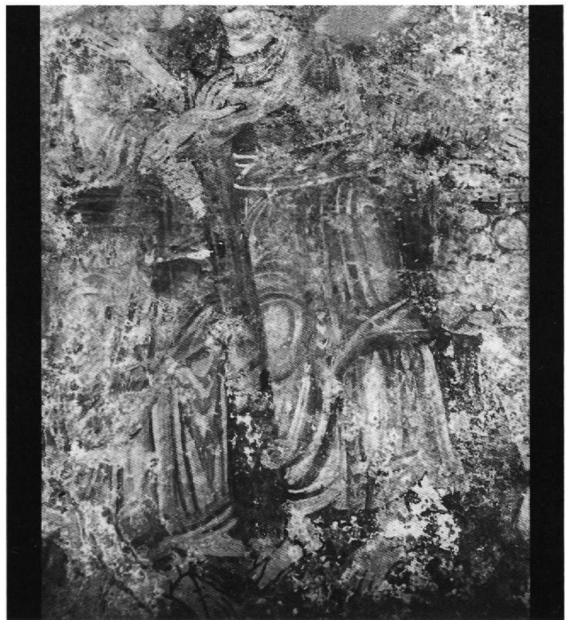
Fig. 8. Mani, Kounos. Church of Saint Paraskevi. South wall. The Betrayal of Christ , detail.

ed church in the Mani which preserves its inscription. It is a small single nave barrel-vaulted edifice, at present half demolished. The eastern section retains its two apses with a three-register fresco decoration and a painted inscription dating the monument and the frescoes to 991 AD. The figures are characterized by large heads and strongly accentuated features. The eyes are particularly emphasized and the faces stark (Fig. 20). Although the paintings are naive in character and execution, they possess expressive qualities enhanced by the ornamental use of colour. These paintings serve to define the dating of the frescoes of Saint Paraskevi near