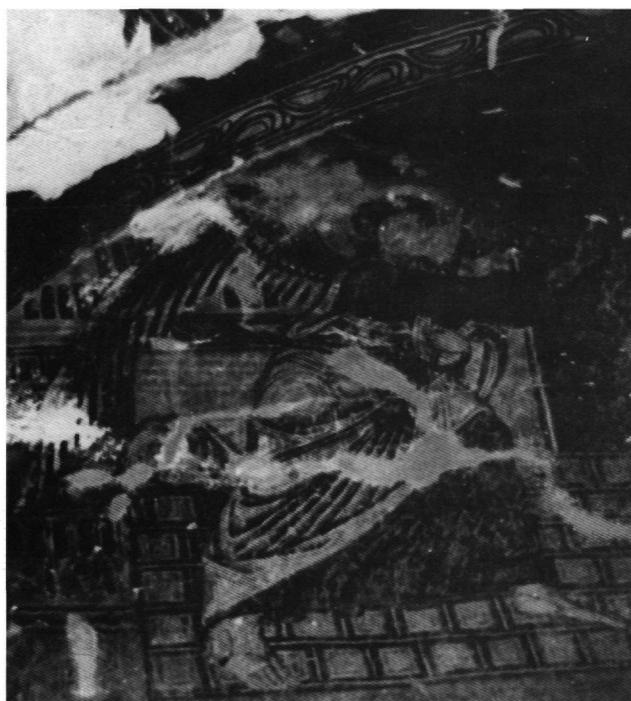
Fig. 5. East wall. Upper register. The Annunciation, detail. The archangel Gabriel.

The only frescoes of another region in Georgia which in certain instances may be compared with those of Zemo-Krichi were pointed out by Mrs. Virsaládze as being those of the church of Sion at Ateni in central Georgia,