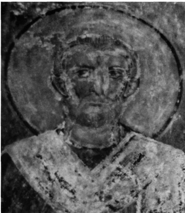
Fig. 22. Sanctuary. East apse to the south. Bottom register. Unidentified bishop.