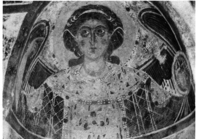
Fig. 21. Mani, Gardenitsa. Church of Saint Peter. Conch of east apse to the south. The archangel Michael.