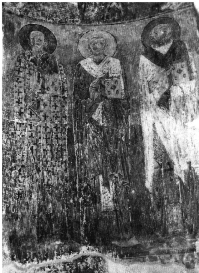
Fig. 11. Sanctuary. East wall. Bishops.