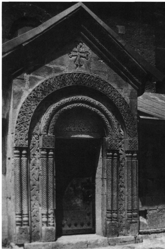
Fig. 2. The south portico.

The modelling of the faces was produced in ochre and olive-green with darker shades for the contours. No par-