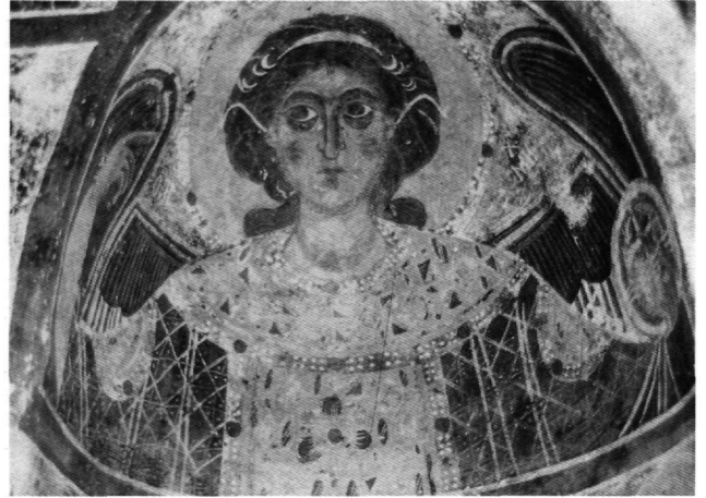
Fig. 21. Mani, Gardenitsa. Church of Saint Peter. Conch of east apse to the south. The archangel Michael.