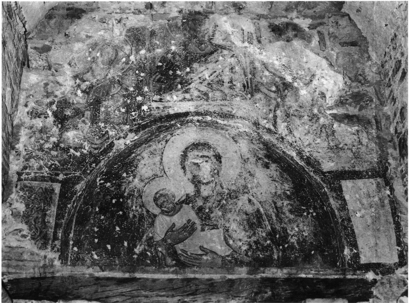
Fig. 1. Chios, Krena. Central part of the east wall of the narthex.

because the figure on the right, most probably Saint Eustathius, extends his hands in supplication to the Saviour. On the left, John's gesture may call attention to the divinity of the Logos. So, we have "a Deesis with two substitutes": John the Evangelist instead of the Virgin and Eustathius of John the Baptist.