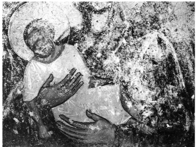
Fig. 3. Chios, Krena. Christ Child.

tions of the Deesis are known also from texts, as for example the Life of Lazarus the Galesiote, written by his disciple Gregory at the end of the eleventh century 11 . In the case of Krena the posture of Eustathius in supplication reinforces the meaning of intercession (παράκλησις), which was a function of the Deesis image, while that of John the Evangelist witnesses the divinity of the Logos, even if it does not belong to the earlier “visionary” type of the Deesis but to the later “interces-