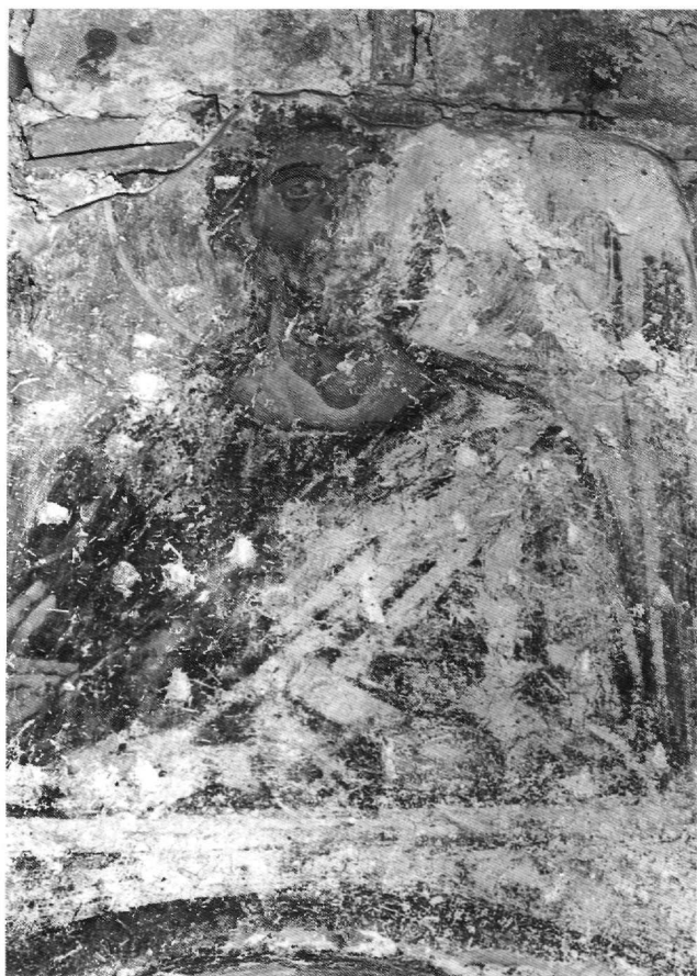
Fig. 4. Chios, Krena. Christ (detail).