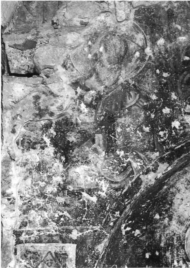
Fig. 5. Chios, Krena. St. John the Evangelist.