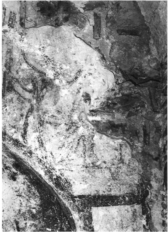
Fig. 6. Chios, Krena. St. Eustathius.

both as the Pantocrator in the framed icon and as a Child in the Virgin's lap.