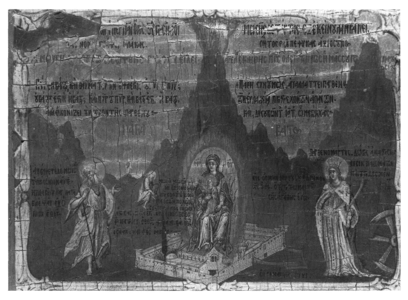
Fig. 1. Sinai. Monastery of St. Catherine. Fragment of an iconostasis beam with scenes from the Life of the Virgin.

rine occupies the central place<sup>16</sup>. In other eighteenth-century representations of Sinai her body is placed on the summit of a mountain<sup>17</sup>. On our icon there is simply her typical portrait. She is imperially dressed, carries a martyr's palm and is accompanied by the wheel of torture, which, according to legend, was broken by an angel<sup>18</sup>.