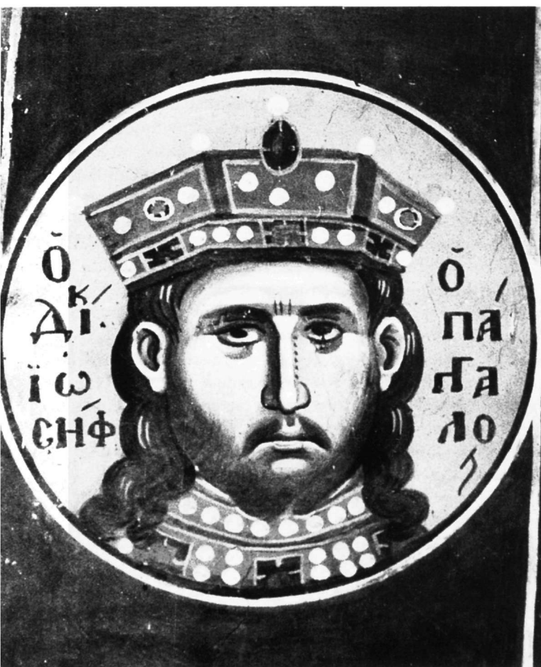
Fig. 3. Ohrid, Church of the Virgin Perivleptos. The Beateous Joseph. 1295.

Ο ΠΑΓΓΑΛΟC) (Fig. 3) 26 . In the upper zones of the naos of the church of St George at Staro Nagoričino (1316-1318) there are also paintings of the Old Testament virtuous: Samuel, David, Solomon, Noah, Job, Zaccharia, Moses, Melchisedek, Aaron, Joshua and the Beateous Joseph ([ΙΩCΗΦ] Ο ΠΑΝ[ΚΑΛΟC]) (Fig. 2) 27 . In the northwest dome of Gračanica (1318-1321) Joseph, along with Joshua, joins the Old Testament kings Manasseh, Amon and Hosea and the inscription running beside him is well preserved: Ο ΔΙΚ(ΑΙΟ)C ΙΩCΗΦ Ο ΠΑΝΚΑΛΟC 28 . In all these monuments the painters Michael and Eutychios depict Joseph as a young man and, probably influenced by his triumph in the cycle, in regal attire, wearing a crown, a divitision and a loros. His appearance and the iconographic context within which he figures at the Chora in Constantinople (1316-1321) are somewhat different from the above mentioned. Joseph (ΙΩCΗΦ) is shown as an old man with a long beard, dressed in a chiton