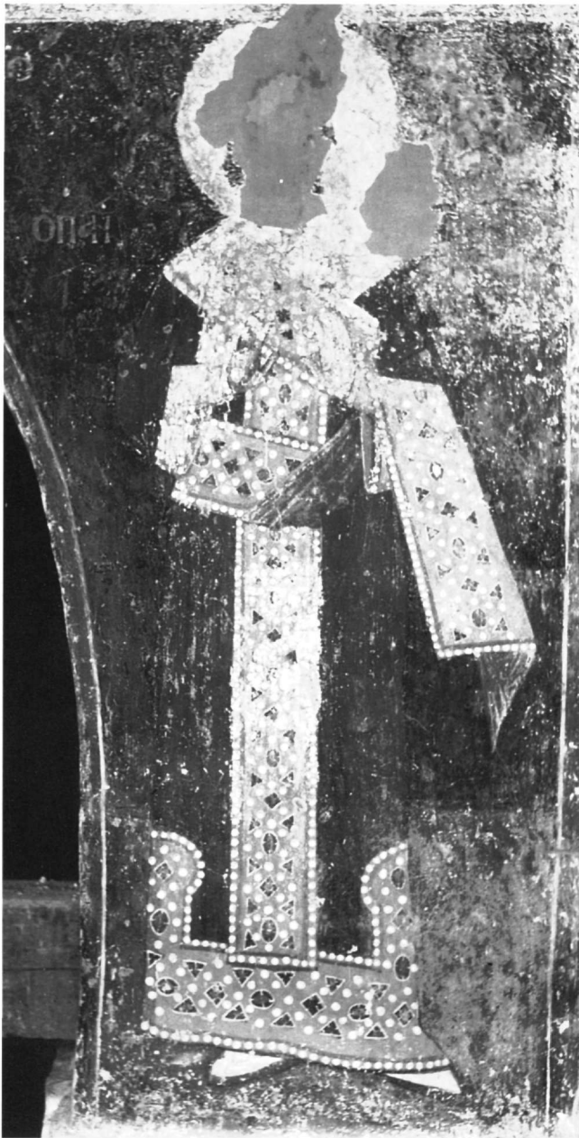
Fig. 2. Staro Nagoričino. The Beateous Joseph. 1316-1318.

sin and gained the appearance of the image and the chastity and the true symbol of Christ" 21 .