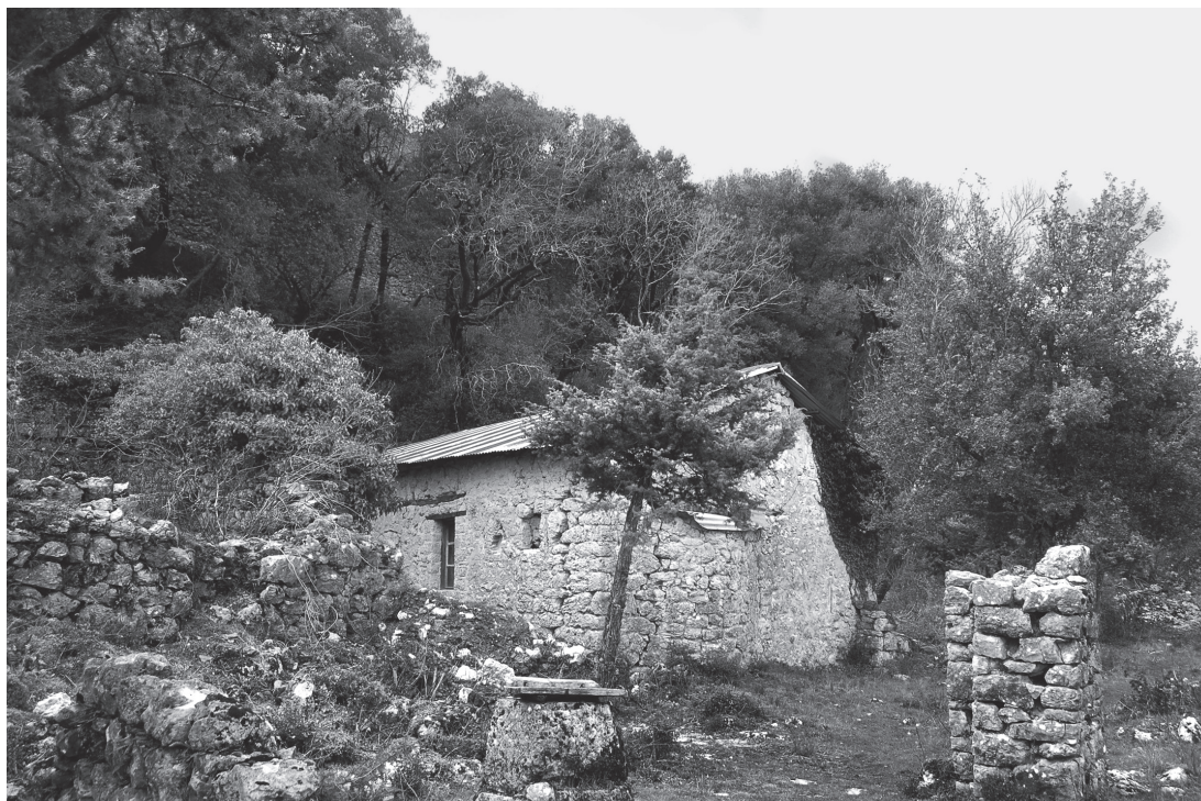
Fig. 1. The catholicicon of Prophet Elijah, Paidonia, Ioannina. External view.

emerging from the mouth of the sea-monster. On the western wall, the differentiation in the masonry reveals that, when the church was renovated, the original entrance was sealed and a new one was opened in the south side. This intervention happened before the surviving fresco given that there are no gaps in the iconography on the walls. The date of the first architectural phase can be placed before the 17th century: the arched ceramic decorative frame and the interjection of the ceramic tiles between the stones, sporadic but noteworthy mainly in the upper portion of the eastern wall, are elements of church architecture of the 15th and early 16th centuries in Epirus 7 .