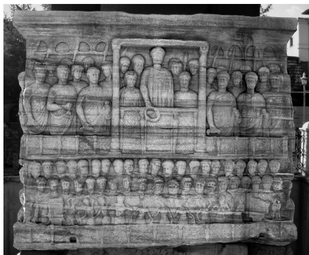
Fig. 6. Members of the imperial court, dancers and musicians at the Hippodrome, marble base of an obelisk, Constantinople, about 390. Istanbul, Sultanahmet Meydani.

However, despite the Christian efforts to construct female dancers as dangerous sexual beings, the reality seems to have been less clear-cut. To begin with, there seems to be a distinction between professional dancers and amateurs, followed by a second distinction regarding the quality of performance. 26 Male and female dancers, whose services were employed in private banquets and weddings, were professionals, and their presence is a feature of the imperial court and wealthy households, not only in the capital but also in the periphery. 27 The early 3rd century contract