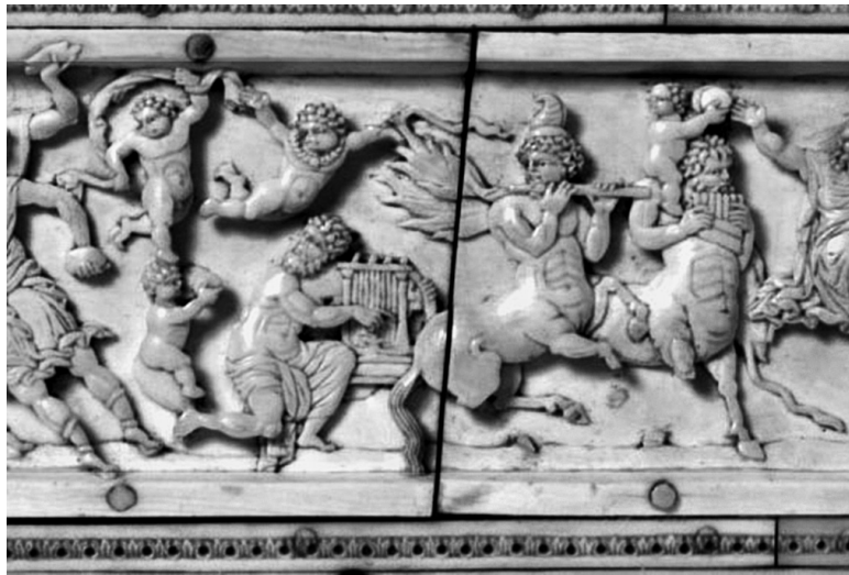
Fig. 3. Mythological figures as musicians, detail from the lid of the Veroli casket, 10th century. London, Victoria and Albert Museum 216-1865 (photo © V&A Images / Victoria and Albert Museum, London).

chestra (Fig. 3). 8 If we leave aside the mythological guise of the Veroli figures and turn our attention from the figures to the musical instruments they appear to be playing, we may derive information about how the casket's images reflect contemporary daily life.