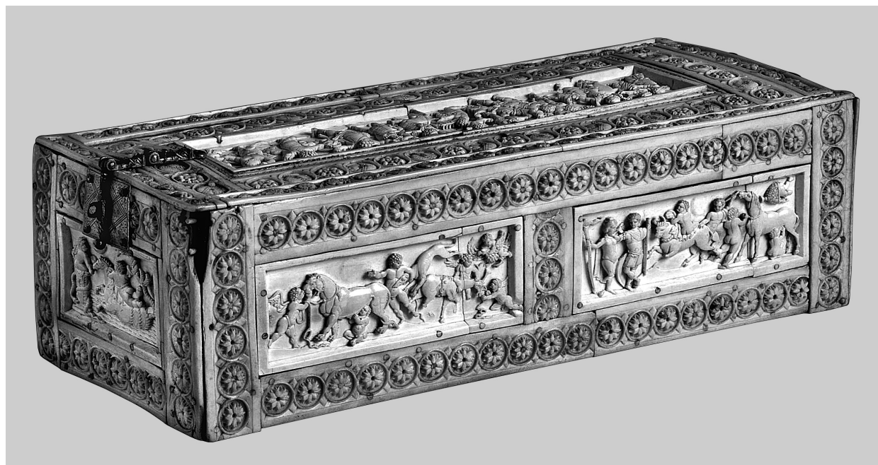
Fig. 1. General view of the Veroli casket, 10th century. London, Victoria and Albert Museum 216-1865.

materials they are made of (ivory and bone) and their complex construction, but also in the fact that their decoration comprises the most coherent body of secular art to survive from medieval Byzantium, from gods and heroes of the Graeco-Roman tradition to contemporary Byzantine imperial imagery and ornamental patterns. In the pages that follow, I will focus on the group of musicians and dancers that feature on the lid of the Veroli casket.