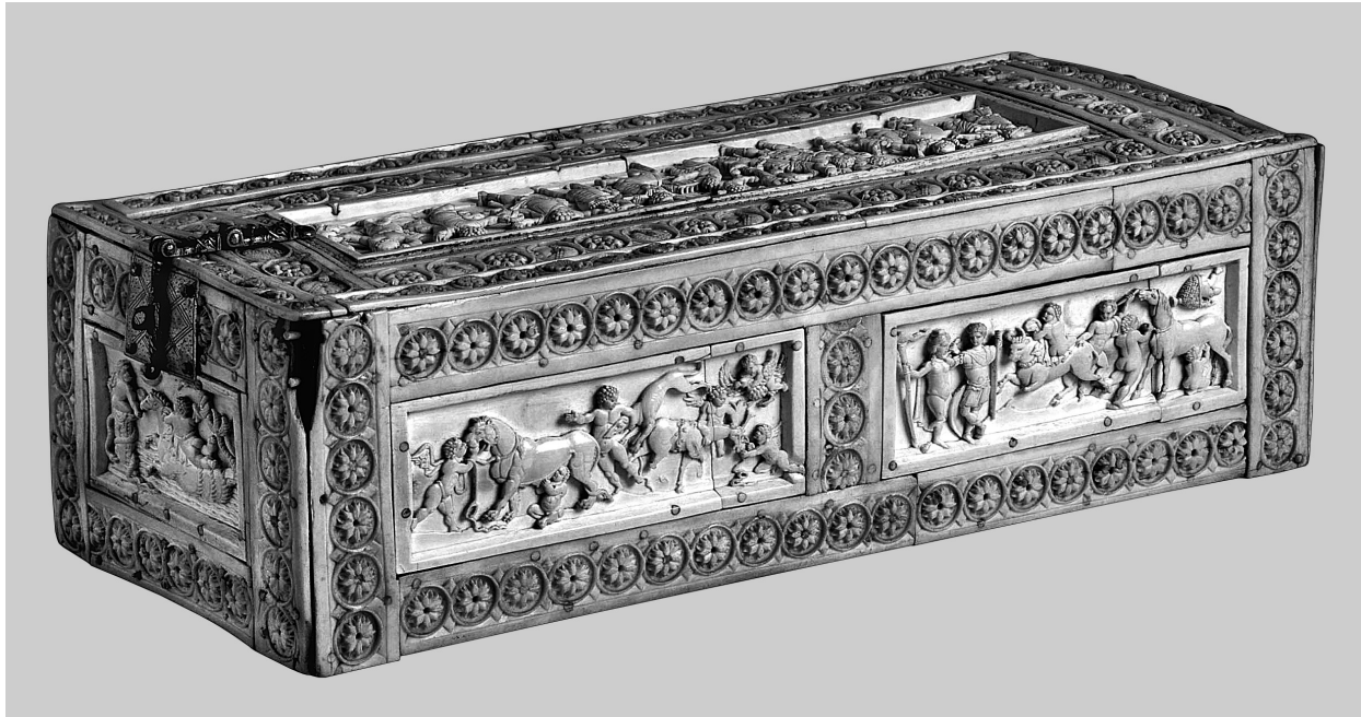
Fig. 1. General view of the Veroli casket, 10th century. London, Victoria and Albert Museum 216-1865 (photo © V&A Images / Victoria and Albert Museum, London).

materials they are made of (ivory and bone) and their complex construction, but also in the fact that their decoration comprises the most coherent body of secular art to survive from medieval Byzantium, from gods and heroes of the Graeco-Roman tradition to contemporary Byzantine imperial imagery and ornamental patterns. In the pages that follow, I will focus on the group of musicians and dancers that feature on the lid of the Veroli casket.