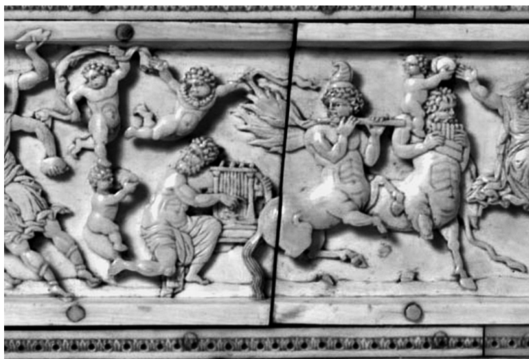
Fig. 3. Mythological figures as musicians, detail from the lid of the Veroli casket, 10th century. London, Victoria and Albert Museum 216-1865.

chestra (Fig. 3). 8 If we leave aside the mythological guise of the Veroli figures and turn our attention from the figures to the musical instruments they appear to be playing, we may derive information about how the casket's images reflect contemporary daily life.