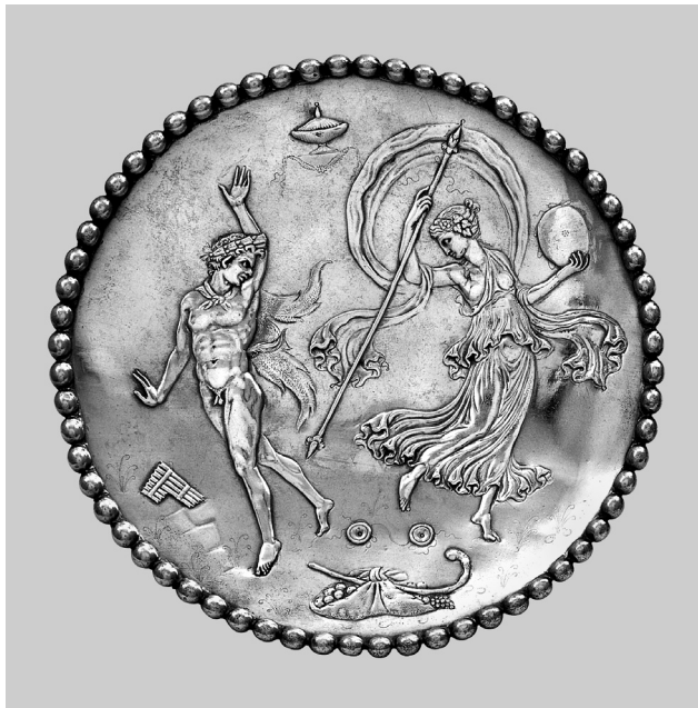
Fig. 5. A silver dish with a dancing Satyr and a dancing Maenad with thyrsus and tambourine from the Mildenhall Treasure, Suffolk, 4th century. London, British Museum 1946.1007.3.

Hippodrome and the imperial court, in banquets and taverns, and in marriage celebrations, while the art of instrumental performance was a feature of noble breeding. For example, in the medieval epic poem of Digenis Akrites , the love struck young hero expresses his emotions by playing his kithara , in which, the poet informs us, he had been instructed, as well as in other musical instruments. 19