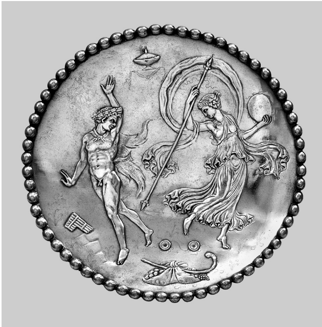
Fig. 5. A silver dish with a dancing Satyr and a dancing Maenad with thyrsus and tambourine from the Mildenhall Treasure, Suffolk, 4th century. London, British Museum 1946.1007.3.

Hippodrome and the imperial court, in banquets and taverns, and in marriage celebrations, while the art of instrumental performance was a feature of noble breeding. For example, in the medieval epic poem of Digenis Akrites, the love struck young hero expresses his emotions by playing his kithara , in which, the poet informs us, he had been instructed, as well as in other musical instruments. 19