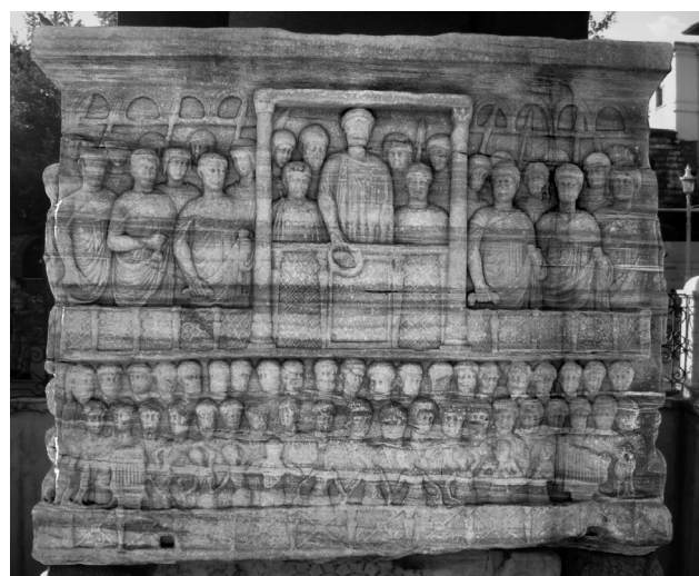
Fig. 6. Members of the imperial court, dancers and musicians at the Hippodrome, marble base of an obelisk, Constantinople, about 390. Istanbul, Sultanahmet Meydani.