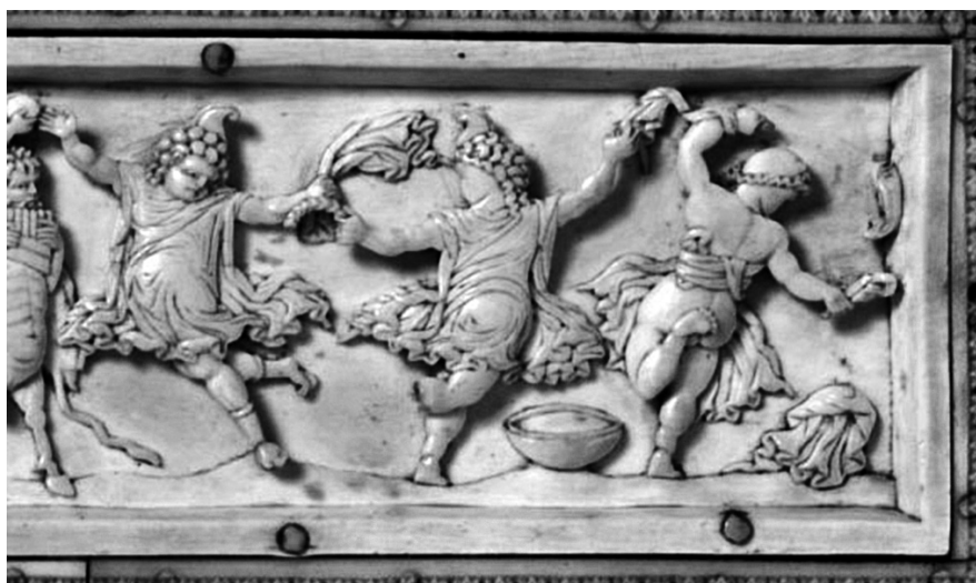
Fig. 4. Mythological figures dancing, detail from the lid of the Veroli casket, 10th century. London, Victoria and Albert Museum 216-1865.

ment are six finger holes on the tube. 13 From manuscript illustrations it has been deduced that the length of the transverse flute was approximately 60 cm long, and that it was played right-handed. 14