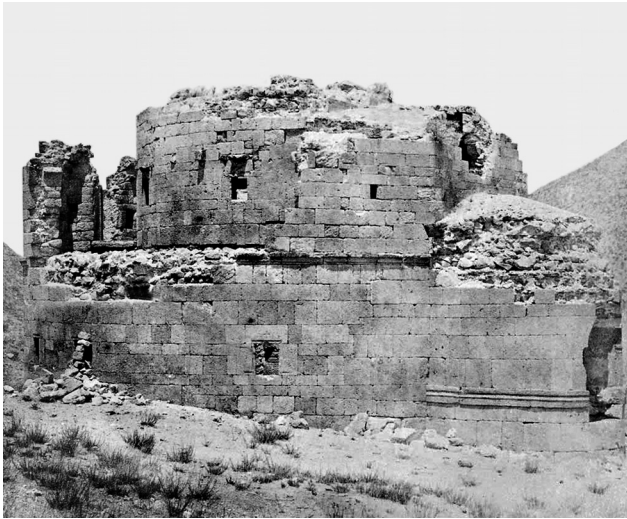
Fig. 7. Binbirkilise, Church 10 seen from the southeast