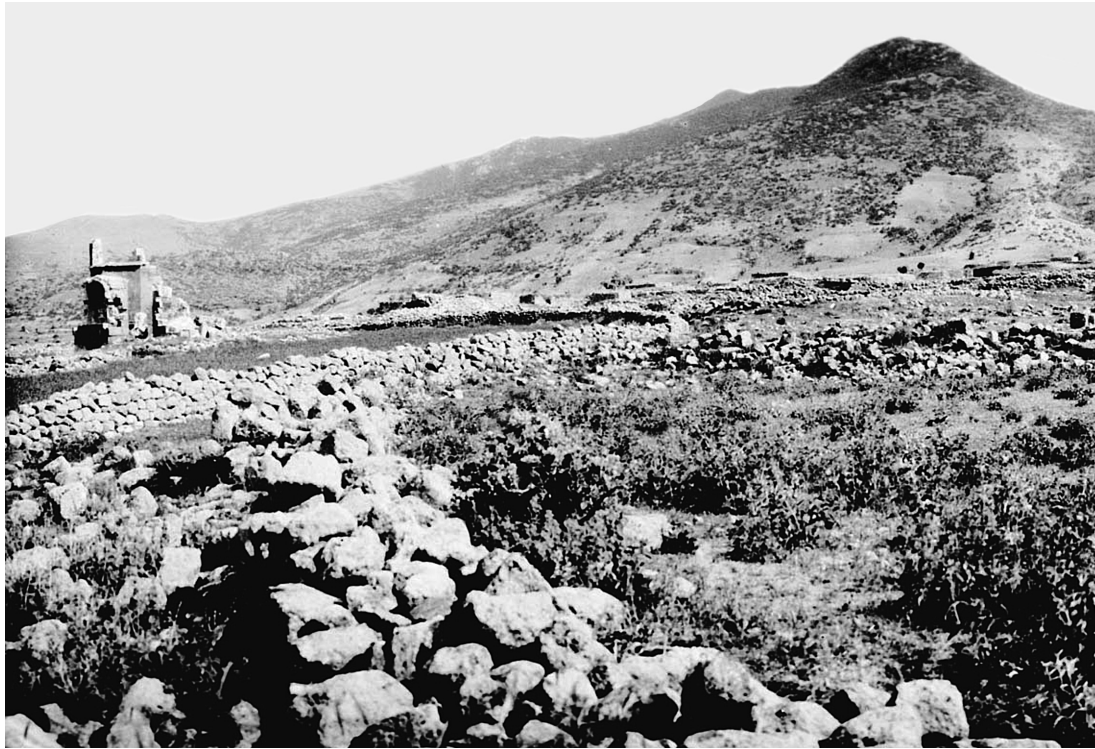
Fig. 2. Binbirkilise, view of the ruins of Churches 8 and 13, seen from the northwest, by Gertrude Bell, 1907 (courtesy of the University of Newcastle Gertrude Bell Archive).

standing in 1907 to a considerable height, and was one of the most interesting and picturesque monuments of the city. In 1908 I observed no change in it: in 1909 all the higher parts had fallen, and the structure had become a ruin, deprived of its most striking features. 7 Ramsay was no doubt confused, for his chronology is contradicted by the photographs of Crowfoot (1900) and Bell (1907), which show Church 8 already fallen. 8 Ramsay must have been remembering his impression from his earlier visits to the site.