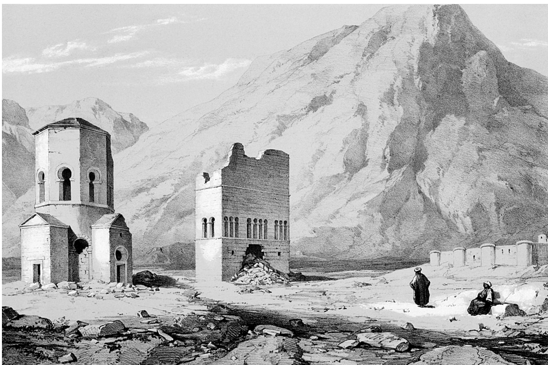
Fig. 1. Binbirkilise, view of Churches 8 and 13 seen from the northwest, by Léon de Laborde, 1826.

did not leave a visual record of it before the end of the century. The photographs, drawings, and site description prepared by J. W. Crowfoot and J. I. Smirnov in 1900 were incorporated into Josef Strzygowski's Kleinasien , and these give the first systematic overview of the remains. 3 The German engineer Carl Holzmann visited the site in 1904 while overseeing the construction of the Baghdad railroad, and he produced a folio of drawings. 4 Holzmann's drawings are less useful, however, for they show only his hypothetical reconstructions of the original states of the churches but provide no indication of their condition at the time he examined them.