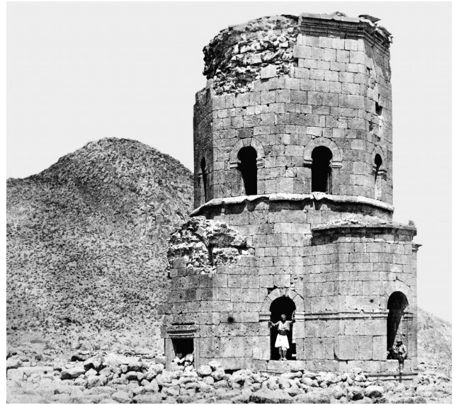
Fig. 5. Binbirkilise, view of the ruins of Church 8, seen from the northwest, by John Henry Haynes, 1887 (Harvard University, Aga Khan Visual Resources).

have struck the site sometime between 1887 and 1900. 13 Haynes's photographs of Churches 10 and 13 also reveal dramatically different states of preservation in 1887 than those noted after 1900, and his photographs clarify numerous aspects of these buildings. Bell had relied on the engravings from Laborde for reconstructing the elevations, 14 but Haynes's photographs allow us to correct the inevitable distortions in Laborde's images, which attenuate the buildings and exaggerate the horseshoe arches. The visual information they provide also complements the often astute observations of Bell.