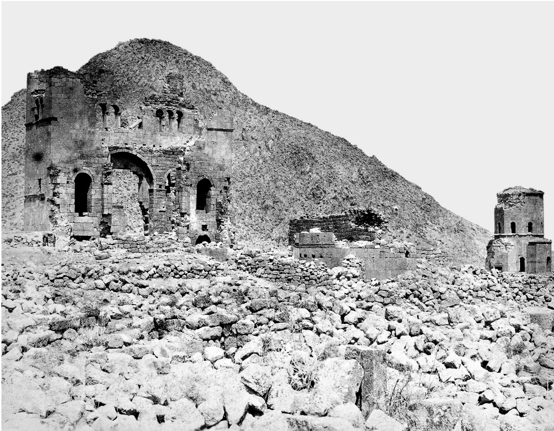
Fig. 3. Binbirkilise, view of the ruins of Churches 8 and 13, seen from the southeast