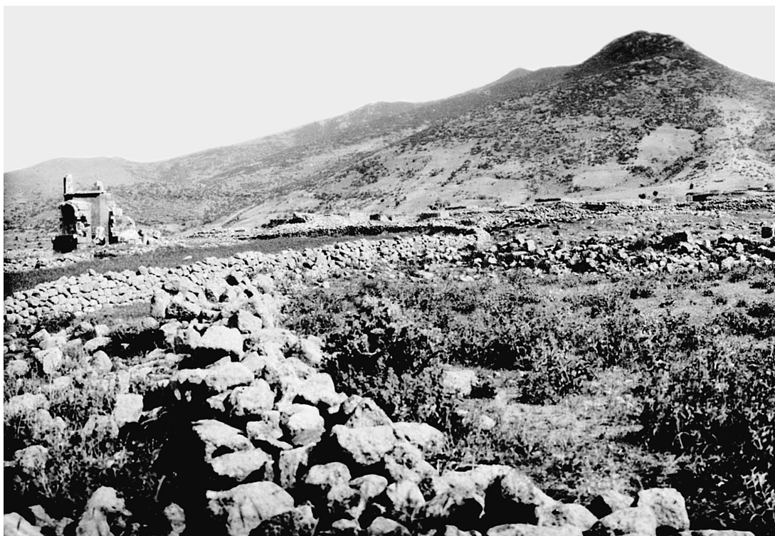
Fig. 2. Binbirkilise, view of the ruins of Churches 8 and 13, seen from the northwest, by Gertrude Bell, 1907 (courtesy of the University of Newcastle Gertrude Bell Archive).

standing in 1907 to a considerable height, and was one of the most interesting and picturesque monuments of the city. In 1908 I observed no change in it: in 1909 all the higher parts had fallen, and the structure had become a ruin, deprived of its most striking features.” 7 Ramsay was no doubt confused, for his chronology is contradicted by the photographs of Crowfoot (1900) and Bell (1907), which show Church 8 already fallen. 8 Ramsay must have been remembering his impression from his earlier visits to the site.