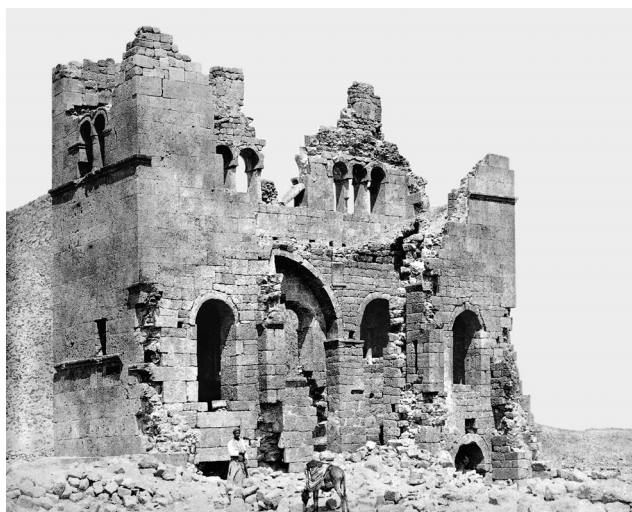
Fig. 4. Binbirkilise, view of the ruins of Church 13, seen from the northwest