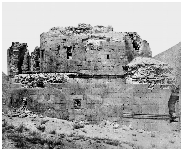
Fig. 7. Binbirkilise, Church 10 seen from the southeast