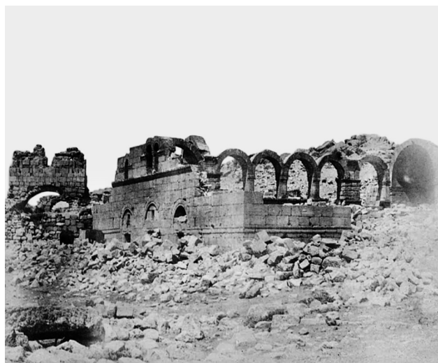
Fig. 8. Binbirkilise, Churches 32 and 39 seen from the southwest, by John Henry Haynes, 1887 (Harvard University, Aga Khan Visual Resources).

ing to the left terminates in a door. The central octagon rises through a clerestory zone below the dome, disguised behind the rising walls of the octagon. Where the facing has fallen away, the mortared rubble core of the wall is exposed. The octagon is rotated so that its corners, rather than its flat walls, are on axis. As a consequence, the lower diagonal windows (where one of Haynes's companions stands) are set at the corners, while the clerestory windows are positioned within each facet of the octagon. The lack of vertical alignment adds to the visual interest of the building.