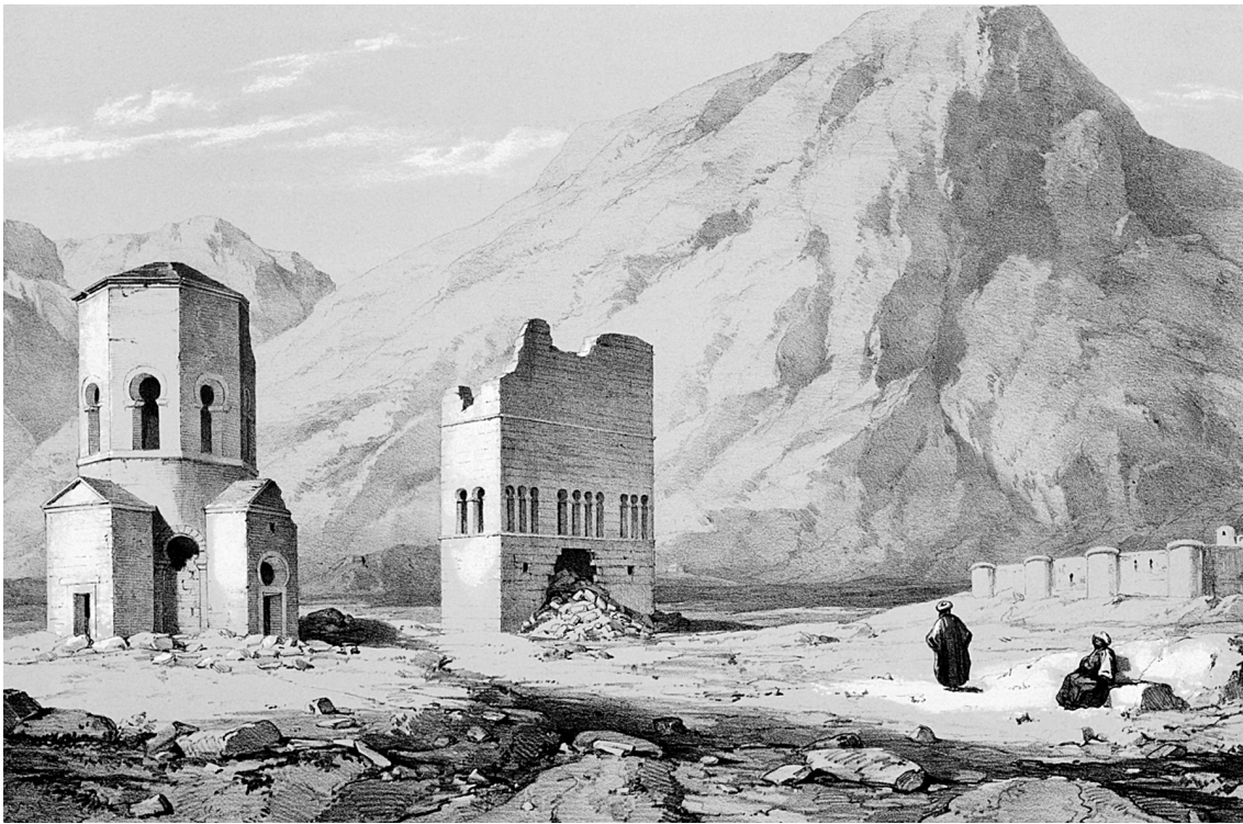
Fig. 1. Binbirkilise, view of Churches 8 and 13 seen from the northwest, by Léon de Laborde, 1826.

did not leave a visual record of it before the end of the century. The photographs, drawings, and site description prepared by J. W. Crowfoot and J. I. Smirnov in 1900 were incorporated into Josef Strzygowski's Kleinasien , and these give the first systematic overview of the remains. 3 The German engineer Carl Holzmann visited the site in 1904 while overseeing the construction of the Baghdad railroad, and he produced a folio of drawings. 4 Holzmann's drawings are less useful, however, for they show only his hypothetical reconstructions of the original states of the churches but provide no indication of their condition at the time he examined them.