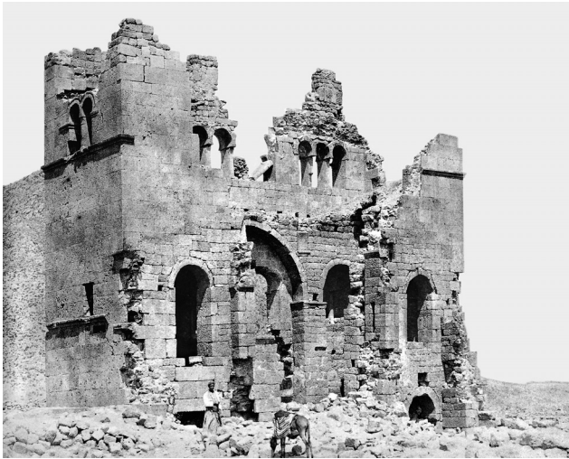
Fig. 4. Binbirkilise, view of the ruins of Church 13, seen from the northwest