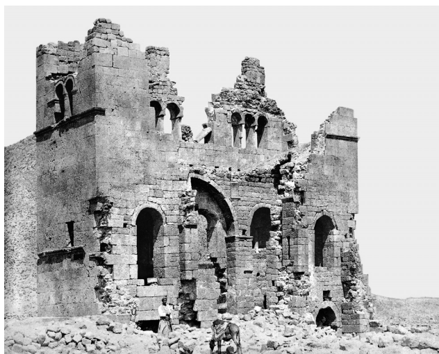
Fig. 4. Binbirkilise, view of the ruins of Church 13, seen from the northwest