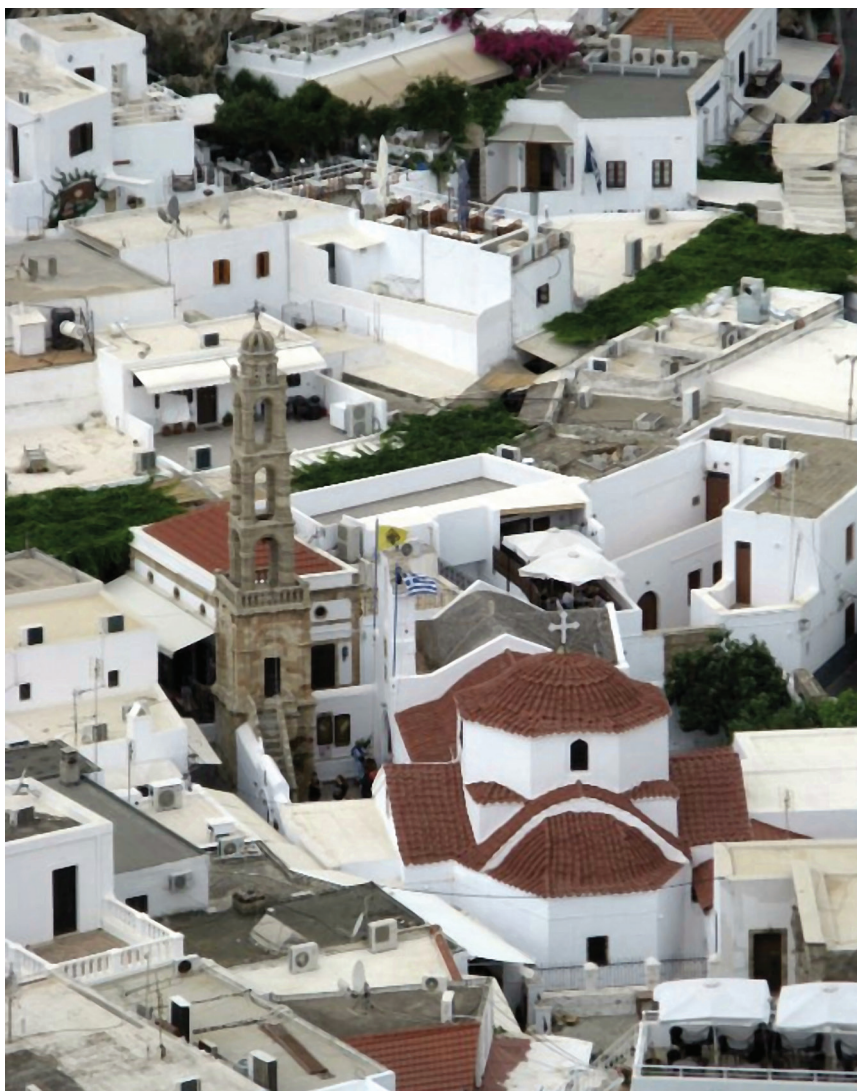
Fig. 11. Rhodes, Lindos. Panoramic view of the village looking West. At the centre the church of the Dormition of the Virgin.

that strongly suggests contemporaneity is evident in the central church of the village of Lindos, that of the Dormition of the Virgin (Fig. 11). Although its plan is different, a cruciform one, this does not affect the conception of