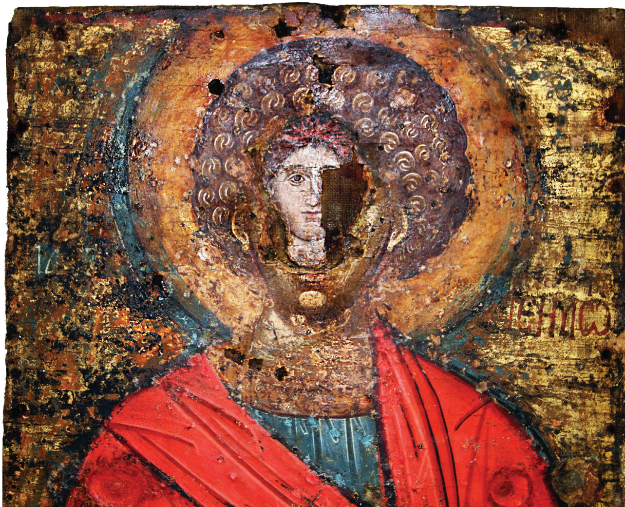
Fig. 6. Telos , katholikon of Hagios Panteleemon. The upper half of the icon (detail of Fig. 5).

hand, covering the quite robust torso of Panteleemon is rendered in a much more linear manner with mainly angular and rigid folds which, nonetheless, retain a softness because of the warmth of the salmon red colour. The light on the drapes is only faintly present, blended with the main colour to form the lighter tones that are meant to contrast the parallel lines of darker colour marking the folds. White highlights both on the chest and the sleeve endow the tunic with a metallic essence.