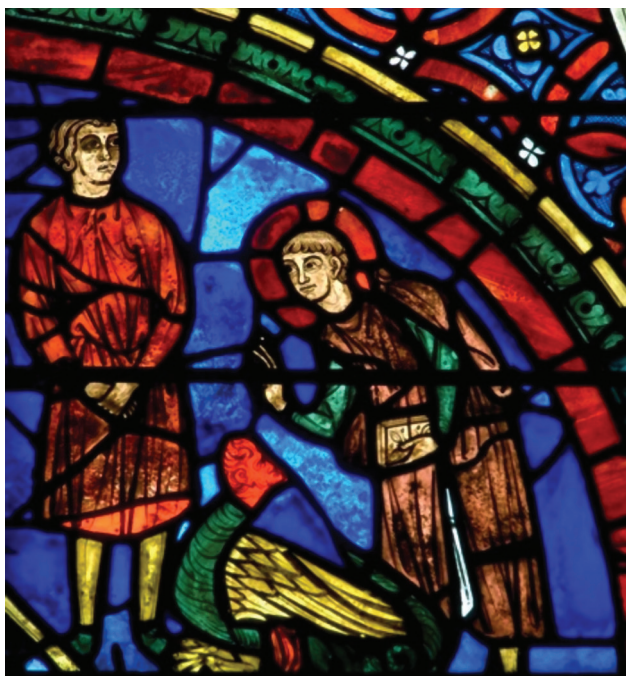
Fig. 9. France, cathedral of Chartres, northeast absidiole, glass panel of the lower window with the life of Saint Pantaleon. Saint Pantaleon with the bird, ca. 1206.

“simple” format of the garments does provide a hint about the nucleus of the inspiration for the Telos and Monolithos icons, which could be thought to draw from a side representation of a vita cycle instead of a frontal portrait. Yet one minor detail that could, nevertheless, pinpoint some kind of alien dependence is the triangular cut the himation of Panteleemon has at its lower part. The garment of St. Pantaleon in the glass panel with the bird from the Cathedral of Chartres (Fig. 9) has an analogous rendering with triangular openings for the sleeves, a detail that, if nothing else, raises questions about the origin of the above detail in the Telos icon. Taking all the previous into account we could assert that the painter of the Telos icon intended to recall a specific model with the garments of Panteleemon, if not drawing inspiration from an unknown vita cycle of his which could have been latent on the island 61 .