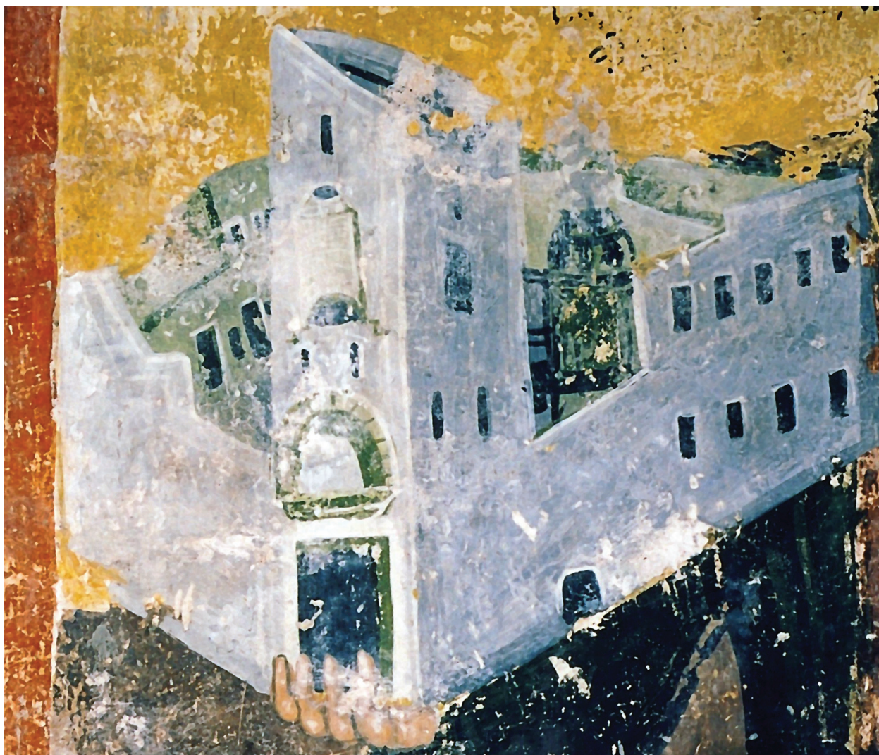
Fig. 12. Telos, katholikon of Hagios Panteleemon. Detail of the model of the katholikon offered by the donor Ionas (detail of Fig. 1).

with a masterful perspective view has provided every single feature of it. With an emphasis on the diagonal axis for depth and notion of the third dimension to the viewer, one can see the rectangular shape of the enclosure walls, the defensive tower which draws attention by being in the foreground and its peculiar diagonal roofing, the detailed rendering of the entrance's door jambs with the relieving arch over it, the circumference of the ramparts of the walls, the two-storey buildings with different-sized windows, and last but not least even a small auxiliary entrance on the south wall. Equally interesting is the monochromatic rendering of a tubular form