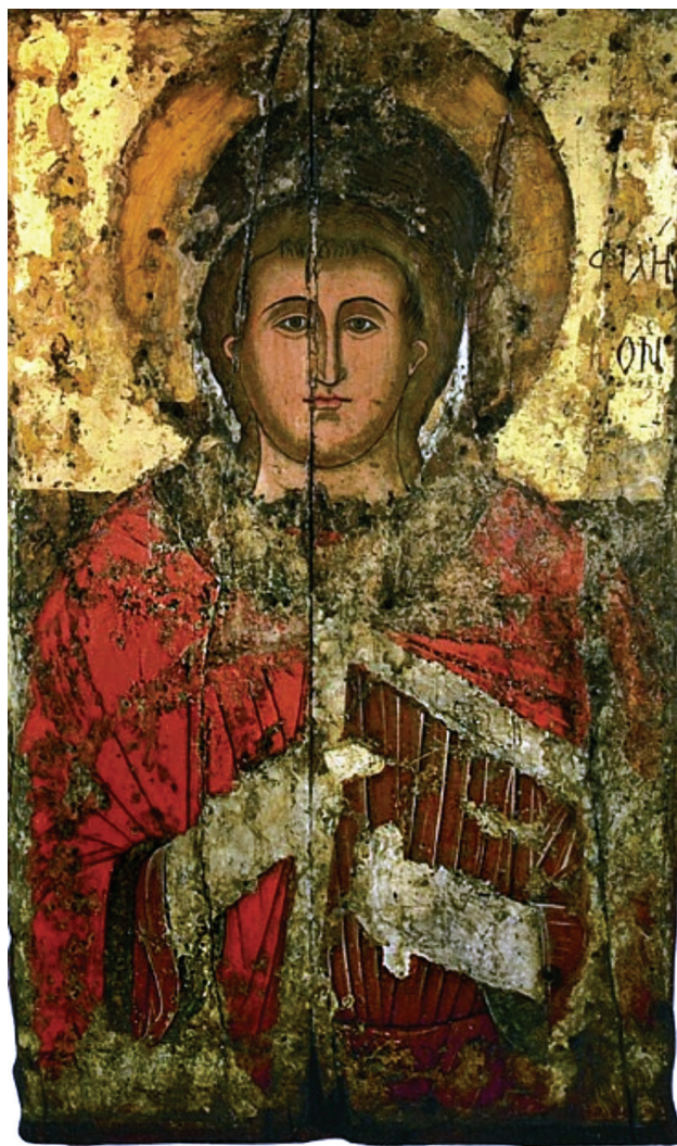
Fig. 7. Rhodes, Arnitha, monastery of Hagios Philemon. Icon of Saint Philemon.

help noticing that the type of dress –the way the tunic is presented with vertical tubular folds, the belt at his waist, the cloak over it and its articulation with rounded edges on the right side– has visual affinities with the fashion of secular attires worn by Western laymen, as