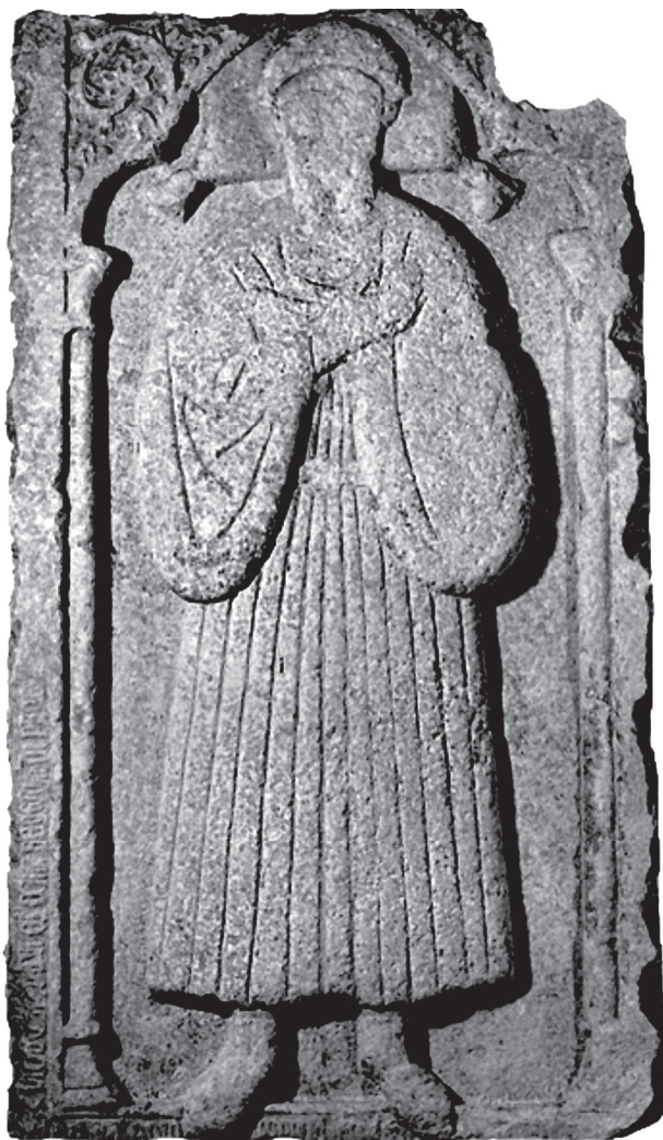
Fig. 8. Rhodes, Archaeological Museum. Sepulchral monument of a layman, ca. 1370-1380, Gray marble of Lardos.

attested on tombstones from the city of Rhodes dated in the last quarter of the 14th century (Fig. 8) 56 . This kinship is instructive about how these elements made their way into religious iconography and shows in the most meaningful way that they were appropriated within the cross-cultural artistic climate of the mixed society of the island.