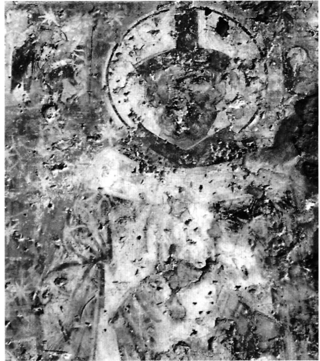
Fig. 7. Famagusta, Carmelite church. Saint Nicholas in western attire, c. 1350-1370.

Close to the figure of the Archangel Michael is displayed a remnant of fresco whose stylistic features point to still another artistic tradition, that of the Latin West (Fig. 8). Against a deep blue (or "ultramarine") background were originally represented three female figures; that of Saint Mary Magdalene can still be seen on the right, whereas the silhouette of a flying angel holding the edge of a cloth is the only preserved fragment of a major composition which most probably included a Vergin of Mercy spreading Her mantle over a group of worshippers. That the composition was in-