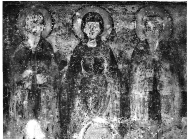
Fig. 3. Famagusta, "Nestorian" Church. Saint Paraskeve and Two Holy Monks, c. 1300.

The treatment of such features as hairs and facial details indicate strong links with the style of the mid-thirteenth century frescoed cycles in Ma'ad and Bahdeidat 18 . As recently stated by Erica Cruikshank Dodd, this trend of monumental painting in the Lebanon reflects the style characterizing the frescoes of the Syrian monastery of Mar Musa al-Habashi, dated 1192, and other paintings in Syria (Saints Sergius and Bacchus and Deir Yakub in Qar'a) and should be labelled as specifically Syrian, since it proves to be different from either Byzantine or Western art and to have much more in common with contemporary Muslim painting 19 . The main characteristics of such a stylistic tendency are the predominance