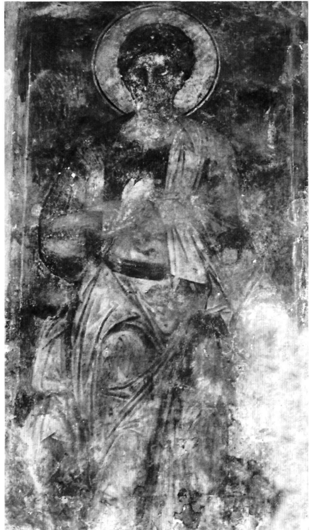
Fig. 6. Famagusta, "Nestorian" church. A young Apostle (Saint Philip?), c. 1350-1370.

Since a considerable number of Palaiologan-style murals is still preserved within the churches of Famagusta, it is reasonable to think that this town must have been the centre of dissemination of such a new trend to the rest of the island; even if their state of preservation is very precarious, they still display many common features which enable us to hypothesize that they were all executed at about the same date by the same hands, those of a team of painters coming from one of the major centres of the Byzantine empire. Since this style is encountered in such different buildings as the Latin conventual church of the Carmelites, the Byzantine-rite cathedral of St George of the Greeks and its small adjacent church, the Maronite chapel of St Anne and the "Nestorian" church 37 , one has to conclude that such masters enjoyed a great success in town and accepted to work for different patrons and religious communities; on the other hand, this points out that the pictorial tradition of Byzantium was still appreciated and reputed to be authoritative even by non-Greek christians.