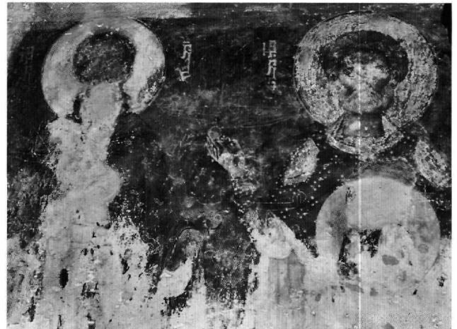
Fig. 5. Famagusta, “Nestorian” church. A holy monk and the martyr Menas, c. 1350-1370.

However, this is only one side of the coin, since if one approaches those parts of the church dating from the second building campaign, a completely different style and iconography is encountered. In the southern aisle, close to the entrance, is displayed a rather huge figure of the Archangel Michael, according to the standard type often found in both Byzantium and Cyprus (cf., among many other instances, the gigantic rendering of Him in the southern wall of the naos at Lagoudera, 1192). To the right of the door are represented a holy monk and the Egyptian martyr Menas in orant pose, with the bust of the Pantokrator included in a medalion on his chest (Fig. 5), whereas the western side of the north-west pier of the central bay is decorated with the fig-