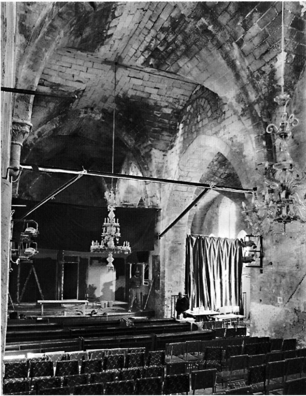
Fig. 2. Famagusta, “Nestorian” church. View of the interior.

which would have been obsolete in the second half of the fourteenth century; more clearly, such features as the shafts of columns supporting the vaulting of the central nave and starting out of the wall in the form of a right angle, are reminiscent of the elbow-columns known from Crusader monuments in Palestine (as, for example, the church at Abu Ghosh 4 ). Moreover, the use of groined, instead of ribbed vaults, supports the hypothesis of an earlier datation; such a covering is found also in the Famagustan church of the “Hospitaliers” (which was recently dated back to the early fourteenth century by Jean-Baptiste de Vaivre 5 ) and in the now inaccessible chapel of Saint Anne (known to have been a Maronite church) 6 .