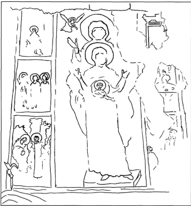
Fig. 4. Famagusta, "Nestorian" church. Sketch of a fresco displaying Saint Anne and the Virgin Mary "Platytera" flanked by six scenes of Mary's Infancy (author's sketch).

conception of Saint Anne by stressing the iconographical analogy of the two figures 28 .