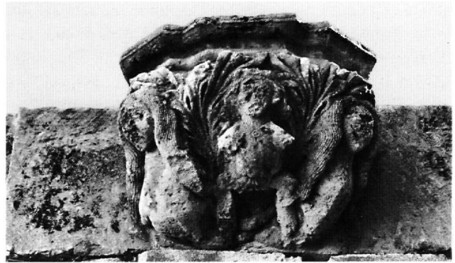
Fig. 9. Bellapais Abbey, Chapter House. Bracket decorated with a man and two syrens, first half of the fourteenth century.

It is much more likely that the "White Genoese" refugees from Jbail had been Syrian Orthodox or Melkite. The "Jacobite" church, as a consequence of its emphasis on the Son's divinity, was inclined to accept that Mary ought to be pure and exempt from the original sin since the very moment of Her conception 58 , and shared with the Copts a deeply rooted worship for Saint Menas 59 . Such details may favour an at-