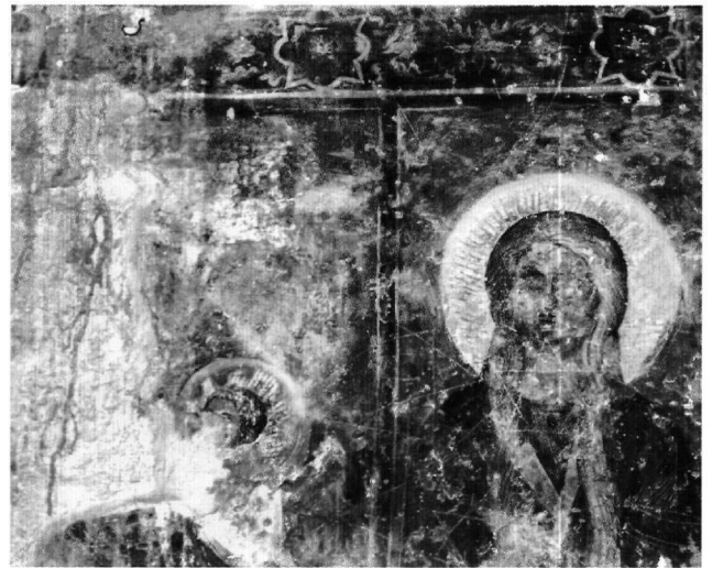
Fig. 8. Famagusta, "Nestorian" church. Fragment of a Virgin of Mercy and Saint Mary Magdalene, first half of the 14th century (photo: author).

Quite interestingly, the most clearly Italianate fresco in Famagusta is preserved within an Arab Christian church, as the evidence of the Syriac inscriptions points out. The image, though commissioned by Latin patrons and made in a Latin pictorial language, was by sure not intended for Western beholders. A small detail, that of the coat-of-arms displayed on the upper edge, helps us to clear up the mystery: they invariably consist of