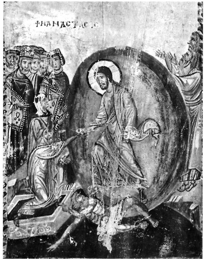
Fig. 2. Descent into Hell. The Trebizond Lectionary (Cod. gr. 21, National Library of Russia, St. Petersburg), f. 1v.

Other miniatures in the Trebizond Lectionary combine this new task with a splendid mastery of traditional painterly devices. Take, for example, the miniature of the Descent into Hell on f. 1v (Fig. 2). The miniature's dimensions are fully in keeping with the small light figures, and the composition is not meant to look cramped. At the same time it is dominated by the shining mandorla surrounding the figure of the resurrected Christ. Everything is constructed around this mandorla. It seems to shift the space and the figures, pushing them towards and beyond the edges of the frame. Beneath Christ's feet lies the personification of Hell, a muscular, swarthy old man, chained and reclining. The treatment of his body reveals an excellent knowledge of antique models: the fine proportions, complex foreshortening, and correct structure with plastically outlined sinews and muscles. Our Lord is trampling upon Hell, yet His feet barely touch the figure of the old man. The figure of Christ is quite weight-