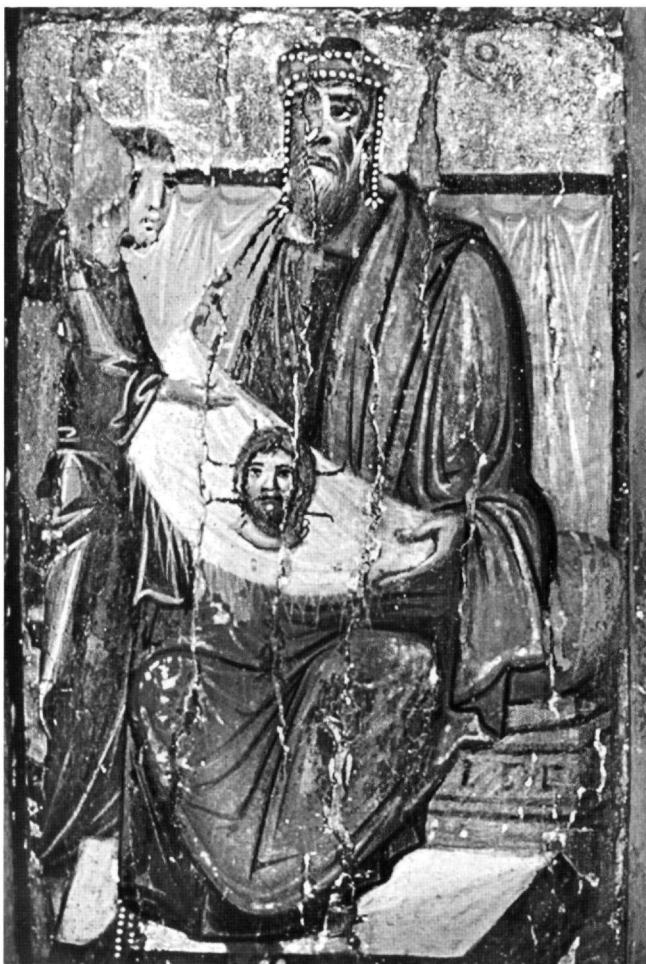
Fig. 6. King Abgar. Monastery of St Catherine, Mount Sinai.

church. In many other works of this period they are used more widely and boldly.