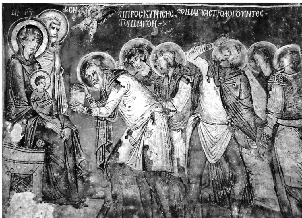
Fig. 3. Adoration of the Magi. New Tokali Church, Göreme, Cappadocia.

sioned by the future Emperor Nicephorus II Phocas and his relatives 15 . Their iconographic programme is based largely on local Cappadocian traditions 16 . However, the superb quality of the painting and the close affinity with artworks of the Macedonian Renaissance allow us to assume that the ensemble was produced by masters who were connected in some way or other with Constantinople 17 .