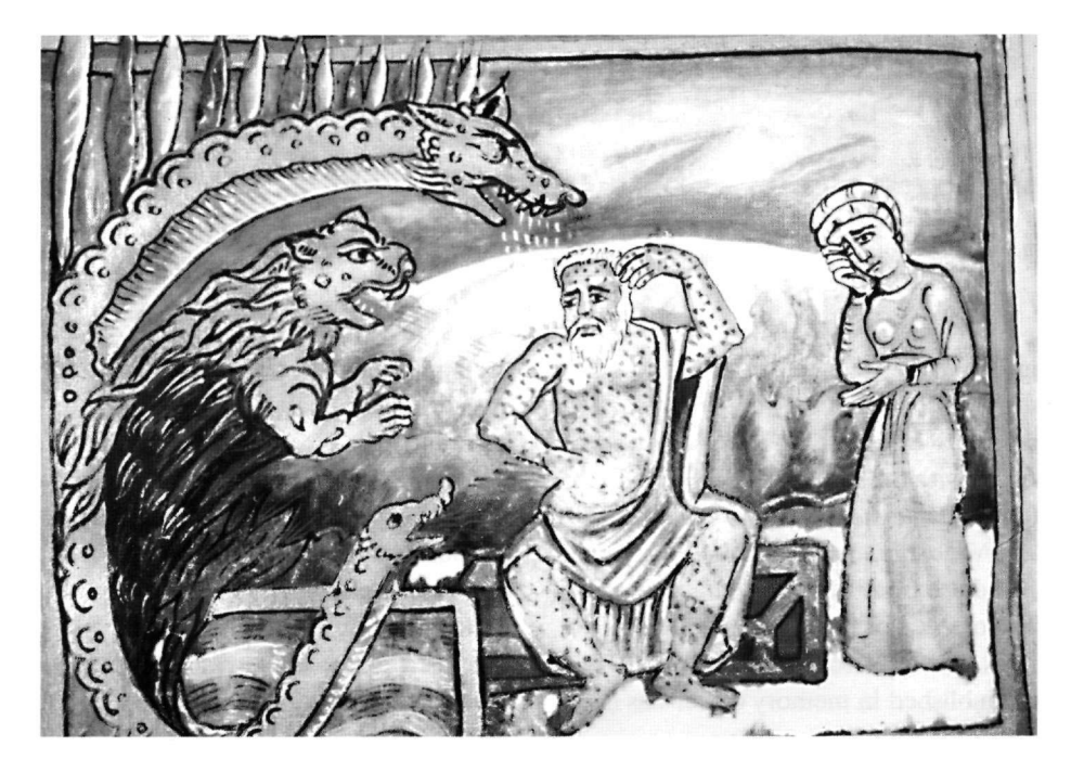
Fig. 1. Job and the Adversary, Vat. gr. cod. 749 (f. 25).

749 and Patmos cod. 171 the meaning of the word διάβολος is certainly adversary .