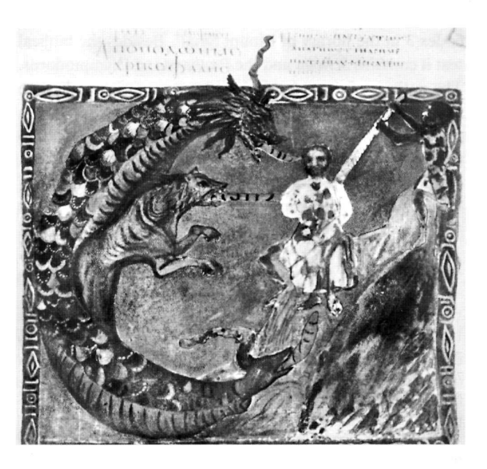
Fig. 2. Job and the Adversary, Patmos cod. 171 (f. 51).

which concerns the celestial war at the end of time may be cited as an example: 'The great dragon (δράκων) was thrown down, that serpent (ὄφις) of old that led the whole world astray, whose name is Satan (ὁ Σατανάς), or the Devil (Διάβολος)'.