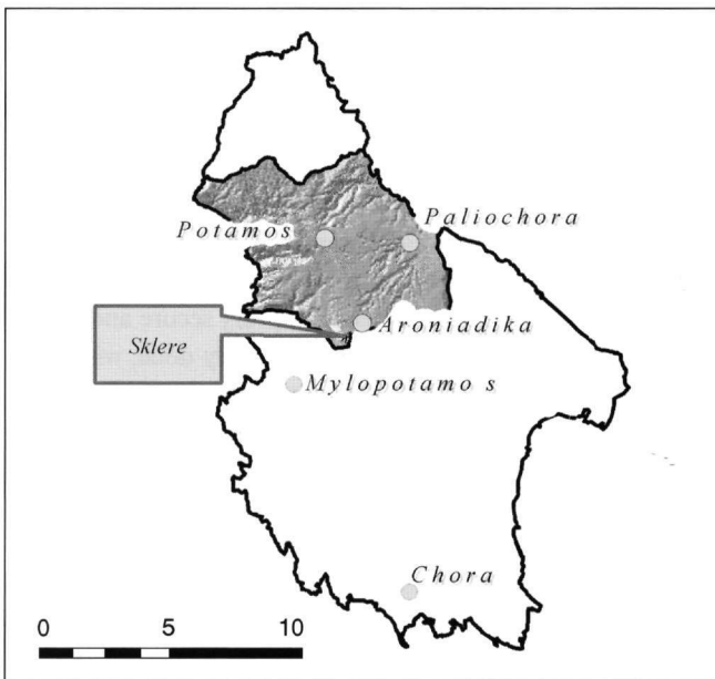
Fig. 1. Kythera, showing major places in the fifteenth century and location of Sklere.

This text provides significant and detailed information about the situation in the northern part of Kythera (Cerigo) in the quarter century between Barbarossa's raid and the date of the report. Firstly, this is one of the earliest specific references to the Ottoman attack in 1537 and the informant says, pointedly, that the city of Ayios Demetrios fell without a battle because the inhabitants offered no resistance. It is also arguably the earliest reference that Barbarossa carried off 7,000 prisoners (in his 38 ships), a number that has (as mentioned) reasonably been questioned by all modern historians 31 .