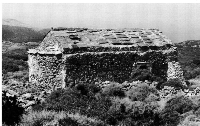
Fig. 3. The church of Ayios Demetrios, Sklere, from south.

The walls and stone features at Sklere are located to the east of the church of Ayios Demetrios, just below (i.e., just to the west of) the high-point of the ridge (Figs 3 and 4). Most dominant are two large stone features on the north, each of which is well over a meter in height, with the western one ca. 15 m. long and ca. 5 m. wide; both piles have clearly-defined walls running more or less east-west, ca. 1.5 m. wide and presently more than a meter high (Figs 5-6). The walls are broken by what seems clearly to be a passageway ca. 2.5 m. wide, mid-way between the two stone piles. Another similar stone pile is located on the south west, up to 1.5 m. high and