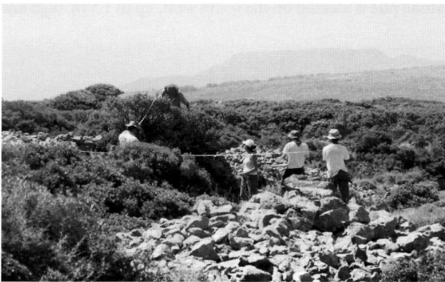
Fig. 4. Stone features and architectural recording.

Certain facts show clearly that this cannot have been a proper castle of the period, first of all because the walls, stone features, and pottery are all located just below (to the west)