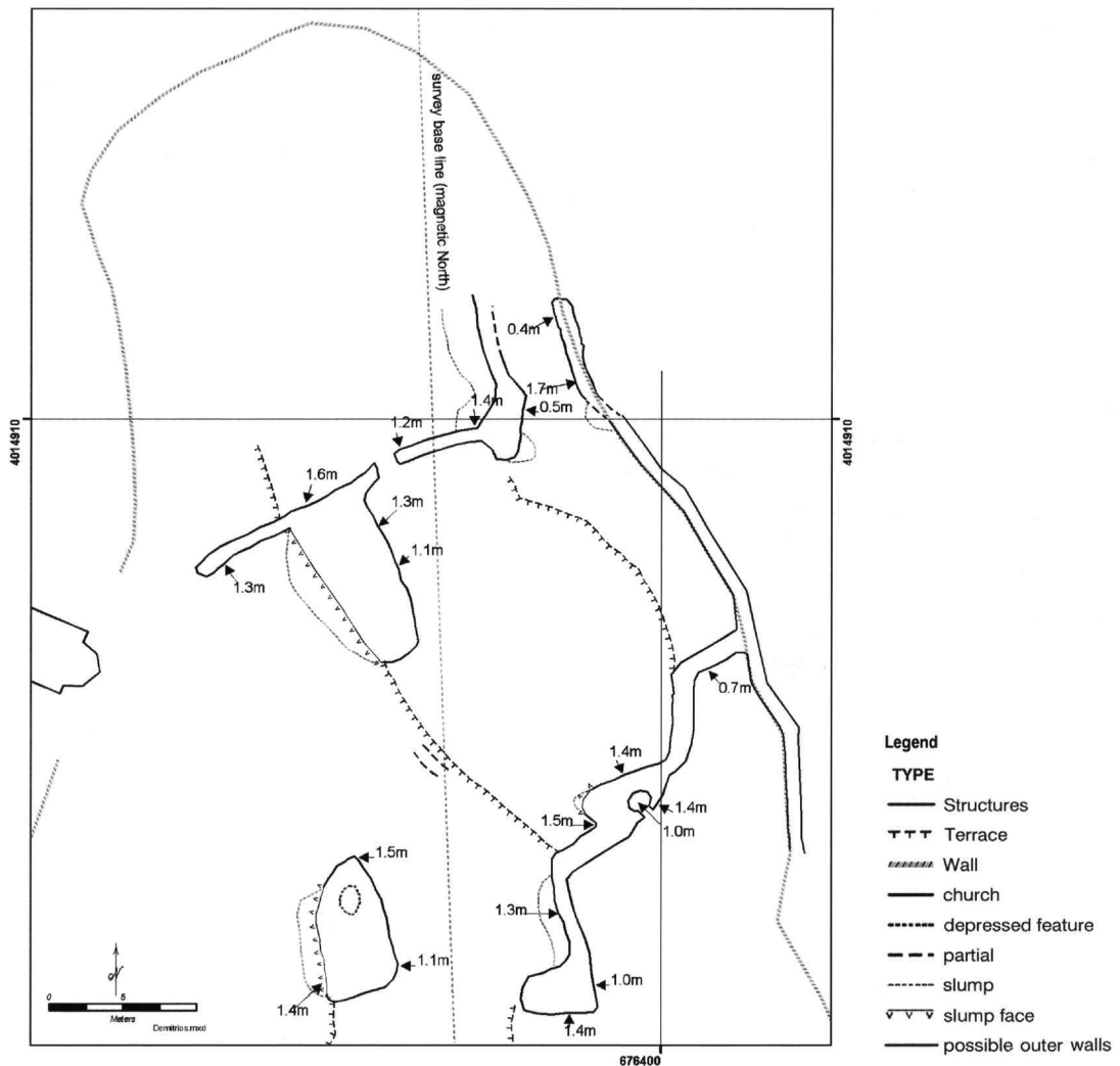
Fig. 6. Extant features and elevations.

beyond. In addition, it is not impossible that a tower or vigla was built just to the northwest of the fortifications, in the spot now occupied by the modern fire observation station. The remains suggest a rudimentary fortification that was not meant to attract or be defended against a concerted enemy attack. Rather, it was a place of concealment, but still a high point that could be defended and, in the worst of situations, might provide some protection against a frontal charge. Naturally, it is impossible to be certain, but I would like to suggest that the remains at Sklere are to be connected with the proposal to fortify a site at Selerì. The presence of the church of Ayios Demetrios is further evidence in this direction. The saint, after all, was the patron of the former fortified capital of the island, from which many of the inhabitants had arguably fled. It would be natural to name the church in honor of that saint. Further, Ayios Demetrios was one of the