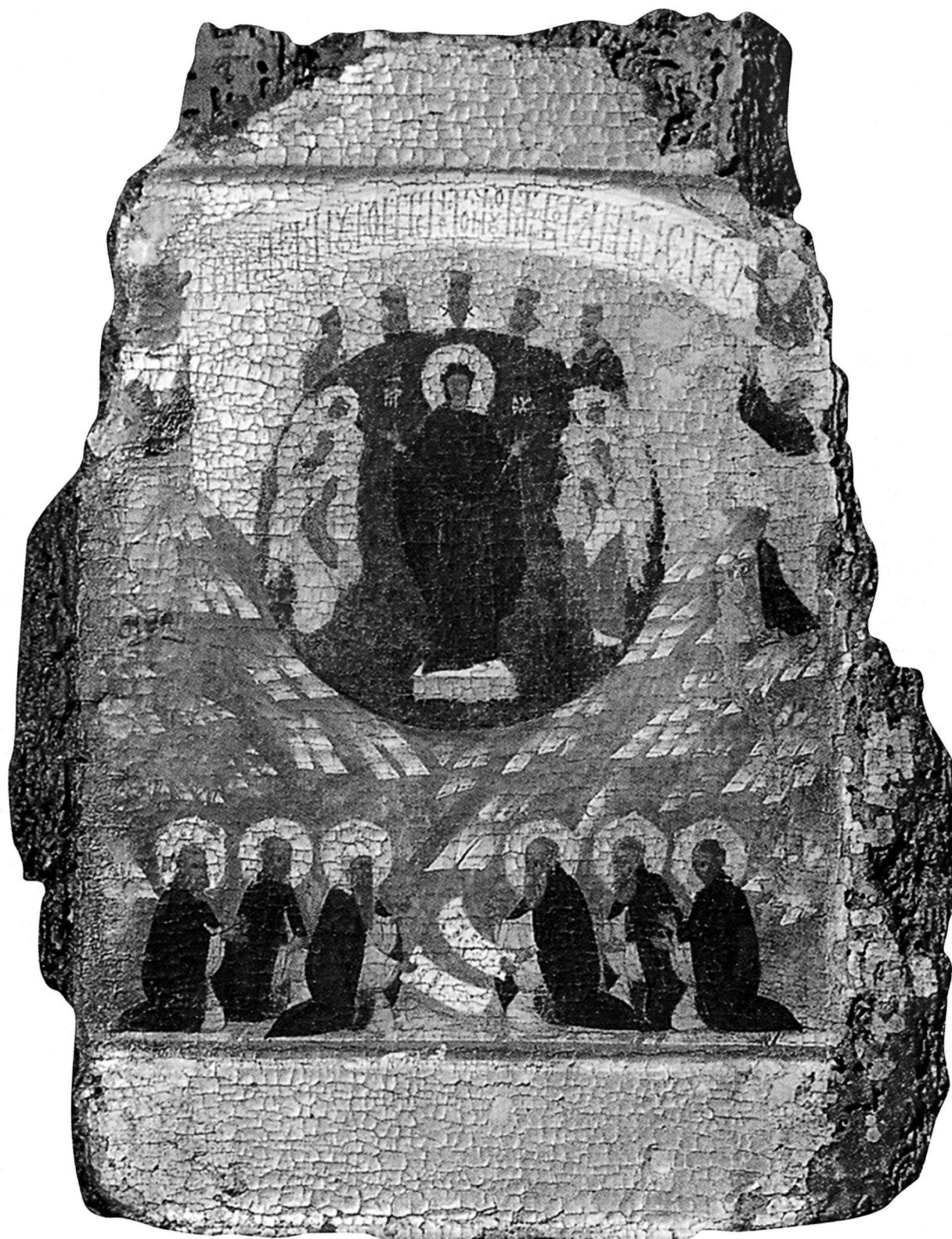
Fig. 2. «Τὴν ἀεμακάριστον καὶ παναμώμιτον...». Composition from the series on the theme "Axion Estin". Russian icon of the late 15th-early 16th century. St. Petersburg, Russian Museum.