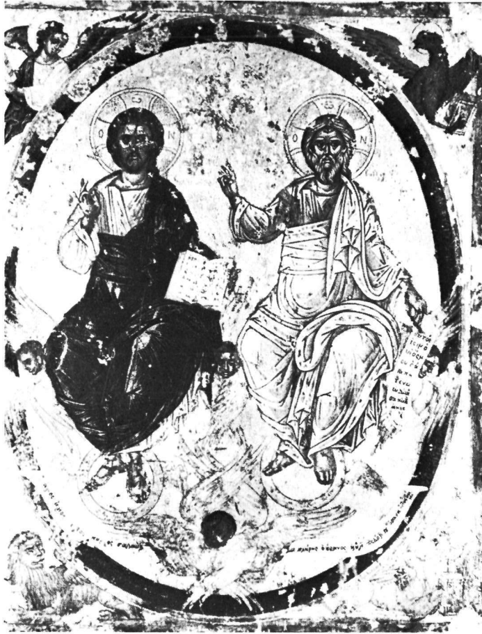
a. Ioannis Moscos, The «Epinikios Hymn,» 1702. Benaki Museum, Athens. b. The «Epinikios Hymn», end 17th century. Coll. Dr. S. Amberg-Herzog, Kölliken, Switzerland.