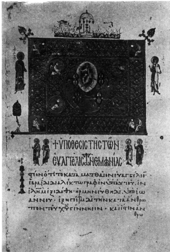
a. Detail of Pl. 11a. b. «Liturghical Theophany», cod. Parma, Pal. 5, fol. 5r.