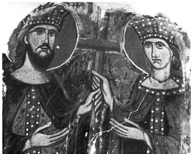
The chapel of the Archangel Michael, Vizakia, Cyprus. a. The Deposition. b. The Crucifixion, detail. c. Sts Peter and Paul. d. Sts Constantine and Helena.