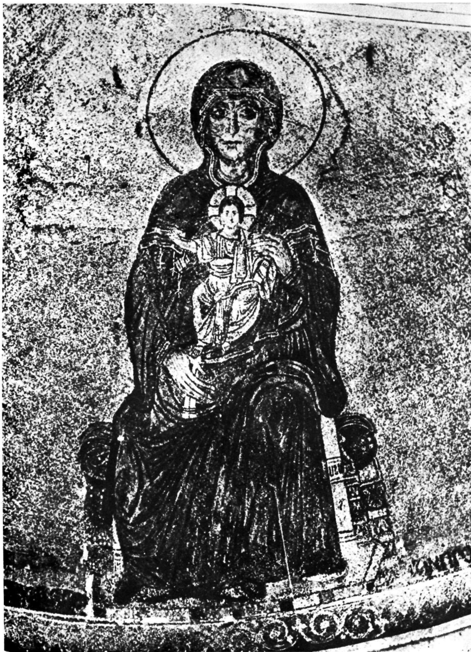
Apse of S. Sophia, Thessaloniki: photographed soon after 1912.