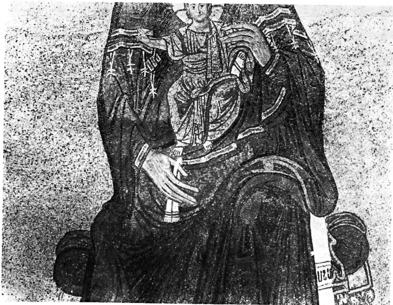
Virgin and Child, apse of S. Sophia, Thessaloniki; as in 1965.