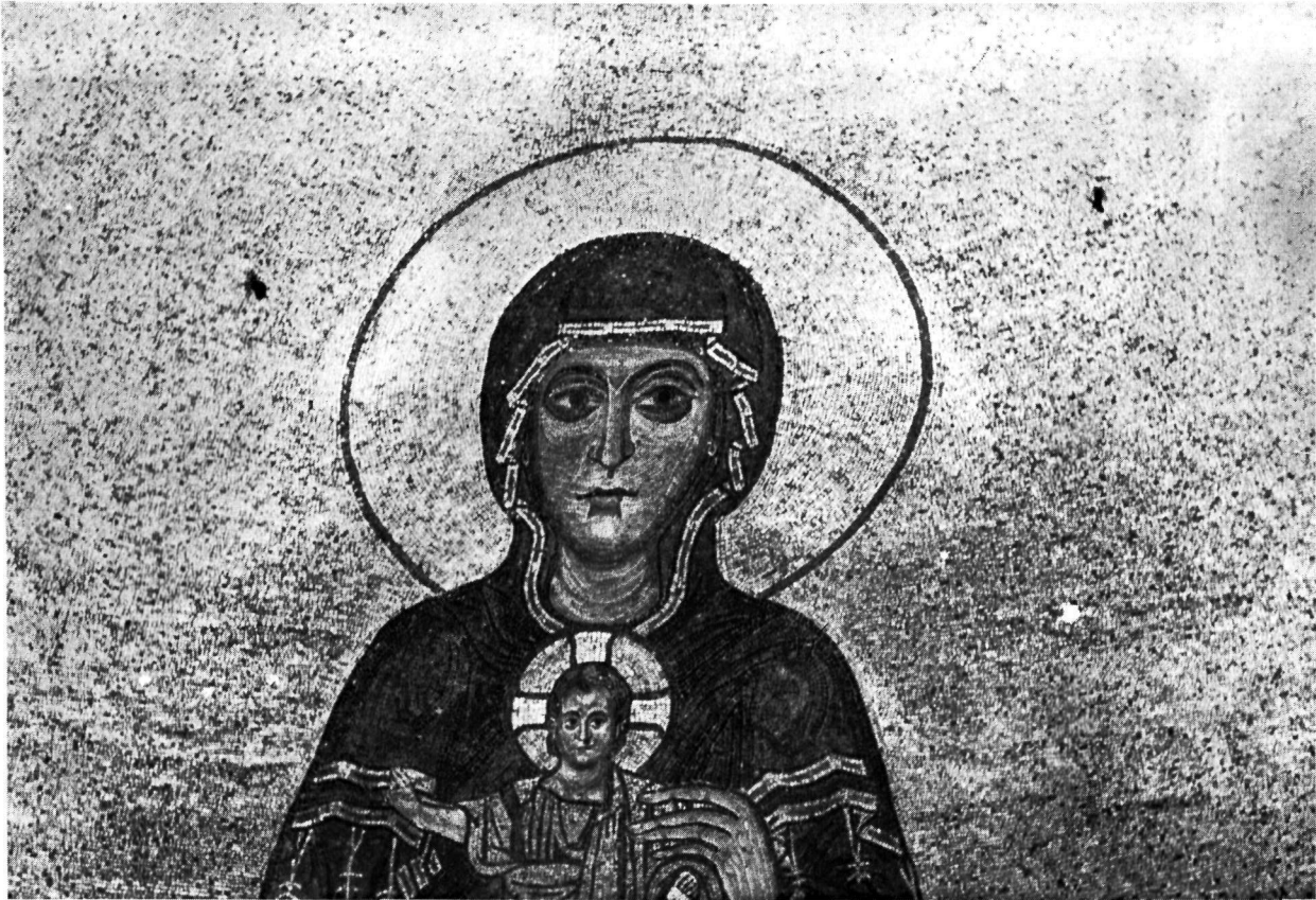
Virgin and Child, apse of S. Sophia, Thessaloniki; as in 1965.