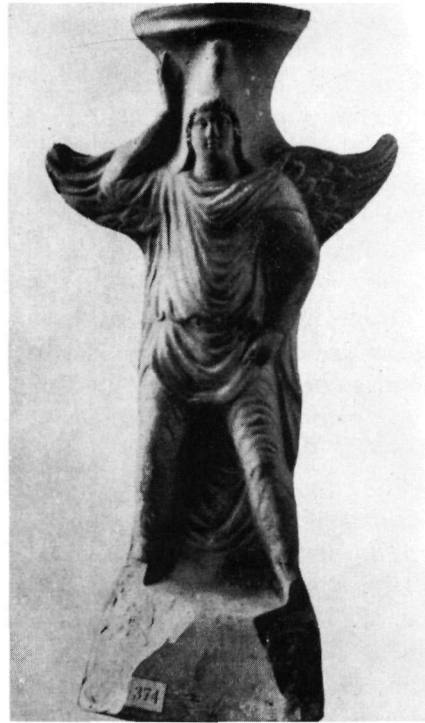
Fig. 11. Louvre, statuette of Attis.

doorstep of the capital, its foundation was ascribed to imperial initiative and it drew its clientèle among distinguished lawyers and physicians. How is it then that the Michaelion, with its supernatural manifestations and cures by incubation, was tolerated at the very time when the Church laid stress on condemning the worship of angels and the dedication of churches to them? Can it be true, after all, that the Michaelion had been founded by Constantine? A precise occasion comes naturally to mind: in September 324 Constantine, at the head of his troops, crossed the Bosphorus before defeating his rival Licinius at Chrysopolis 63 . In the course of this war he is said to have had several visions announcing his victory 64 . Or did he take to his credit the vision of an angel which Licinius had had a few years previously (313), prior to his victory over Maximinus Daia at Campus Ergenus, not far from Byzantium 65 ?