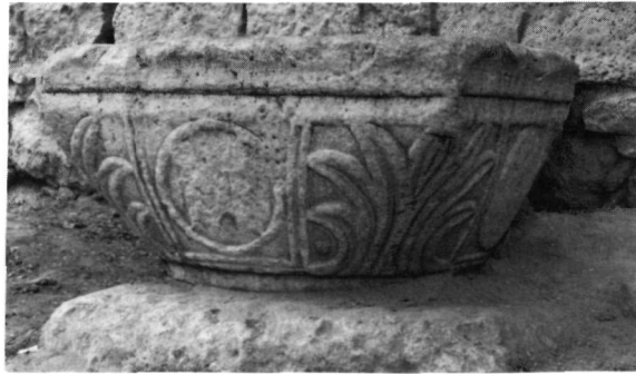
Fig. 9. Yürme, Justinianic capital in front of village mosque.

lous cures through the agency of a fishpool; for although, as we shall see, the Archangel had certain associations with water, he has never, to my knowledge, been linked with fish. The suspicion comes naturally to mind that he may have inherited an earlier, pagan cult. But whose? If we are to suggest any answers, we shall have to cast our net wider.