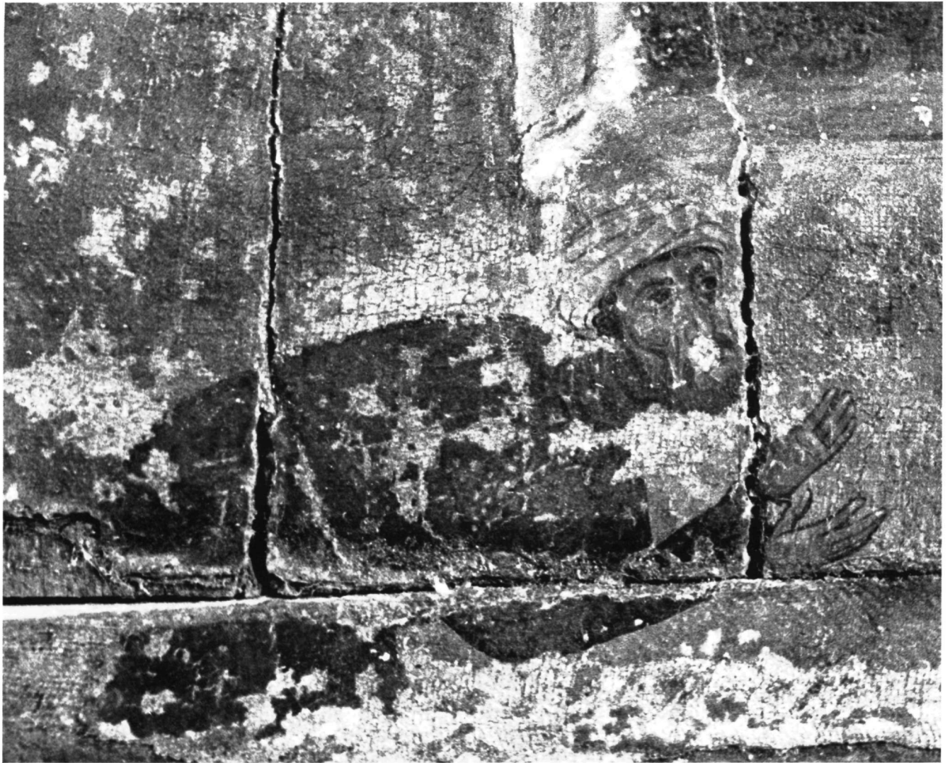
Fig. 8. Moses and the Burning Bush. Detail.

formed by the right foot of Moses, the lower hem of his himation, the left foot, and the hillside crowned by the cubist peaks counterbalances the diagonal thrust of Moses reaching for the tablets extended to him by the Hand of God in the companion panel (Fig. 2).