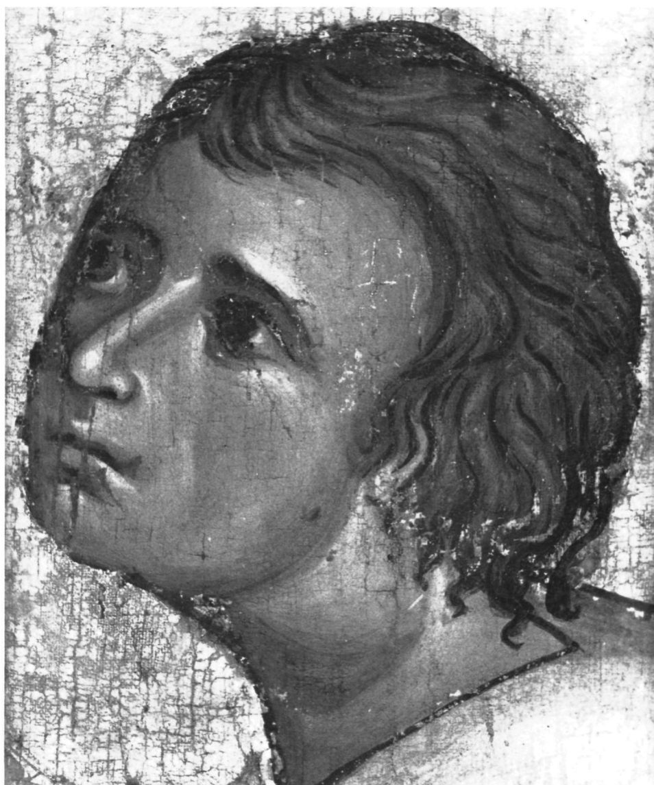
Fig. 4. Moses Receiving the Tablets of the Law. Detail.

folds of the white surfaces of Moses' himation are indicated by light blue, and its contour in the central area is enlivened by double white dots. Black is used occasionally to outline the drapery where it is necessary to distinguish the forms more clearly. The drapery adheres softly to the body enhancing its plasticity. Moses' face is modeled with ochre producing broad lighted areas, with white highlights at the bridge and the tip of the nose, above the upper lip, at the corners of the mouth, and also on the chin. Vivid red in various shapes is freely placed on the cheeks, the bridge and tip of the nose, the lips, on the contour of the chin, and also at the edges of the forehead. Olive shading is restricted mainly to the area around the eyes. Moreover, warm tonalities predominate in the modeling of the neck, of the arms,