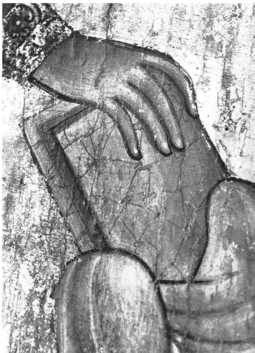
Fig. 5. Moses and the Burning Bush. Detail.