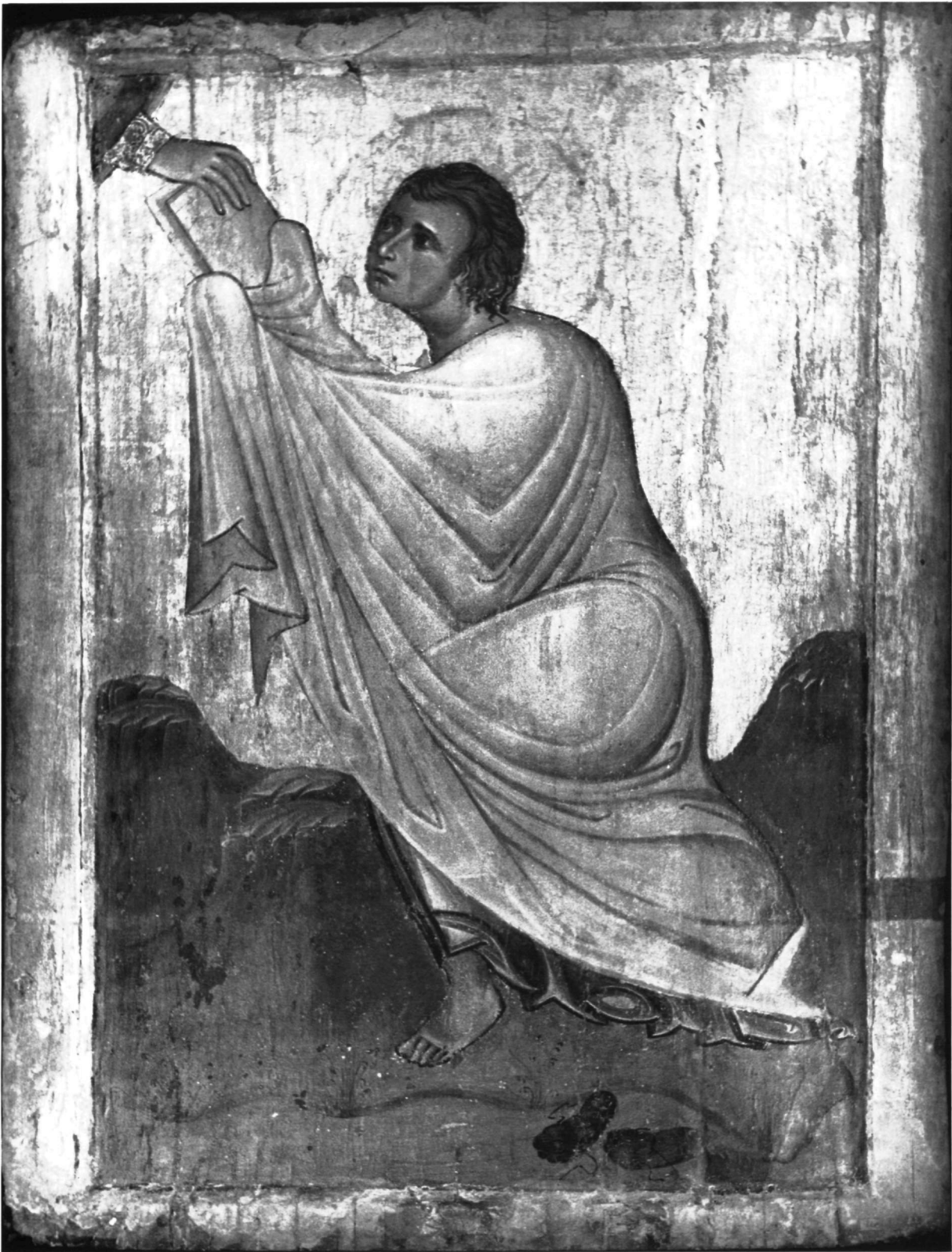
Fig. 2. Sinai. Monastery of St. Catherine. Icon. Moses Receiving the Tablets of the Law.