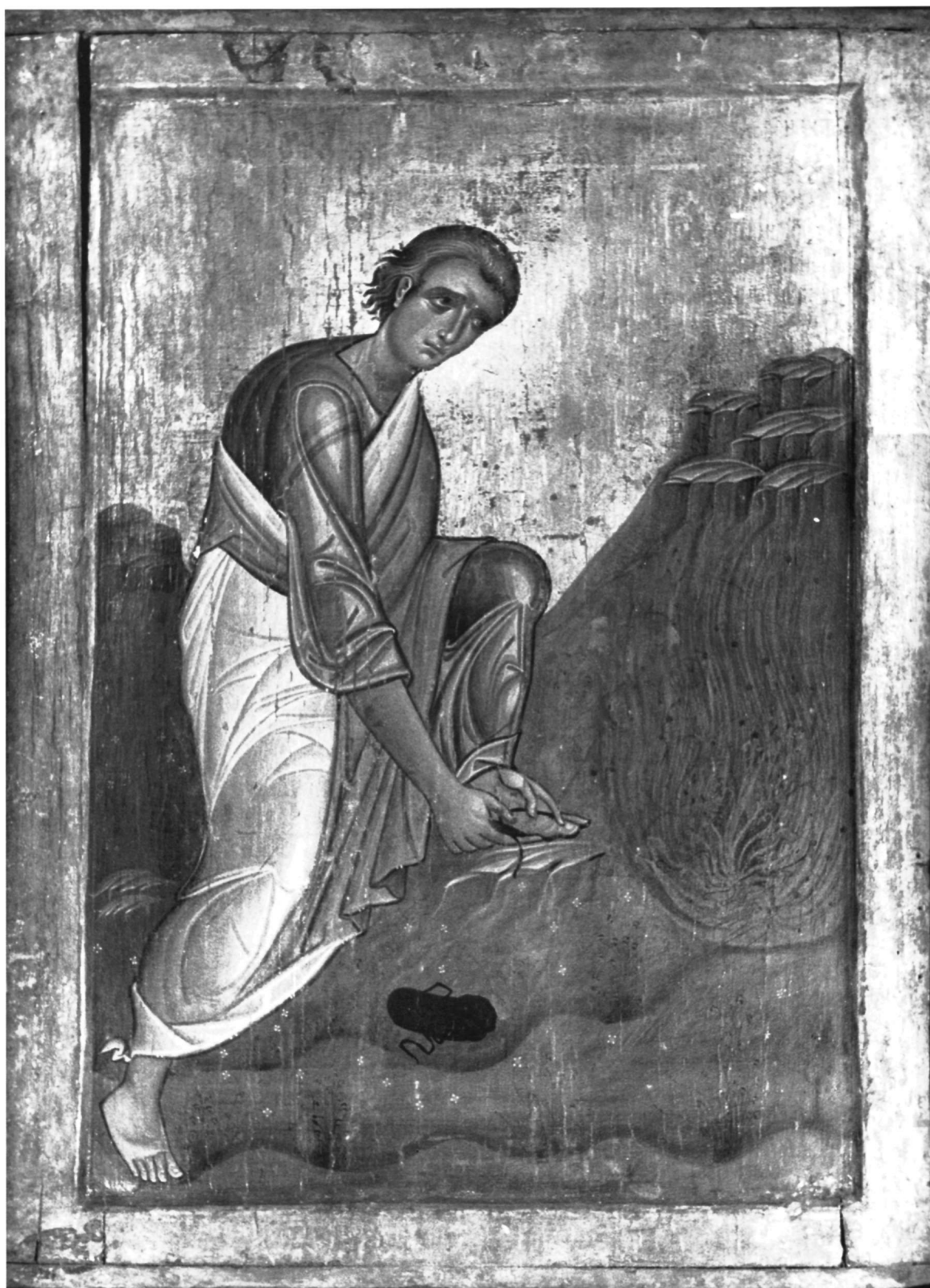
Fig. 1. Sinai. Monastery of St. Catherine. Icon. Moses and the Burning Bush.