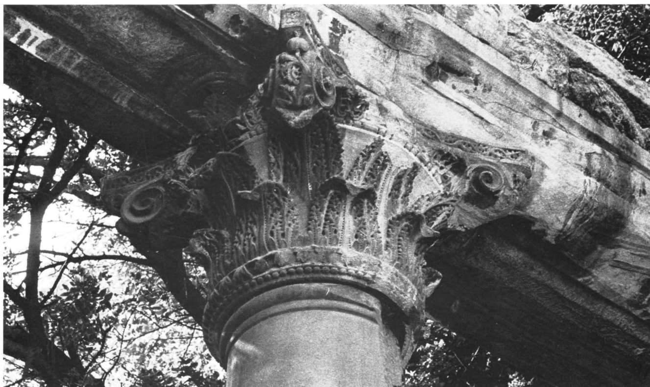
Fig. 13. Basilica of St. John Studios. Constantinople. Capital in the narthex. (Photo: author).

to congregate at food of this kind. If, therefore, irrational birds can sense where a small carcass lies by means of their natural senses when they are separated by such wide spaces of land and of sea, how much more should we and all the multitude of believers hurry to him whose radiance goes forth from the East and reaches to the West... We can understand [the word] corpus ... as the Passion of Christ to which we are summoned to congregate wherever it is read in the scripture and through it we can come to the word of God..." 64 .