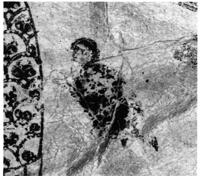
Fig. 5. Paris, Bibliothèque Nationale, Coislin 79, f. 2v. The Emperor Nicephorus III Botaneiates between John Chrysostom and the archangel Michael, and kneeling painter (?).