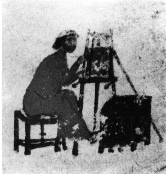
Fig. 3. Athos, Dionysiou 61, f. 35r. Marginal miniature of a painter.

Moreover, in accordance with medieval concepts about artisans is the idea of depicting a biblical rather than a contemporary painter at work. There are, therefore, rare representations of Saint Luke — who was later, in