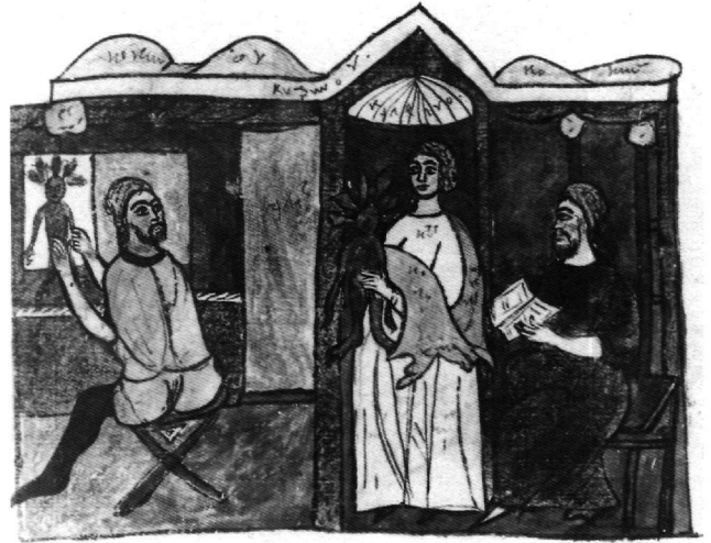
Fig. 10. Bologna, Biblioteca Universitaria, cod. 3632, f. 425v. Dioscorides, Sophia and the painter.

Of particular interest is the combination of the Renaissance-like concept of a figure bearing the painter's features included in a biblical scene, with the medieval idea of suppressing the name of the artist 57 , which, as mentioned above, was only added on the margin by the scribe. This approach may be understood in the spirit of a prominence of ancient principles 58 traceable also in the twelfth-century architecture 59 and monumental painting 60 of Byzantium. It may, furthermore, be considered as indicative of the social conditions of the late 12th century 61 when an emergence of the craftsmen from their anonymity has been observed 62 . A parallel phe-