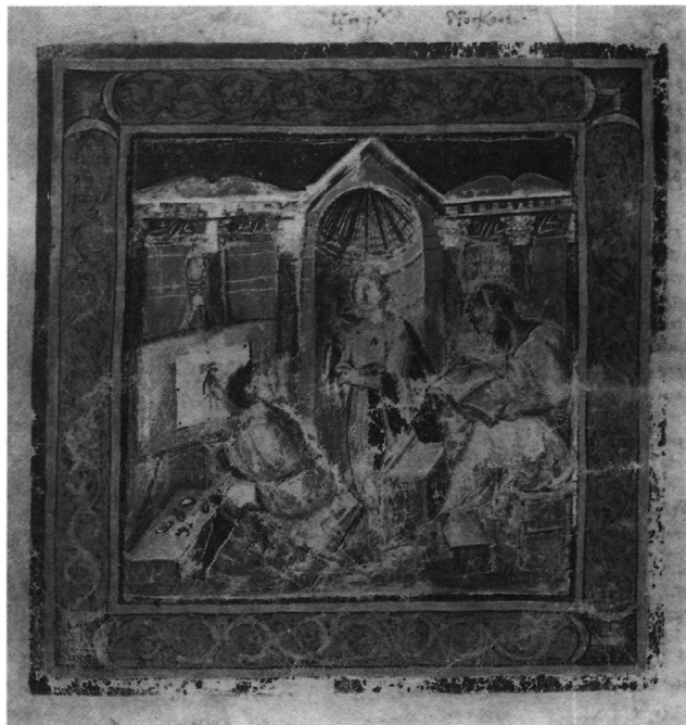
Fig. 1. Vienna, Österreichische Nationalbibliothek, Vindob. Med. gr. 1, f. 5v. Dioscorides, Epinoia and the painter.

The second painter's portrait is depicted on the margin of f. 35r of the Codex 61 of the Dionysiou Monastery on Mount Athos 13 (Fig. 3). The manuscript includes sixteen homilies of Gregory Nazianzenus which are read during