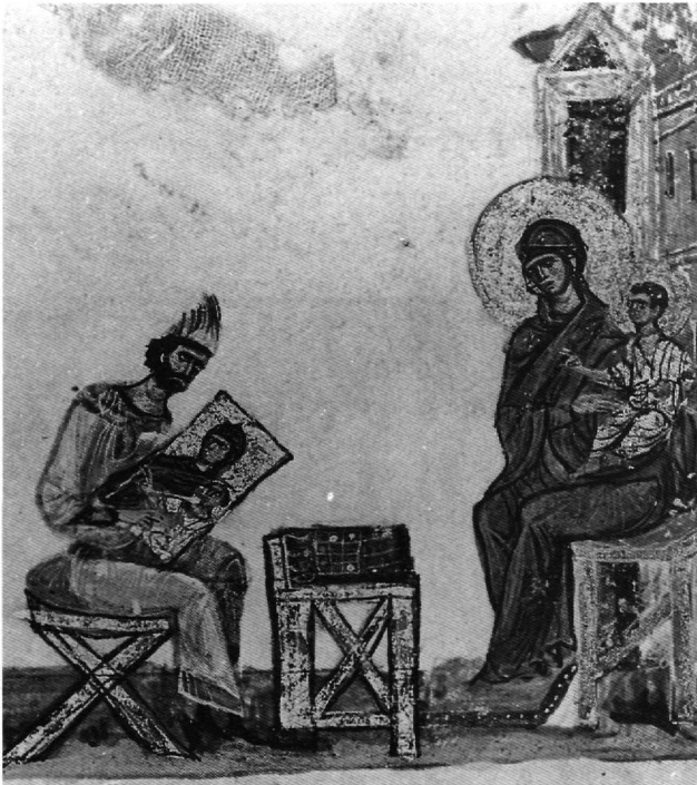
Fig. 4. Jerusalem, Greek Patriarchal Library, Taphou 14, f. 106v. Saint Luke painting the icon of the Virgin.

the 15th and 16th centuries, adopted by the guilds of painters, both in the East and in the West 17 , as their patron saint — showing him painting the Virgin. They are rendered with such accuracy, as for example on f. 106v of the codex Taphou 14 in the Greek Patriarchal Library of Jerusalem 18 (second half of the 11th century) (Fig. 4), that a good insight is offered into the methods of a medieval painter, the tools of his trade — easel, brushes, paint box, pigment shells — and his use of a model, an essential prerequisite in order to achieve a perfect likeness 19 .