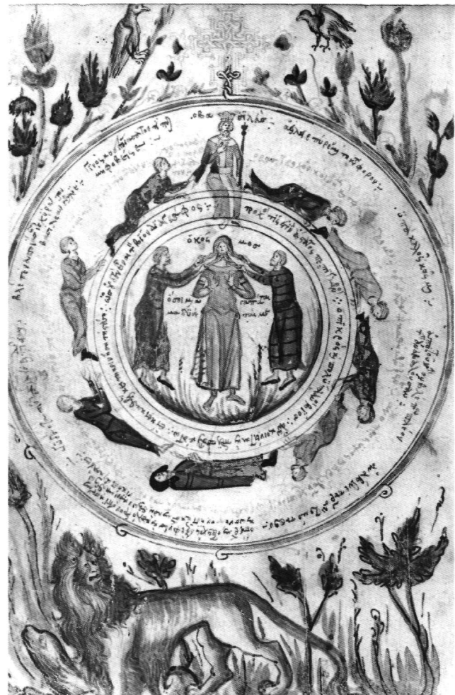
Fig. 11. Paris, Bibliothèque Nationale, Par. gr. 36, f. 163v. The painter-monk Nicodemus in the Wheel of Life.

65. A. K. Orlandos, Βυζαντινὰ μνημεῖα τῆς Ἀνδρού , ABME 8 (1955-56), p. 28. Laskarina Bouras, Architectural Sculptures of the Twelfth and the Early Thirteenth Centuries in Greece , ΔΧΑΕ Δ', Θ' (1977-79), p. 65. Myrtali Acheimastou-Potamianou,