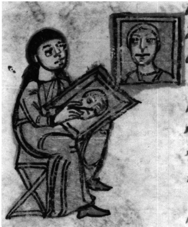
Fig. 2. Paris, Bibliothèque Nationale, Par. gr. 923, f. 328v. Marginal miniature of a painter.