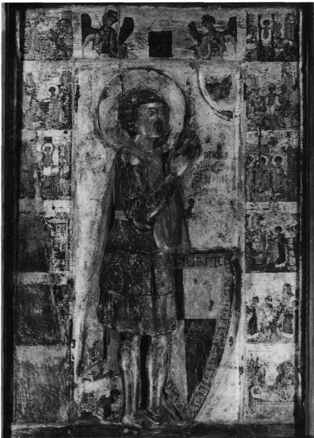
Fig. 4. Icon of Saint George with scenes from his life and a female donor. Athens, Byzantine Museum.