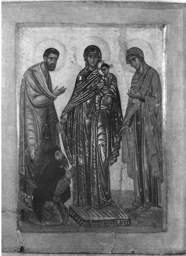
Fig. 6. Icon of the Virgin and her parents Joachim and Anna with a donor monk. Sinai, Monastery of Saint Catherine.

century mosaic of the Anastasis in that church 22 . But these people are only inserting their faces. For a patron to walk straight into the holy scene, dressed in her own clothes, is something quite different.