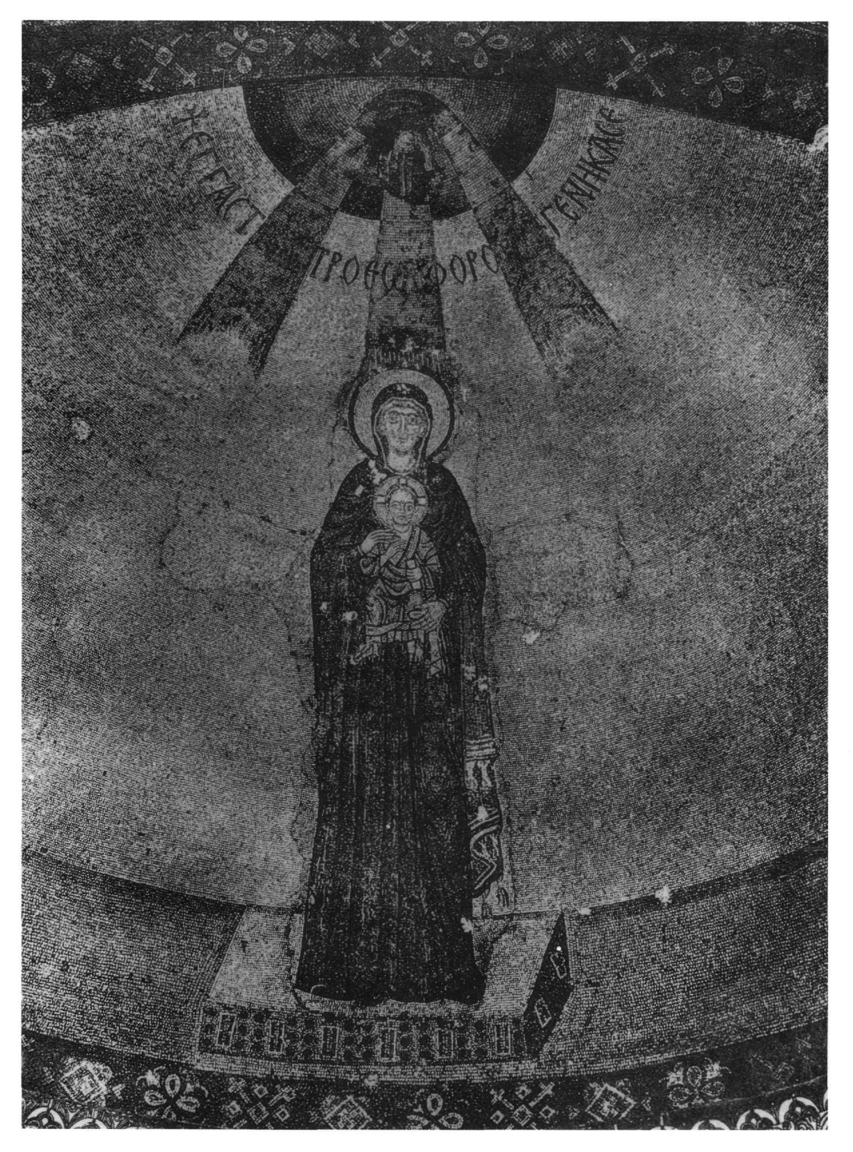
Fig. 2. Nicaea, Koimesis church. Apse mosaic.