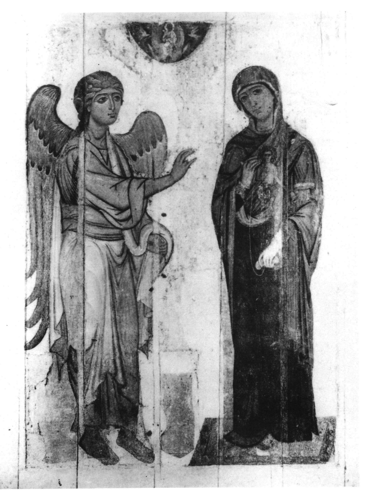
Fig. 1. Moscow, Tretjakov Gallery. Icon of Annunciation.