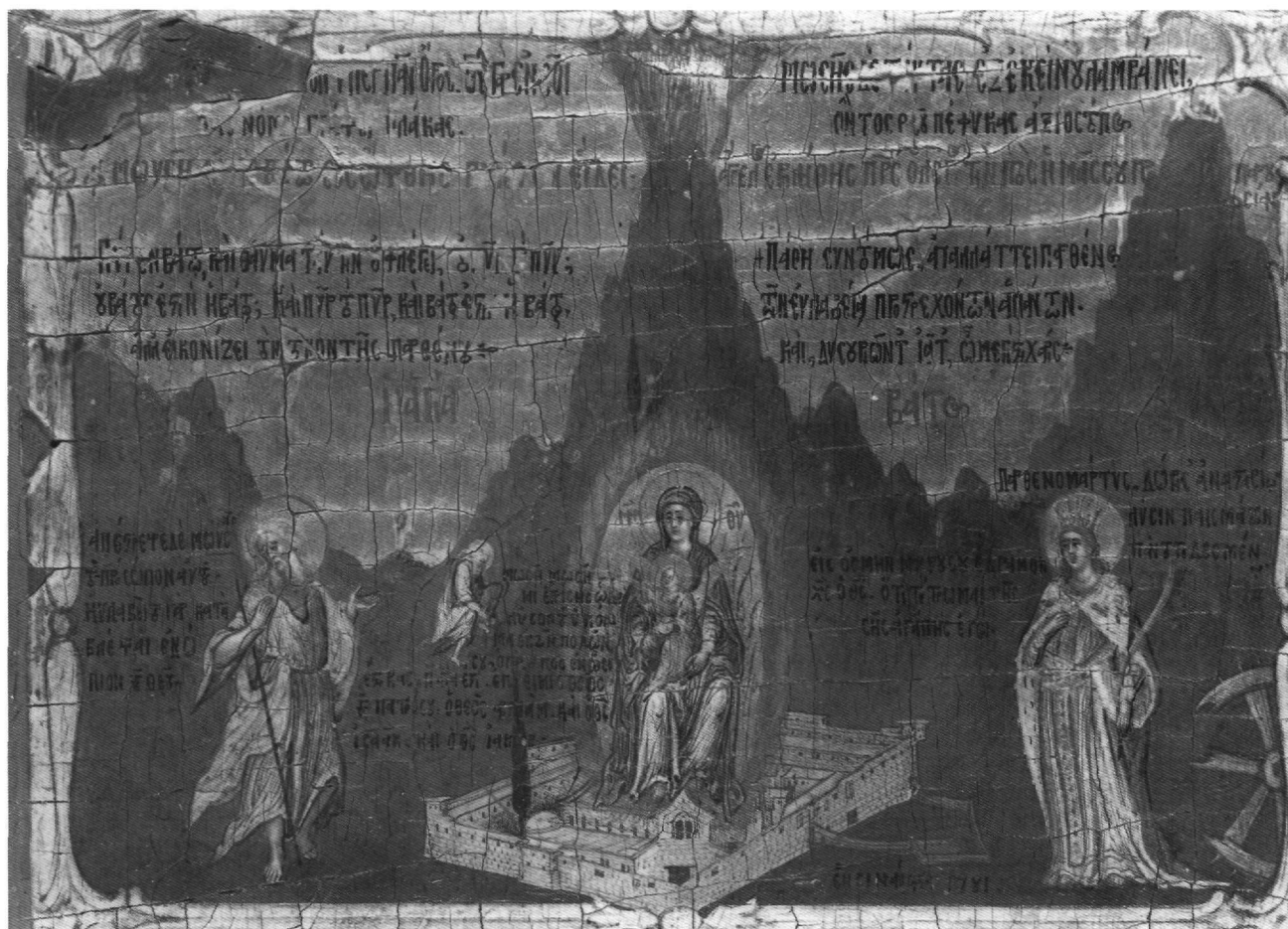
Fig. 1. Sinai. Monastery of St. Catherine. Fragment of an iconostasis beam with scenes from the Life of the Virgin.

rine occupies the central place 16 . In other eighteenth-century representations of Sinai her body is placed on the summit of a mountain 17 . On our icon there is simply her typical portrait. She is imperially dressed, carries a martyr's palm and is accompanied by the wheel of torture, which, according to legend, was broken by an angel 18 .