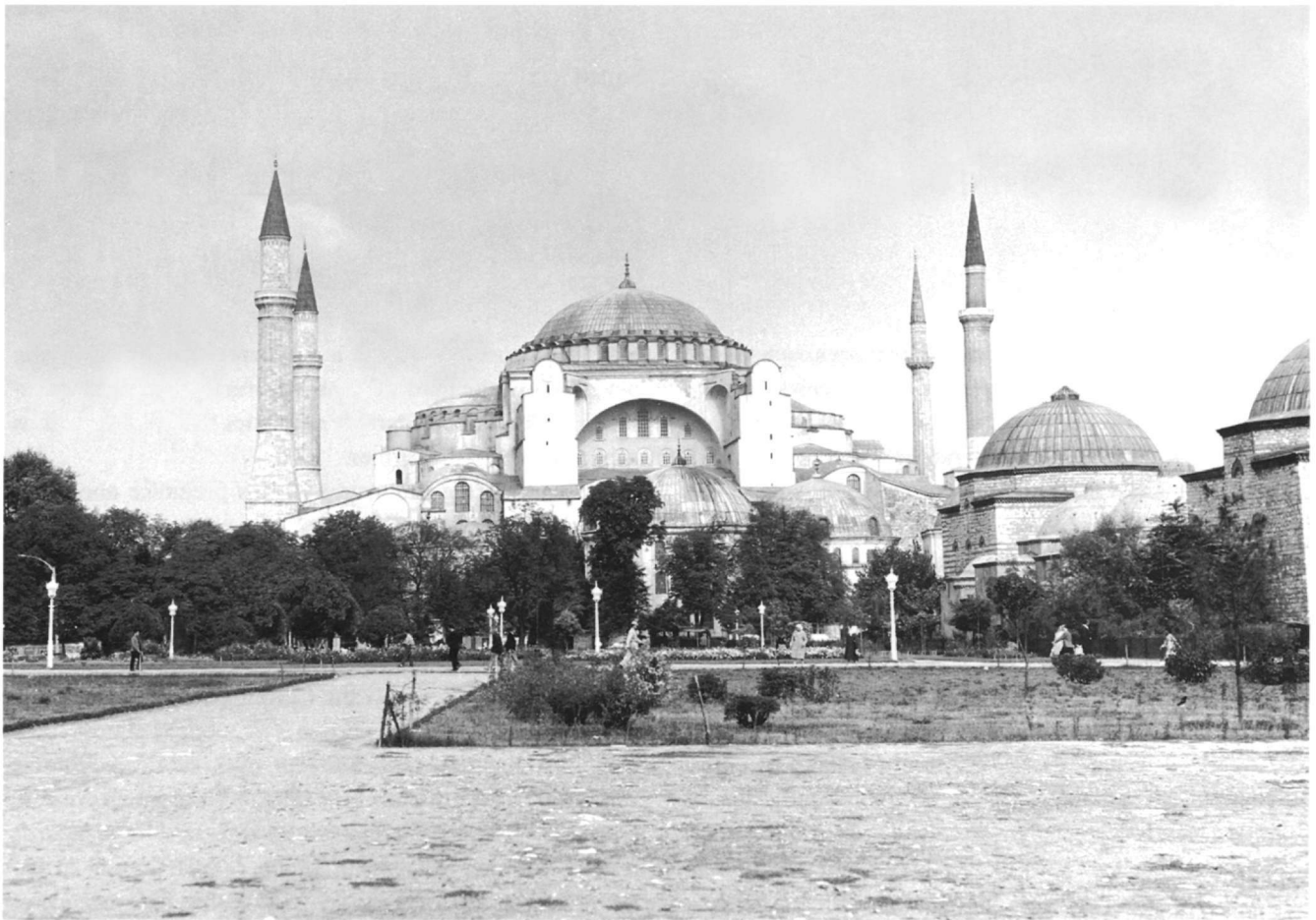
Fig. 1. Constantinople, St. Sophia. From the southwest.

riods correspond to three time spans during which crucial changes took place in Byzantine architecture as a whole, changes in attributes of style are discernible over much smaller time spans. The three periods took place. Let us consider each of these periods briefly.