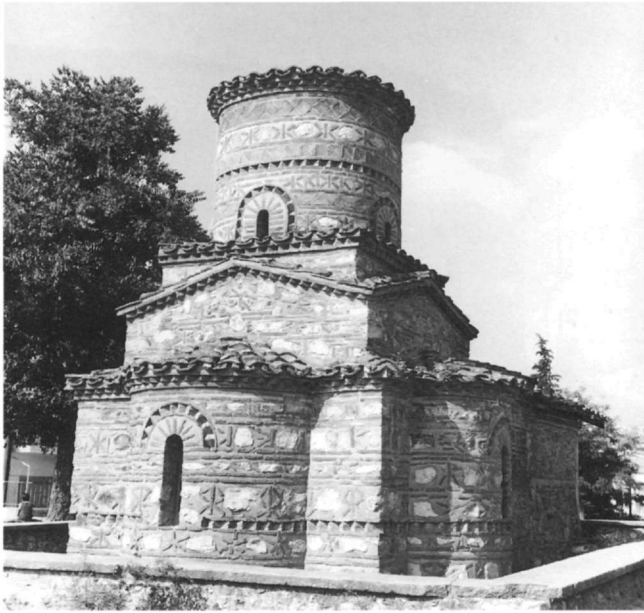
Fig. 3. Kastoria, Panagia Kubelidike. From the northeast.

became even clearer during this period, because the concept of space was further complicated and elaborated by compressing the original form of a basilica. The method of construction makes it easy to recognize the influence of Constantinople and the Constantinopolitan workshops as well as contemporary developments in the Aegean and Ionian areas (Fig. 2).