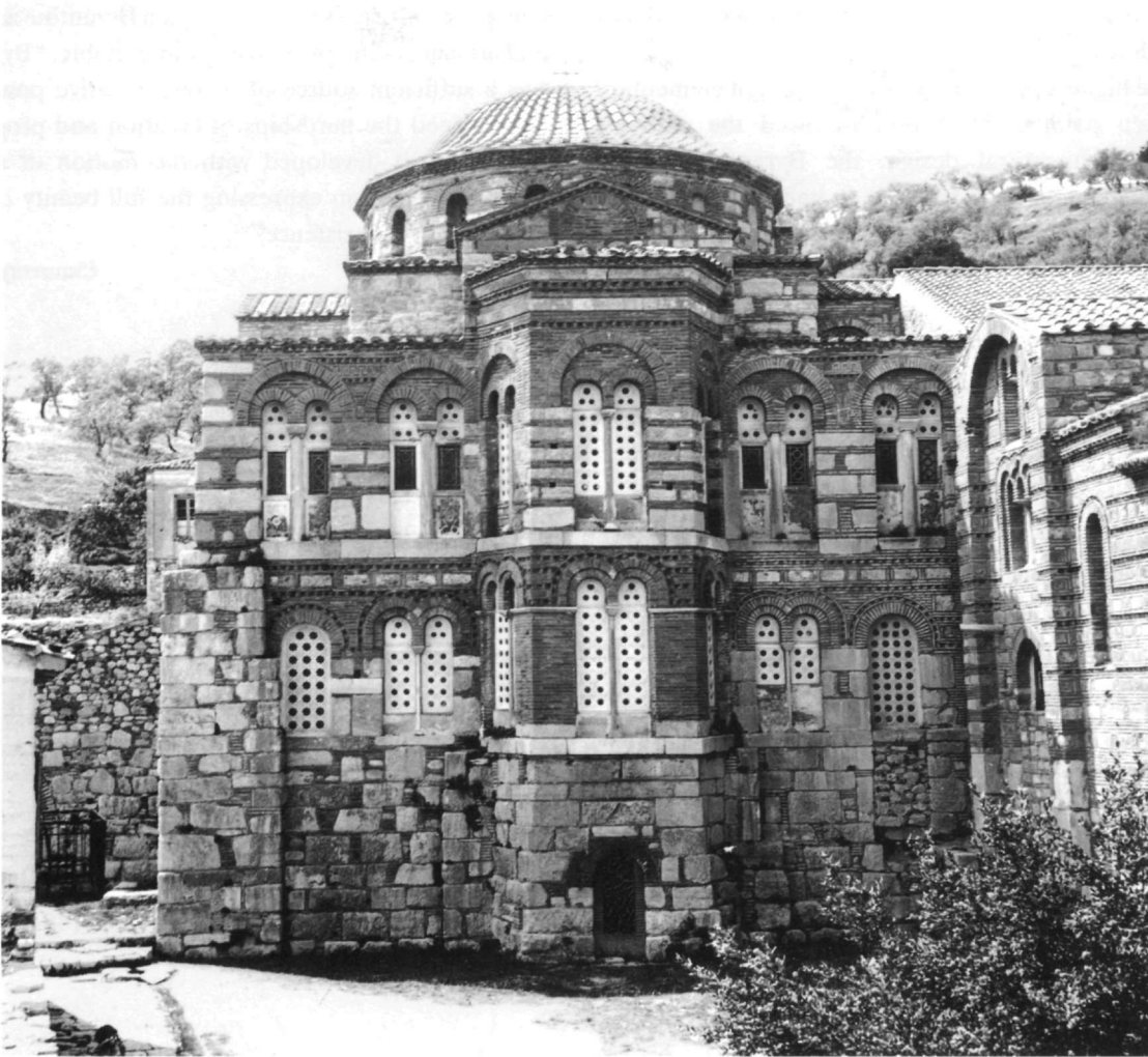
Fig. 5. Hosios Lukas, katholikon. From the east.

of this period was the further development of the structure. The church of Hosios Loukas at Stiris in Greece (Fig. 5) is a typical example of the system which emerged in this period as the logical conclusion of developments in the church's upper construction. In this respect the architecture of Constantinople was ahead of Gothic architecture 9 .