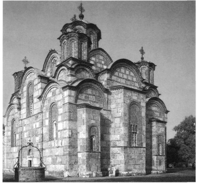
Fig. 4. The katholikon of the monastery of Gračanica. From the southeast.

While the basic spatial design of the church remained unchanged, new solutions emerged by adding annexes that were used for special purposes. This development was mo-