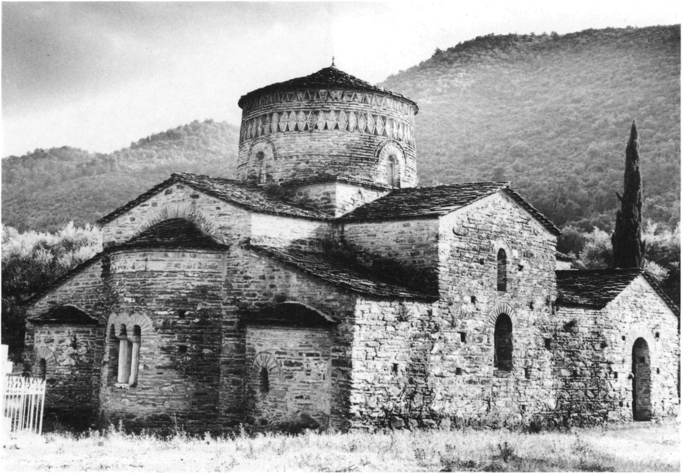
Fig. 2. Gavrolimni, Panagia Panaxiotissa. From the northeast.

element of the representation as a whole. Just as the architecture is meaningless without the inside walls being painted according to an established iconographic program, the frescoes and mosaics cannot be fully interpreted in isolation from the architectural design. This principle was observed throughout Byzantine architecture until its end. In some instances it was put into practice more broadly, in some it was realized in more complex and finely wrought compositions, and in yet others it was discernible in the details that reflected the specific requirements of the program.