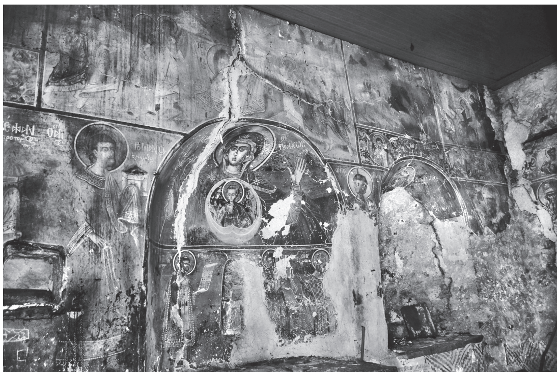
Fig. 2. Theotokos Vlachernitissa, holy Bema. Prophet Elijah, Paidonia, Ioannina.

Internally, the church is full of frescoes. However the dedicatory inscription is, unfortunately, missing. The only inscriptional evidence we have can be found in the votive inscription, where we read about, among other names: αναστάσιος ιερέως Ιωαν(νου) 12 .