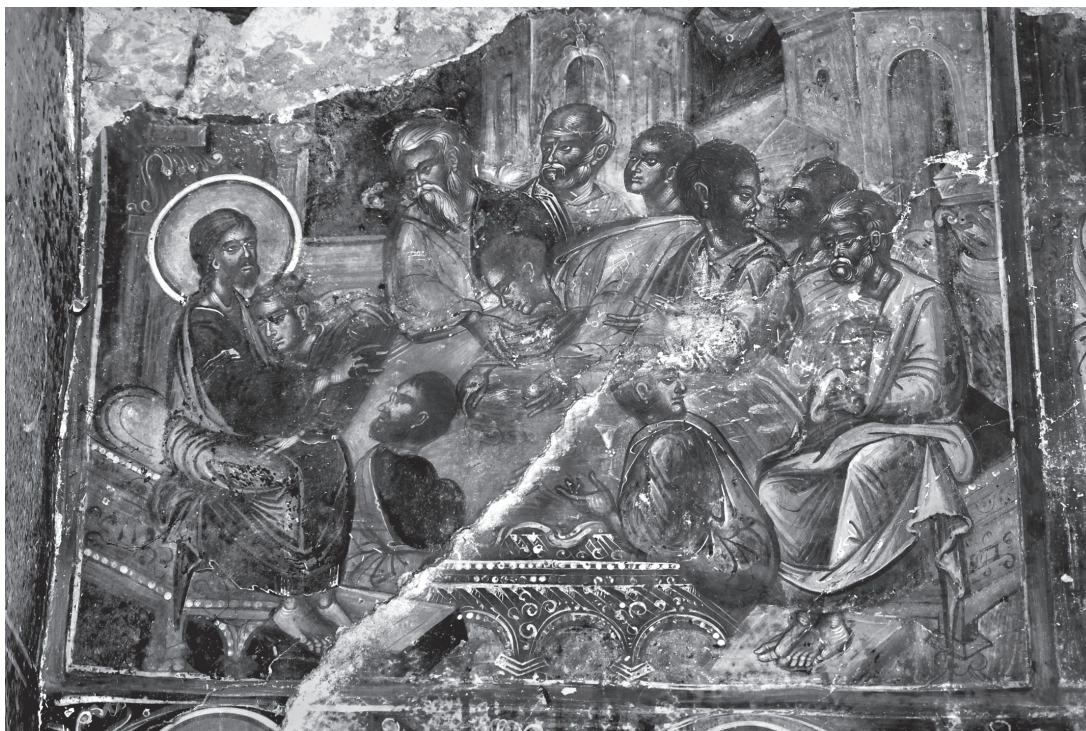
Fig. 7. Last Supper, Prophet Elijah, Paidonia, Ioannina.

Kapesovites 55 : the main characters are depicted with the correct proportions, however the secondary figures present certain shortcomings, such as the absence of necks on their bodies 56 . Normally the figures are presented en face with their weight distributed evenly between their legs, and in other cases they are depicted contra-posto with the relaxed, static limb, while an even rarer case is their depiction semi en face. The intensity of their movements is depicted awkwardly, with their bodies rigid and in unnatural positions 57 . The unsteadiness of a figure in motion is often due to the alteration of the iconographical type, such as with the soldier who has placed Christ under arrest in the