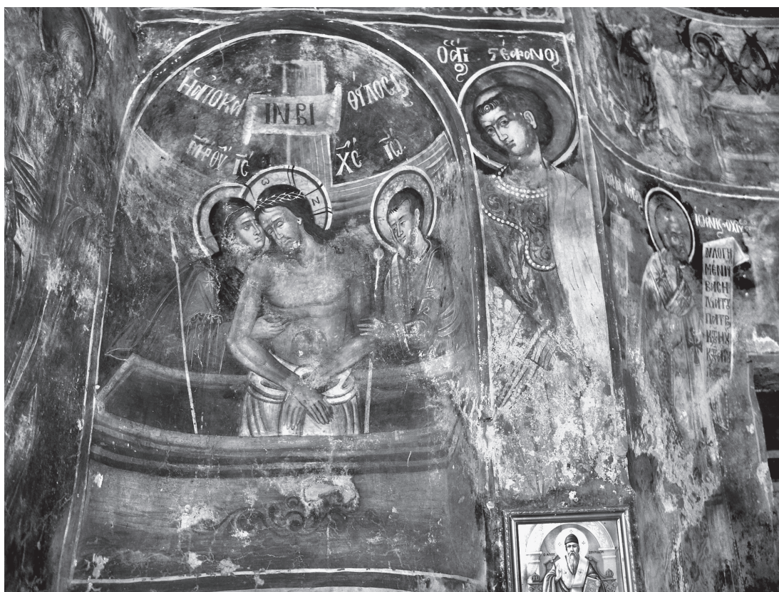
Fig. 5. Extreme Humility, saint Stefanos. Holy Altar, Taxiarchs, Kato Soudena, Zagori.

Also, there are notable similarities between the physiognomic types in the church of the Prophet Elijah and the signed works of the painter: Saint Stefanos in the Taxiarchs and in the church we are examining, the only variation is the different angle at which the head is aligned (Figs 6, 7). The similar depiction of the full-length saints in the Taxiarchs and the Prophet Elijah led to the identification of the otherwise unidentifiable figure outside of the Bema as the homonymous prophet 46 . We can also see the same iconographical type in the medallions of the saints: Sebastian and Larianos (Fig. 3) in the church of the prophet Elijah are similar to Boniface in the Koimesis or