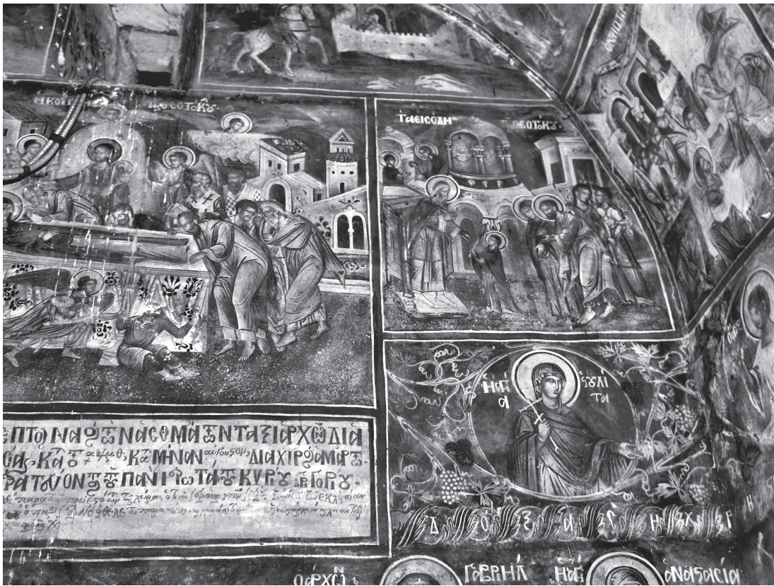
Fig. 4. The Presentation of the Theotokos. Taxiarchs, Kato Soudena, Zagori.

see Christ standing with his hands bound, while a Roman soldier holds him 41 .