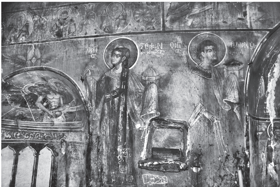
Fig. 6. Extreme Humility, saints Stefanos and Romanos. Holy Altar, Prophet Elijah, Paidonia, Ioannina.

lar 49 . The space in some cases complements the scene by encircling the figures 50 and in other cases has an organic relationship with them, alluding to the place where the events unfold 51 . The western influence on the buildings in the scenes depicting the Passion is also noteworthy: structures with pseudo-renaissance façades, fully decorated capitals and lintels with rich sculpted decorations 52 . Their figure, but also their style is evidence of the influence of western Baroque, which spreads to Eastern Europe