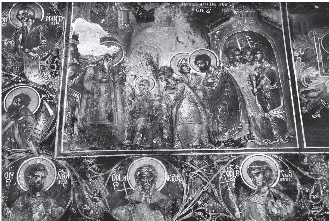
Fig. 3. The Presentation of the Theotokos. Prophet Elijah, Paidonia, Ioannina.

eschatological and salvatory character. In the conch of the diaconicon 20 there is a depiction of Ignatius, bishop of Antioch, «θηρώις γενέσθαι βορά» 21 . The inclusion of his martyrdom, being torn apart by lions, in the iconography of the Bema is undoubtedly because of its soteriological content 22 . On either side of the Ascension, we can see