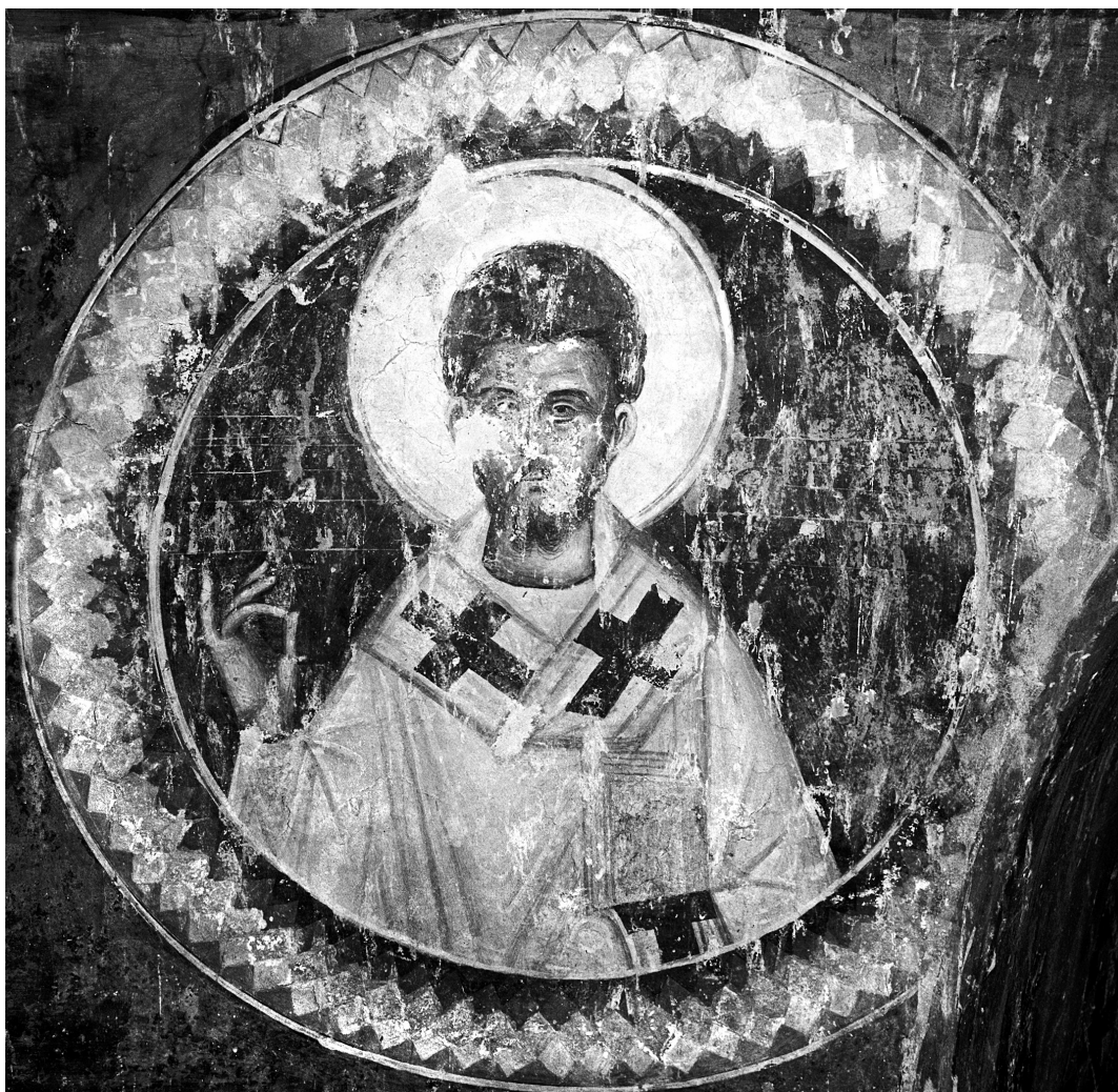
Fig. 1. Resava. St. Titus of Gortyna, 1415-1418.

on the arches in the naos; some occur twice or mixed with other bishops. 34 The rule they followed, however, was to add the title of bishop to the names of those in the sanctuary, while all those in the naos were enclosed in medallions and designated only by name. 35