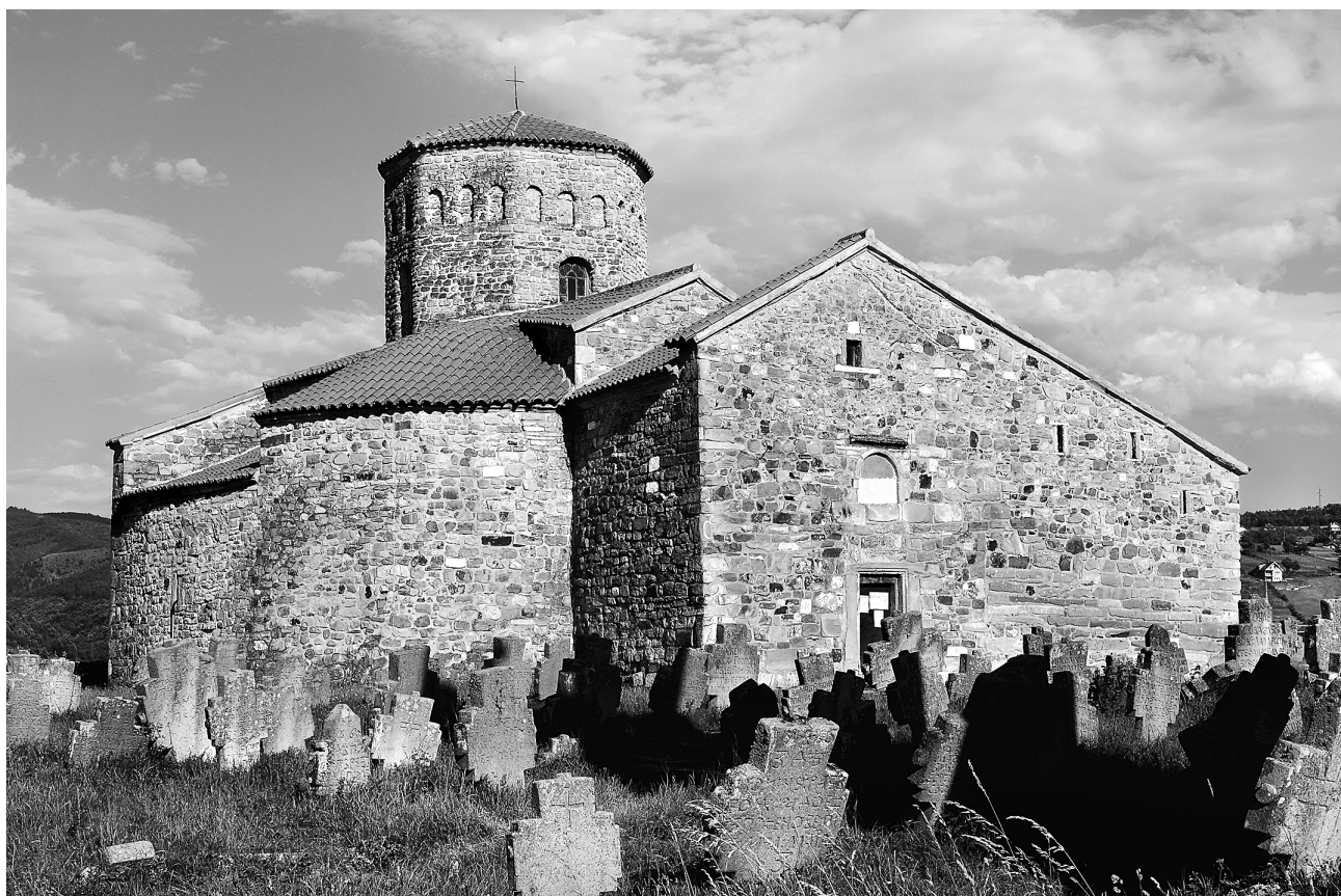
Fig. 4. Ras, the church of Sts Peter and Paul, 9th-10th century.

His earliest surviving portrait, in the monastery of Resava, belongs to the saint's usual type within the group of the Seventy Apostles and is designated, as all the others, by the name of his ecclesiastical seat in Crete. However, the placement of his portrait and that of St. Stachys of Constantinople in the middle of the apse suggests that, to those who commissioned the frescoes, St. Titus might have been more important than the others. A few years later, at Kalenić, he was set apart from the other apostles, who were shown bust-length, and he was given a prominent place next to the apse and a formal appearance. The identifying inscription omits the reference to Cretan Gortyna, and his counterpart becomes St. Eleutherius, bishop of Illyricum. Finally, St. Titus' portrait in Morača was moved down to the first fresco register and accorded a place of honour next to the ktetor scene. Titus is shown as a bishop, but the inscription accords him the title of apostle, unlike anywhere else either before or after, except for Crete,