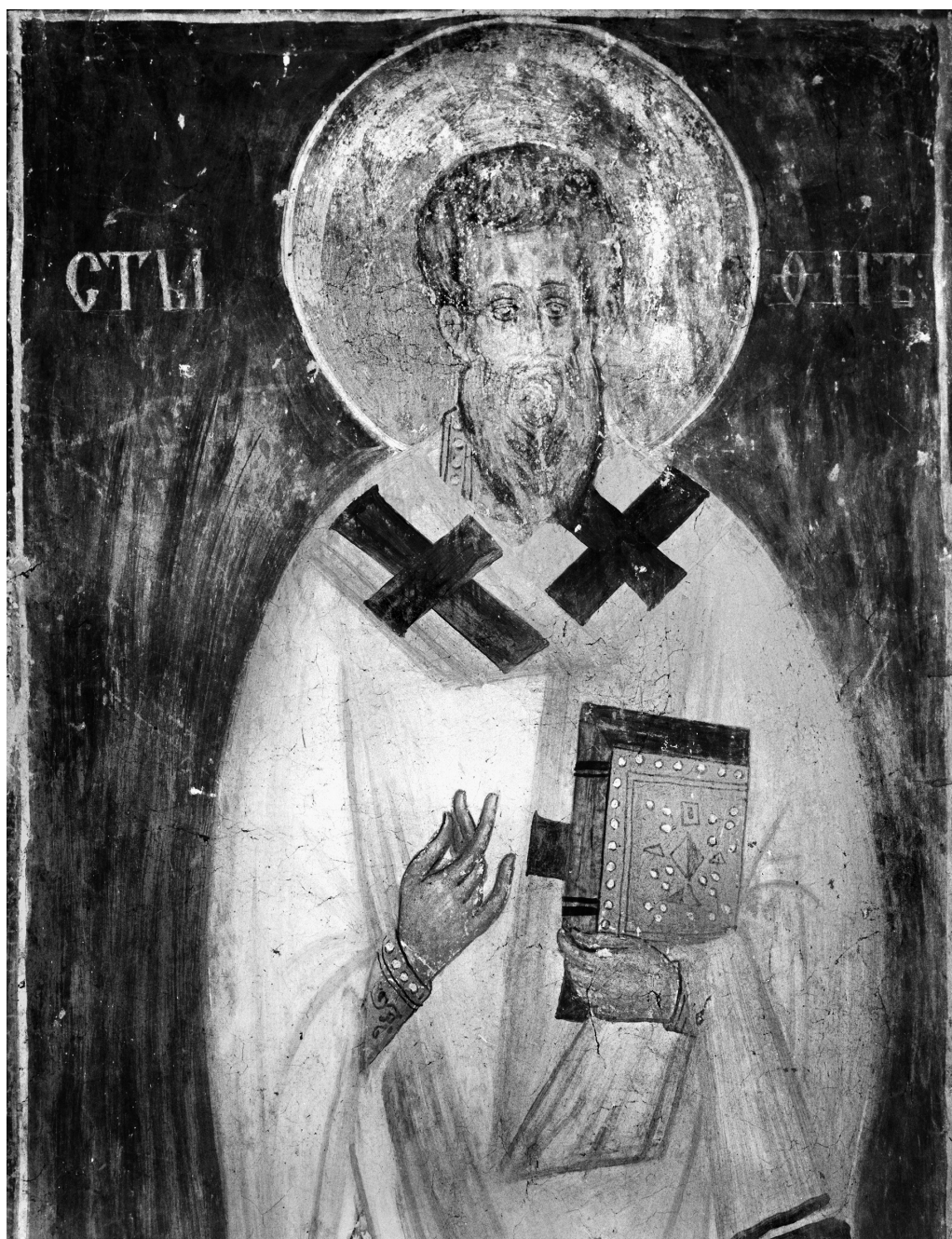
Fig. 2. Kalenić. St. Titus, ca. 1420.

Vučetić, for whom the Virgin intercedes with Christ enthroned (Fig. 3). In the southern transept, not far from St. Titus, are the twelve apostles, probably modelled after the 13th-century frescoes. They hold gospel books and are