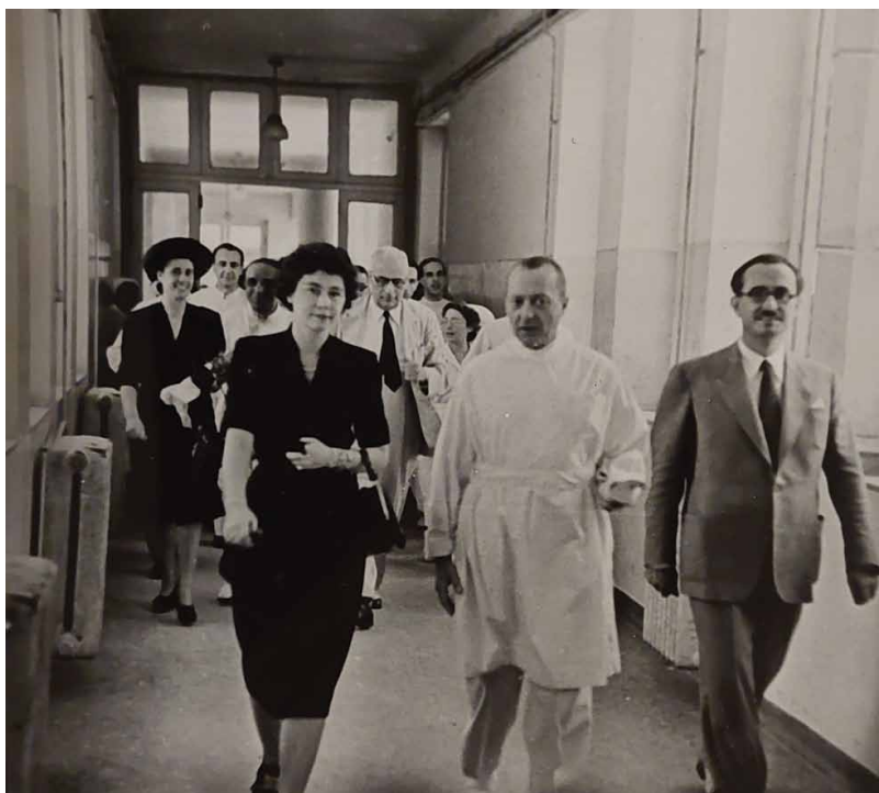
Figure 3. Queen Frederika's visit to Alexandra Maternity Hospital, 1954.