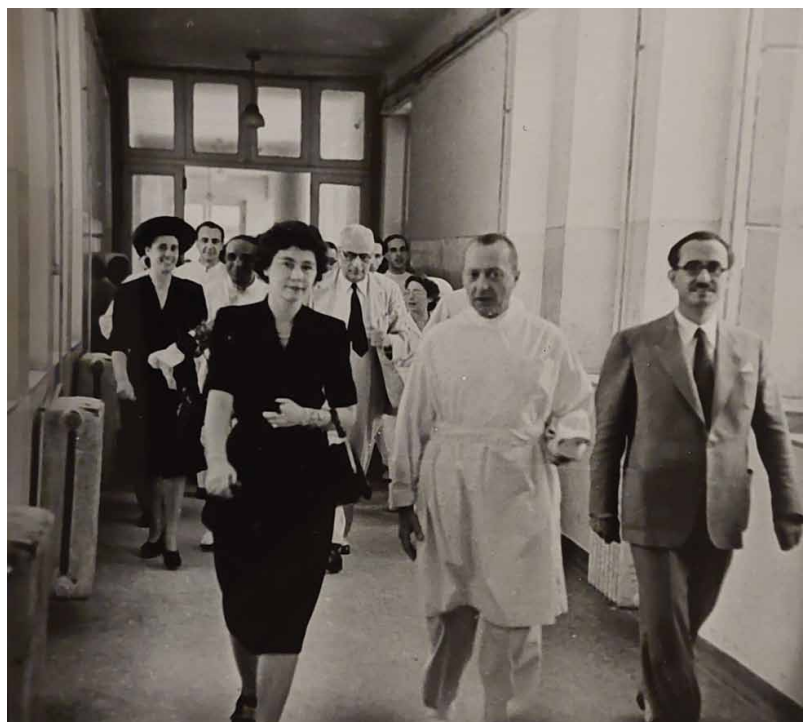
Figure 3. Queen Frederika's visit to Alexandra Maternity Hospital, 1954.