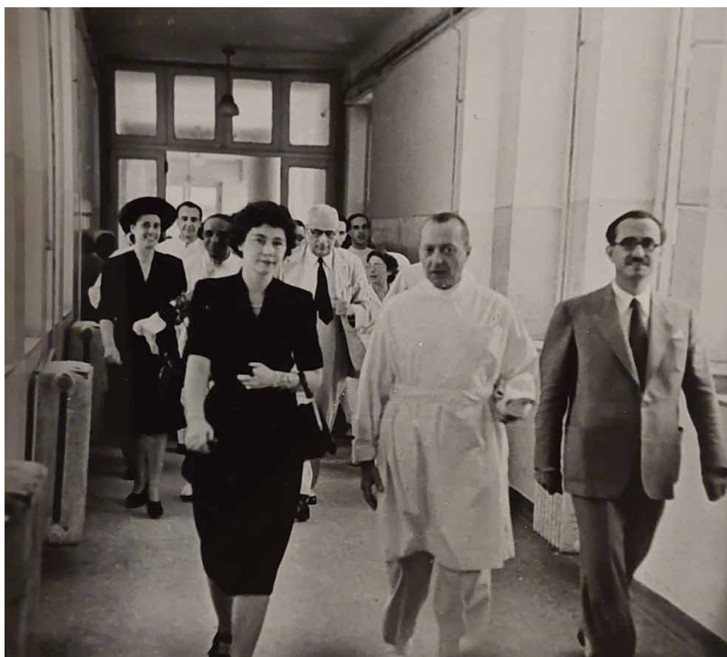
Figure 3. Queen Frederika's visit to Alexandra Maternity Hospital, 1954.