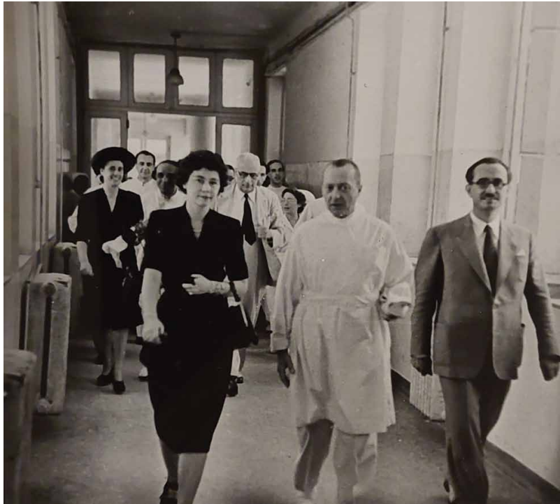
Figure 3. Queen Frederika's visit to Alexandra Maternity Hospital, 1954. Louros personal papers.