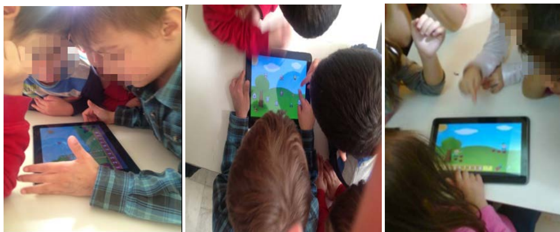
Figure 2 Illustrations of children activities with tablets

activities familiar to them, such as visiting a grocery store or a museum. Particular attention was given to the numbers used in order to reflect reality (tickets, commodity prices, money). Figure 2 illustrates some of children's activities with tablets.