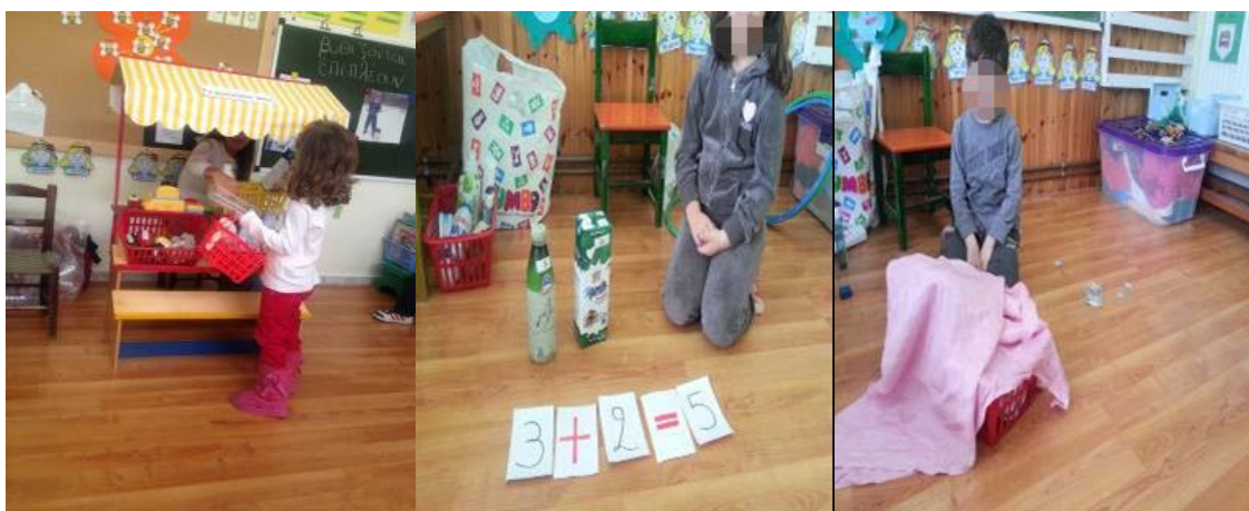
Figure 1 Illustrations from the activities of children

following the teaching plan drawn up by the teacher at the beginning of the school year. The objective of mathematical education in modern Greek kindergarten is to develop a way of thinking that exploits the features of mathematics. Preschool teachers shape the daily schedule of their teaching activities by combining knowledge from other school subjects taught in the preschool curriculum (Koustourakis, Zacharos, & Papadimitriou, 2013). It is intended that children begin to think in mathematical ways, realizing the value of using mathematics in real life (Kafousi & Skoumpourdi, 2008; Tzekaki, 2007) (Figure 1). Through daily actions and their interaction with the environment, children gradually explore all five axes whose trajectories are developed in the program of mathematics namely numbers and operations, space and geometry, measurements, stochastic mathematics and introduction to algebraic thinking (Zacharos, 2007).