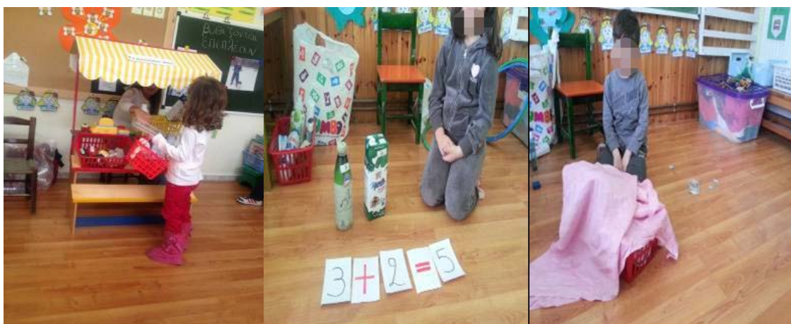
Figure 1 Illustrations from the activities of children

following the teaching plan drawn up by the teacher at the beginning of the school year. The objective of mathematical education in modern Greek kindergarten is to develop a way of thinking that exploits the features of mathematics. Preschool teachers shape the daily schedule of their teaching activities by combining knowledge from other school subjects taught in the preschool curriculum (Koustourakis, Zacharos, & Papadimitriou, 2013). It is intended that children begin to think in mathematical ways, realizing the value of using mathematics in real life (Kafousi & Skoumpourdi, 2008; Tzekaki, 2007) (Figure 1). Through daily actions and their interaction with the environment, children gradually explore all five axes whose trajectories are developed in the program of mathematics namely numbers and operations, space and geometry, measurements, stochastic mathematics and introduction to algebraic thinking (Zacharos, 2007).