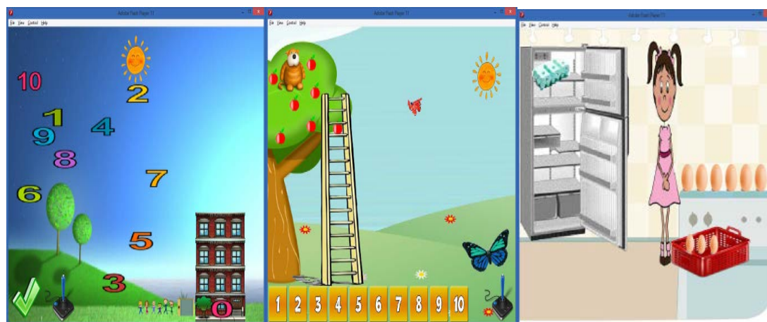
Figure 3 Illustrations of digital applications

The structure, plot, and script of the activities were similar for both types of digital applications. Respectively, icons, colours, props, sounds and other multimedia elements that were used to create mobile applications were identical to the corresponding applications on computers. The only difference between them was the different programming environment selected to implement them and the medium. With regard to the pedagogical dimension, the digital applications belonged to the category of "drill and practice" games with closed-ended questions. The applications were easy to handle and did not require the presence of an adult. Figure 3 illustrates some of the digital applications used in the intervention.