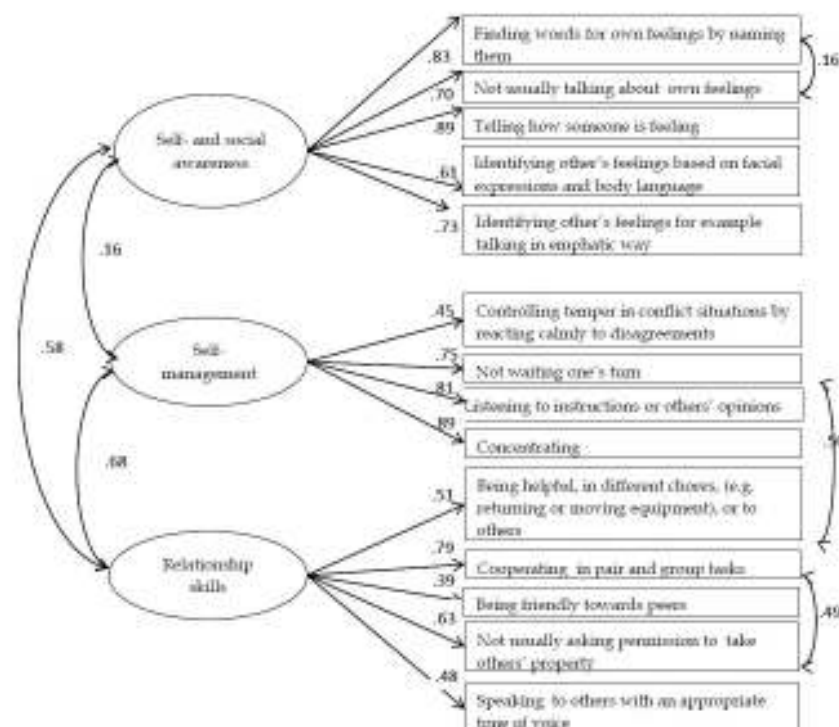
Figure 2 Measurement model of the hypothesized three-factor structure of the socioemotional skills observation scale

Paired samples t-tests revealed no differences in teacher-rated socioemotional skills between general kindergarten settings and the PE session. Independent samples t-test