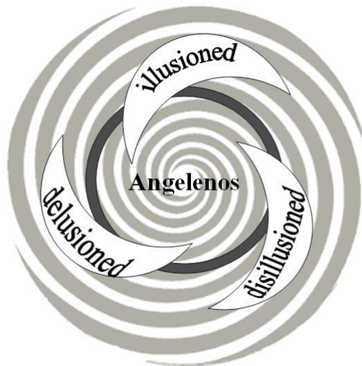
Fig. 3 The Angelenos Trialectics

Through Thirdspace, the two trialectics designed by Soja cannot be taken separately. With this ontological shift, he is importing into the spatial discourse the missing components that made modern geographical analysis fall short. He deems them too restrictive and somewhat dehumanized, but in doing so, he also complicates the nature and scope of their interactions drastically. This construction in threes, however, opens some analytical possibilities, providing an intellectual dynamic that can be applied to any space in the world. Couldn't we then continue Soja's trialectical model and think of other trialectics based on the inhabitants and their relationship to a space that is not like any other, because it is, first and foremost, theirs? The notion of belonging, of being accustomed to a particular space does give an expertise quality to those who embrace it everyday. Furthermore, the historical construction of a place and how memory is perceptible in it also inform how the lived space is conceived for those who are actually living in it. Imagining a trialectics dealing with Los Angeles and its inhabitants could be seen as the convergence of Soja's trialectics with Baudrillard's postmodern take on the megalopolis as the city of illusion and simulacra: