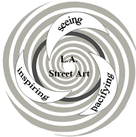
Fig. 4: The L.A. Street ArtTrialectics

needs to be taken into account according to these effects. It is not the images drawn on the walls that are the most relevant, but what they represent in the space in which they are inscribed. Tim Ingold in Making: Anthropology, Archaeology, Art and Architecture , argues that when the drawing tells something more than its image, its very classification within the visual arts could be revised: “Despite its conventional classification among the visual arts, drawing is closer to music and dance than it is to, say, painting or photography.” (Ingold, 2013, p. 127) Artist John Berger goes even further as he interrogates the very act of drawing: “Could we not think of drawings as eddies on the surface of the stream of time? The drawing that tells is not an image, nor is it the expression of an image; it is the trace of a gesture.” (Berger, 2005, p. 124) This statement echoes deeper when dealing with street art. Just like Thirdspace, it introduces a movement within the urban space, it is the “trace of a gesture” that translates its momentum to the people coming into contact with them, but to what end? Could we then imagine a trialectics articulated around the role undertaken by street art in a city such as Los Angeles?