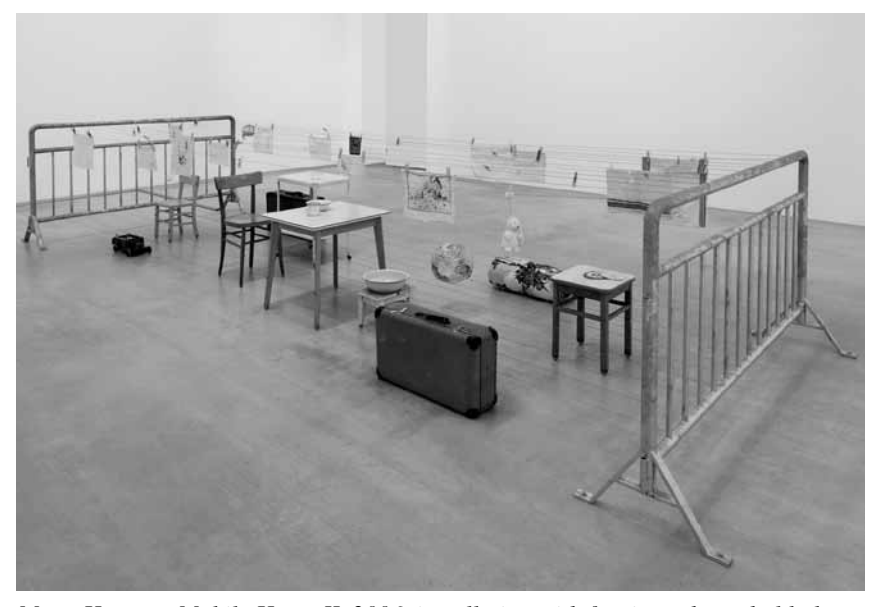
Mona Hatoum, Mobile Home II, 2006, installation with furniture, household objects, suitcases, galvanized steel barriers, electric motors and pulley system (119 x 220 x 600 cm), photo: Jens Ziehe, courtesy: White Cube, London.

As in Braidotti's exploration of a "nomadic" aesthetics, the question of style is inextricably linked with the question of the political: the nomadic artist destabilizes commonsensical meanings, translates between different cultural realities, and deconstructs hegemonic formations of