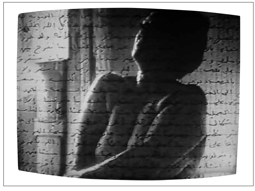
Mona Hatoum, Measures of Distance, 1988, colour video with sound (duration: 15 minutes), courtesy White Cube, London.

This is a scene that echoes the work of Jean-Luc Nancy, for whom the body is an open space that is more spacious than spatial; it is a place, a place of existence. As it is equated with the multiple eventualities of the skin, which is variously folded, refolded, unfolded, invaginated, exogastrulated, orificed, evasive, invaded, stretched, relaxed, excited, and distressed, the body makes room for existence (2008: 15). Similarly, the skin becomes for Hatoum "the place for an event of existence" (Nancy, 2008: 15). It bespeaks the corporeal eventness of performativity –an awkward materiality that eludes any programmatic figuration or calculable materialization, and opens up to a certain disposition of the self towards the other. The corporeal subject is enacted as fundamentally social in its sensual openness, vulnerability and physical interrelation to the other. Incorporating the other, the subject opens up –and gives room- to the radical contingency of engagement where the other is not reduced to the proper logic of possession. In the contrary, the other seems to have a knowledge of her own and reveal us in new, intimate and unforeseeable ways. It is suggestive, in that respect, that the endoscopic camera and medical science know and expose, in the most intimate details, the artist's own body.