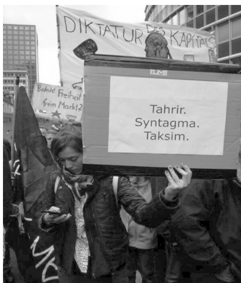
Somewhere in Europe in 2013

Moreover, the political process is not characterized by equitable distribution of power. Civil society is certainly not a homogeneous realm, with some organizations being closer to power than others thus accepting for themselves a relative loss of autonomy in order to sustain whichever benefits for their members or, simply, to extract more funding and protection for their organizations. These organizations which gain in terms of increased legitimacy, more access to funds and therefore more political power, have an additional advantage with regards to framing the issues which are deemed socially relevant (Mawson, 2010). Increased leverage in the political process means that a substantial number of organizations will compete fiercely for limited funds, which in turn means that they shift further away from grassroots political cultures and become aligned with the dominant political system.