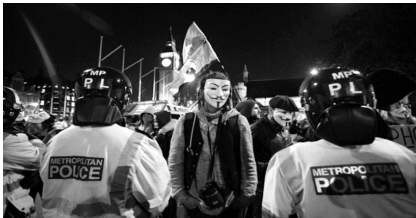
Million Mask March photo, The Guardian, 5th November 2015

It is also a reflection of a particular variety of ‘youth culture’ which is relying heavily on the Internet and its various social media configurations and aesthetic types (Pew Research Center, 2010). This point of view could be associated with contemporary perceptions on the prolongation of youthfulness as a way of life. Gadgets, alongside an understanding of the language that describes them, play a role in sustaining and perpetuating contemporary material culture. You don’t have to be particularly young to be hip. You just have to ‘follow’ trendsetters.