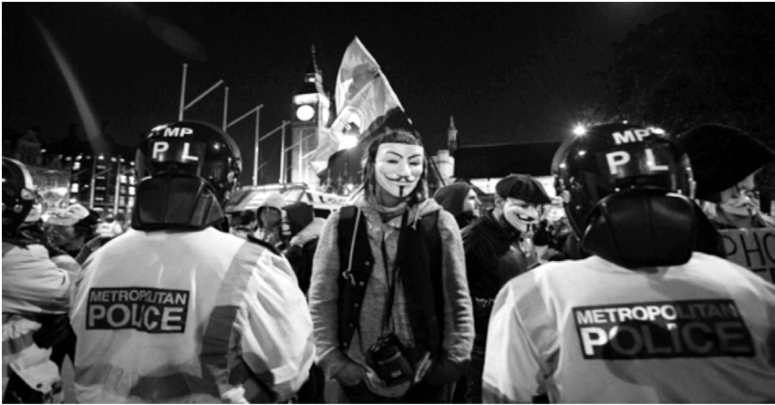
Million Mask March photo, The Guardian , 5th November 2015

It is also a reflection of a particular variety of ‘youth culture’ which is relying heavily on the Internet and its various social media configurations and aesthetic types (Pew Research Center, 2010). This point of view could be associated with contemporary perceptions on the prolongation of youthfulness as a way of life. Gadgets, alongside an understanding of the language that describes them, play a role in sustaining and perpetuating contemporary material culture. You don’t have to be particularly young to be hip. You just have to ‘follow’ trendsetters.