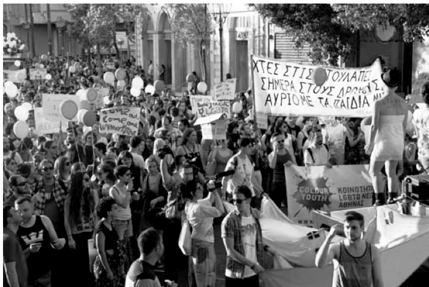
LGBTQ community demonstrating in Athens, 2015. The main message reads, ‘yesterday in the closet-today on the streets-tomorrow with our children’

Politics and political culture(s) thus, are not necessarily re-negotiated because of the existence of the medium. Rather, digital platforms reflect, or ‘replicate’ as Margolis and Moreno-Riano (2009) argue, the offline world. In the case of, for example, the Athens Syntagma Square ‘indignados’, the Net functioned as a tool which assisted the organizing of mobilizations by