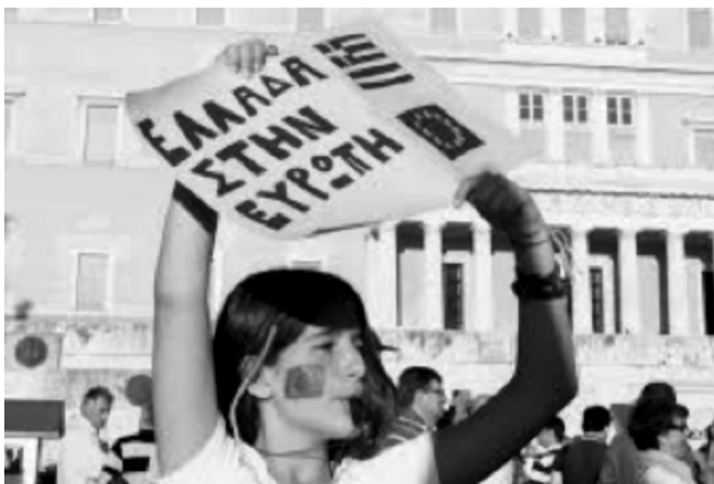
Menoume Evropi demonstration, 2015. The banner reads ‘Greece in Europe’

‘Menoume Evropi’ appeared to be a, profoundly liberal, quick response to the Syntagma Square demonstrations which primarily problematized the whole context of liberal political rationality but could not offer an alternative. Ephemerality was a common element in both sets of popularized movements as well as the extended use of social media to communicate their respective concerns.