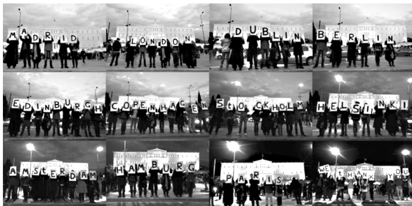
Athens, ‘Thank You banner’ 18.02.2012. It went viral for a day or two.

One can argue that, the primarily binary identity of the demonstrators themselves, namely the distinction between those who raised issues concerning alternatives ways to organize democracy and those who protested because their individual rights were violated, became a matter of digital presentation by various journalistic and academic sources. Individual stories and videos of protesters went side by side with more ‘refined’ intellectual and academic analyses on the context and the political message of events. In discursive terms, popular language was used to describe individual and collective activity. Demonstrators became heroes, or villains, holders of a new political discourse, or simply populists who did not understand what is at stake. Demonstrations became, for a while, spectacular objects to be admired or condemned.