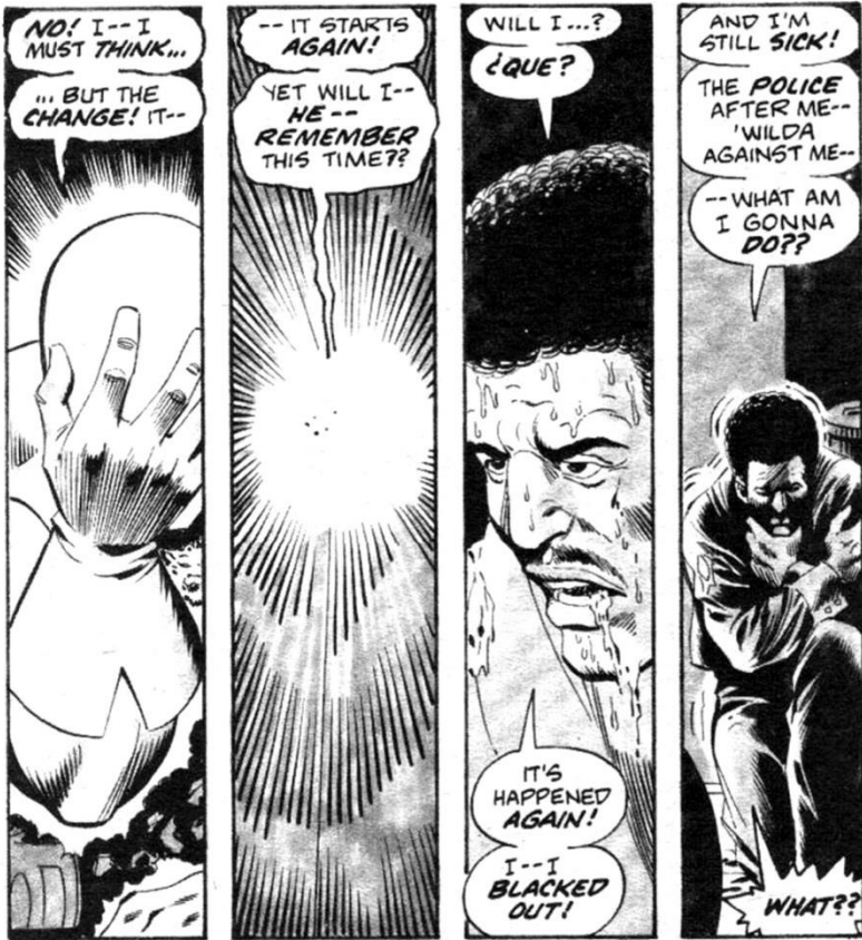
Fig. 6. Sick again. ( Deadly Hands of Kung Fu #21 (February 1976), 62. ©Marvel)