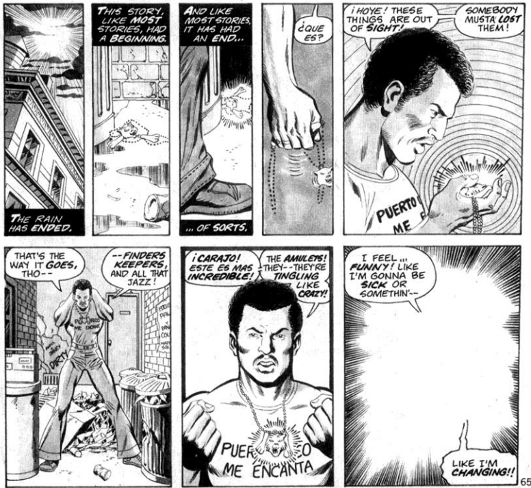
Figure 1. In case there were any doubts, Hector Ayala performs his Puerto Rican identity. ( Deadly Hands of Kung Fu #19 (December 1975), 65.).

Right from the beginning of Hector’s Ayala journey in Deadly Hands #19, a series of visual and linguistic elements are deployed to confirm hegemonic stereotypes. Even before we see the character, we can “hear” his otherness through his first words in broken Spanish: “¿Que [sic] es?” In the next panel, physical features (hair, moustache) and quickly ascribed nationality (see “Puerto Rico me encanta” t-shirt in figure 1) provide the shorthand that allows the reader to identify the newly introduced character as a Puerto Rican youth.