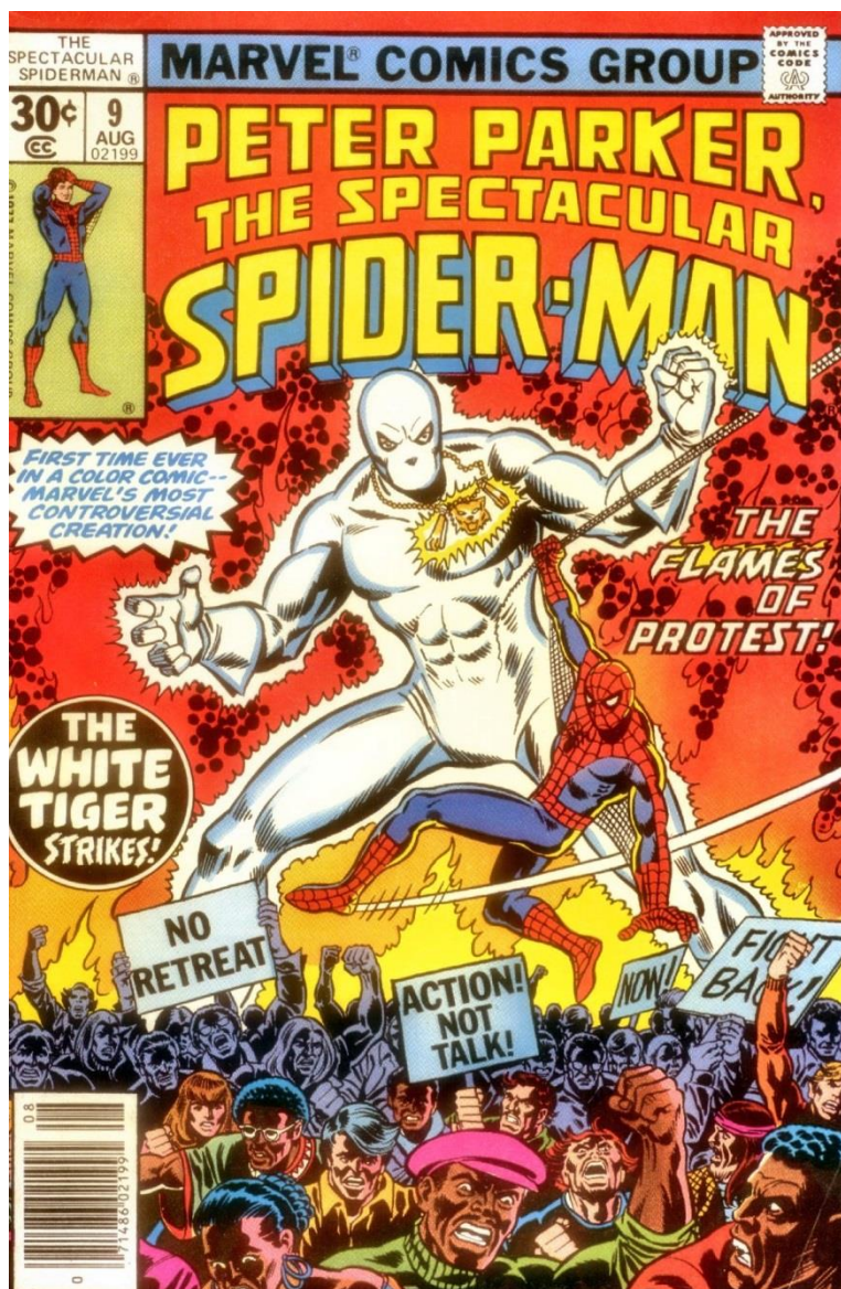
Fig. 9. Glorious and controversial cover. Peter Parker, the Spectacular Spider-man #9 (August 1977). ©Marvel

It is necessary to highlight that in his transition from the world of black and white magazines to the color of standard