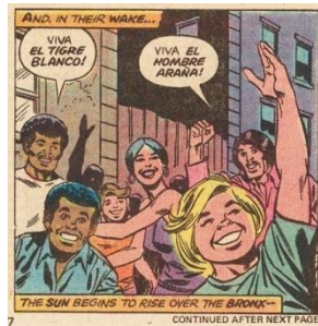
Fig. 11. The sun begins to rise over the Bronx, and over Hector Ayala. Peter Parker, the Spectacular Spider-man #10, 27 (September 1977).