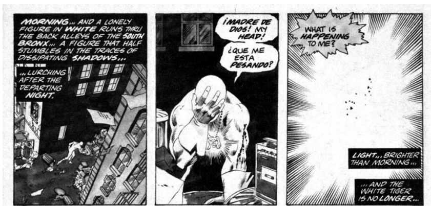
Fig. 3. ¿Qué me está pesando [ sic ], Madre de Dios? ( Deadly Hands of Kung Fu #20 (January 1976), 59.)