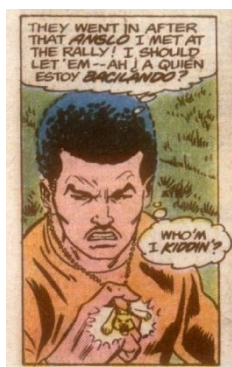
Fig. 4. Only yourself, Hector, only yourself. Peter Parker, the Spectacular Spider-man #9 (August 1977), 7. ©Marvel)

Bilingualism, code-switching, different roles and spaces for each language, and diverse proficiencies in languages are all part of the Latina/o experience. The inner self-translating appearing in these comics, however, is slightly different, and it supports the racializing of Puerto Ricans as colonized subjects, who replicate within their own minds the language of the metropolis. To a degree, this instant, internal self-translation indicates a narrative desire to read Puerto Ricans, and by extension other Latinas/os, as alienated from their own language, or the language of their country of origin, to