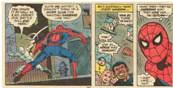
Fig. 10. And, suddenly, as if by magic, White Tiger finally becomes... ¡el héroe del barrio! Peter Parker, the Spectacular Spider-man #10, 22 (September 1977).

comic books, White Tiger will forget a lot of the problems of identity that he had presented in Deadly Hands , and, in fact, he will effortlessly be cheered by the people in the barrio. As if by magic, his representativeness, as both a character and a superhero, will no longer be in question, and this might be the basis for future Latina/o superheroes to fondly remember and respect him for reasons that the long-time reader will be unaware of.