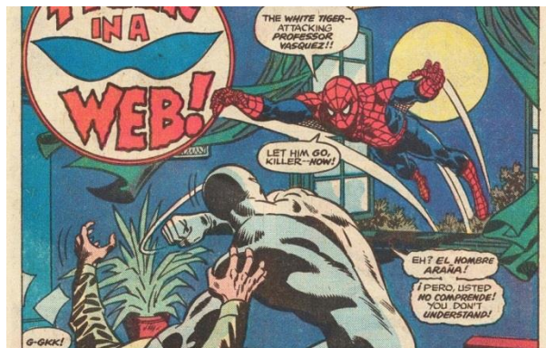
Fig. 2. Usted no comprende que you don't understand. ( Peter Parker, the Spectacular Spider-man #10 (September 1977), 1. ©Marvel).

characters are being constructed as having a doubly problematic relationship with Spanish: they do not speak Puerto Rican Spanish or Nuyorican Spanglish properly, and the use of Spanish is immediately neutralized when the information is repeated in English.