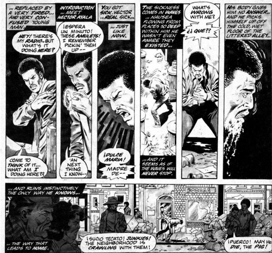
Fig. 5. Hector Ayala and the symptoms of being a superhero. (Deadly Hands of Kung Fu #20 (January 1976), 59. ©Marvel)