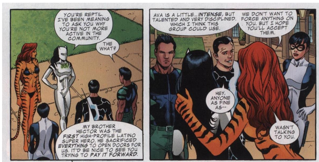
Fig. 12. An intense legacy of intensity. ( Avengers Academy #21 (January 2012), 17. ©Marvel)

When Ava is introduced as part of a slate of young superheroes joining the “Avengers Academy,” the idea of legacy is immediately introduced through her confrontation and dialogue with Reptil, another young Latino superhero. First, Ava mentions the fact that she is following on her brother’s footsteps: “It’s a family legacy. One I’ll never stop working to honor.” 41 However, after analyzing the way in which stereotypes structure Hector Ayala, and his problematic relationship to the idea of community, it is difficult to understand the next mention of his legacy: