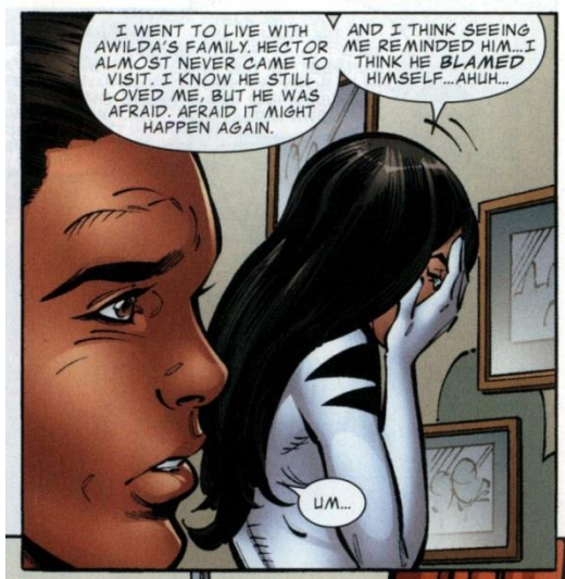
Fig. 14. He really loved her, even though he did not seem aware of her existence. ( Avengers Academy #24 (March 2012), 9.)

The case of Ava is more mystifying yet. When readers are introduced to the Ayalas, the parents are shown as middle-aged, and there is absolutely no mention of a fourth sibling: Awilda is presented as his only sister, and it is clearly implied that Filippo and Hector are the remaining members of the family. When, in Peter Parker #49, Hector's parents and Awilda get killed in a random display of senseless violence by a character called Gideon Mace, neither a younger sister (Ava) nor Awilda's daughter (Ángela) are mentioned. Both of them would have become orphaned minors at that point. After a series of adventures in which Hector almost dies at the hands of Mace, he decides to leave New York on a bus with his girlfriend. In the farewell dialogue between Peter Parker and Hector Ayala, there is no talk about a younger sister and the responsibility her existence would entail for Hector, his only close relative. On the contrary, it is implied that he has nothing or no one left to keep him in the city. This makes Ava's scenes in Avengers Academy more puzzling, since they make her brother, whose stories ignored her existence, such an integral part of her life.