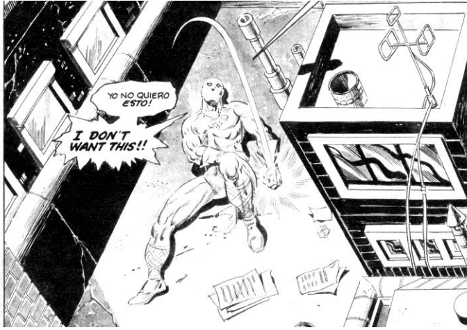
Fig. 8. Just in case any casual readers happened to pick up Deadly Hands #30 without any prior knowledge of the White Tiger, and assumed him to be a “white” character, he screams in Spanish (and self-translates, to be sure). ( Deadly Hands of Kung Fu #30 (November 1976), 11.)

Consequently, the stories centered around him will continuously problematize identity (in regards to Hector’s fragile self, as well as in regards to the oversymbolization of minority representation), and deny him closure as well as agency. The instability that he brings to narrative as a character will only be controlled when, at the end of Deadly Hands #32, his initial cycle is abruptly finished. Ironically, he returns as a character in the full color Peter Parker: The Spectacular Spider-man #9, the first of an already mentioned two-partner starring Spider-man and White Tiger that focused on minorities, higher education, cuts in public services, and protests. In the cover, a tagline describes the White Tiger, puzzlingly, as “Marvel’s Most Controversial Creation!” which he very well might be, although probably not in the sense that the comic’s editor or writer had in mind.