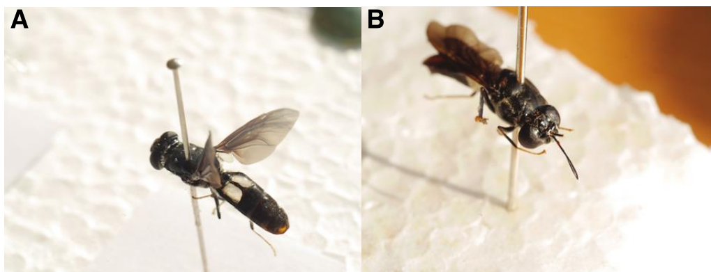
FIG. 1. (A) Female adult of H. illucens (missing antennae) caught at Kampos of Agiassou, Naxos and (B) female adult of H. illucens (left antenna damaged) caught at Alimos, Athens.

such as rotting fruits and vegetables, animal manure and human excreta, achieving a dry mass reduction of ca. 55% (Sheppard 1983, Newton et al. 2005, Myers et al. 2008, Diener et al. 2011). Larvae can reach 27 mm in length and are whitish in color with a small, projecting head containing chewing mouthparts.