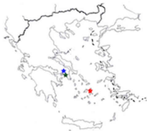
FIG. 2. Locations of where H. illucens was recorded (red asterisk: Kampos; blue asterisk: Aigaleo; green asterisk: Alimos).

recycling. More specifically, H. illucens larvae have the potential of improving organic waste into a rich fertilizer (Diciaro II and Kaufman 2015). Furthermore, presence of H. illucens larvae repels oviposition