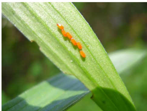
FIG. 3. Eggs of L. lilii on the underside of Lilium leaves.

thick fecal shield and feed on leaves, flowers and buds (Fig. 4). Larval development requires about 3 weeks outdoors. Mature larvae build a white cocoon in the soil, in which pupation occurs. In England (Cox 2001) and also in Bosnia and Herzegovina (Brzica 2011), the new generation adults were observed in mid-June but in outdoor rearing in Switzerland, the first adults appeared on 31 July, nearly 2 months after the larvae had entered the soil (Haye and Kenis 2004). Newly emerged adults first feed on lilies and, perhaps, other plants before finding overwintering sites (Fig. 5). They neither mate nor oviposit before the winter (CABI/EPPO 2012) (Fig. 6).