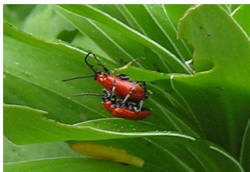
FIG. 6. Adults of L. lili mating.

Thomson (Hymenoptera: Eulophidae) has been released against L. lili in New England, USA, and has become established at several release sites, where pest populations have declined (Tewksbury et al. 2005). Dia-parsis jucunda (Holmgren) and Lemophagus errabundus (Gravenhorst) (Hymenoptera: Ichneumonidae) have also been released to complement the action of T. setifer and their impact is presently being assessed.