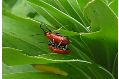
FIG. 6. Adults of L. lili mating.

(Hymenoptera: Eulophidae) has been released against L. lili in New England, USA, and has become established at several release sites, where pest populations have declined (Tewksbury et al. 2005). Diaparsis jucunda (Holmgren) and Lemophagus errabundus (Gravenhorst) (Hymenoptera: Ichneumonidae) have also been released to complement the action of T. setifer and their impact is presently being assessed.