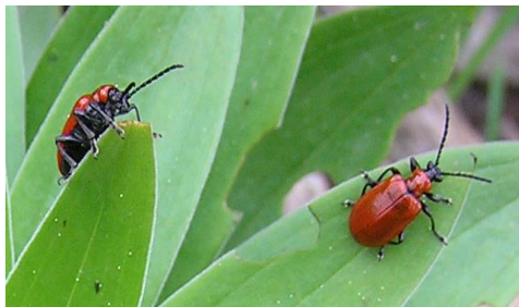
FIG 2. Adults of L. lilii .

Adults overwinter in soil, litter and debris and emerge in spring to mate and feed on the first leaves of Lilium and Fritillaria . At 25°C, adults have a pre-oviposition period of about 2 weeks. The first eggs (in rows of 2-16 on the underside of leaves) (Fig. 3) are laid in early April in Massachusetts and the UK, in late April in Switzerland (Livingston 1996, Cox 2001, Haye and Kenis 2004) and in Bosnia and Herzegovina from late of February and March (Brzica 2011). Oviposition occurs from spring to late summer, as long as fresh lily leaves are available. At 22°C, the egg stage lasts 6-7 days (Haye and Kenis 2004). Each female can lay over 300 eggs (Cox 2001). First-instar larvae feed on the leaf surface, whereas older instars feed on the complete leaves, starting from the margin and as the lower leaves are consumed they move upwards to locate undamaged leaves. Fourth instar larvae are covered by a