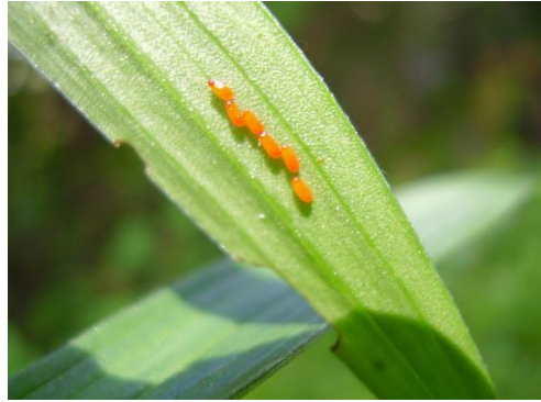
FIG. 3. Eggs of L. lili on the underside of Lilium leaves.

thick fecal shield and feed on leaves, flowers and buds (Fig. 4). Larval development requires about 3 weeks outdoors. Mature larvae build a white cocoon in the soil, in which pupation occurs. In England (Cox 2001) and also in Bosnia and Herzegovina (Brzica 2011), the new generation adults were observed in mid-June but in outdoor rearing in Switzerland, the first adults appeared on 31 July, nearly 2 months after the larvae had entered the soil (Haye and Kenis 2004). Newly emerged adults first feed on lilies and, perhaps, other plants before finding overwintering sites (Fig. 5). They neither mate nor oviposit before the winter (CABI/EPP0 2012) (Fig. 6).