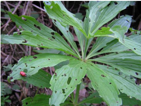
FIG. 5. Adult of L. lili damaging L. martagon plant.

Lilioceris lili is currently the target of a biological control program using larval parasitoids from Europe (Kenis et al. 2003, Tewksbury et al. 2005). Tetrastichus setifer