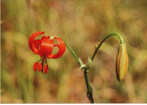
FIG. 1. Scarlet martagon lily, Lilium chalcedonicum L.