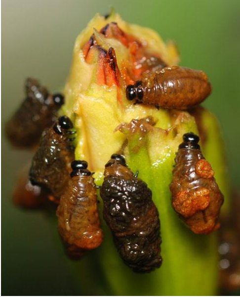
FIG. 4. Larvae of L. lili damaging bud.

level is often low. If chemical control is necessary, preference should be given to azadirachtin rather than to more toxic chemicals (CABI/EPPO 2012).