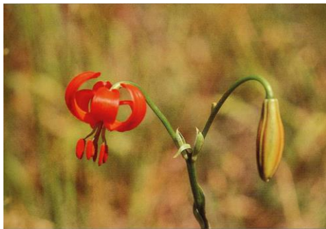
FIG. 1. Scarlet martagon lily, Lilium chalcedonicum L.