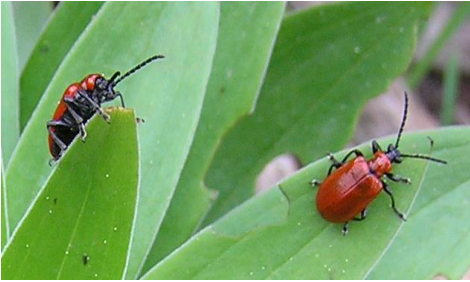
FIG 2. Adults of L. lili .

Adults overwinter in soil, litter and debris and emerge in spring to mate and feed on the first leaves of Lilium and Fritillaria . At 25°C, adults have a pre-oviposition period of about 2 weeks. The first eggs (in rows of 2-16 on the underside of leaves) (Fig. 3) are laid in early April in Massachusetts and the UK, in late April in Switzerland (Livingston 1996, Cox 2001, Haye and Kenis 2004) and in Bosnia and Herzegovina from late of February and March (Brzica 2011). Oviposition occurs from spring to late summer, as long as fresh lily leaves are available. At 22°C, the egg stage lasts 6-7 days (Haye and Kenis 2004). Each female can lay over 300 eggs (Cox 2001). First-instar larvae feed on the leaf surface, whereas older instars feed on the complete leaves, starting from the margin and as the lower leaves are consumed they move upwards to locate undamaged leaves. Fourth instar larvae are covered by a