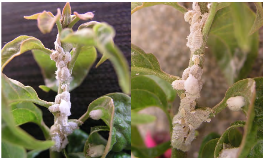
FIG. 1. Bougainvillea infested by the mealybug Phenacoccus peruvianus .

similar to other species of mealybugs, by sap sucking and by honeydew secretion, which serves as a substrate for the development of sooty mold. Studies on the natural enemies of P. peruvianus in the Mediterranean revealed high levels of parasitization by a species belonging to the genus Acerophagus , which is believed to have been accidentally introduced to the area (Beltra et al. 2013). Mealybugs are considered major invasive group and currently one out of four of the mealybug species recorded in Europe are alien species (Pellizzari and Germain 2010).